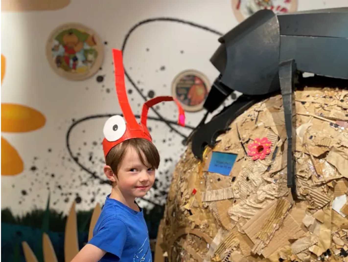
A child engages with the cardboard dung beetle whose story promotes recycling.

This exhibition focused on stories from the natural world that demonstrate adaptability and flexibility as a way to combat the sense of overwhelm which is recognised as a growing negative on children's wellbeing and mental health.