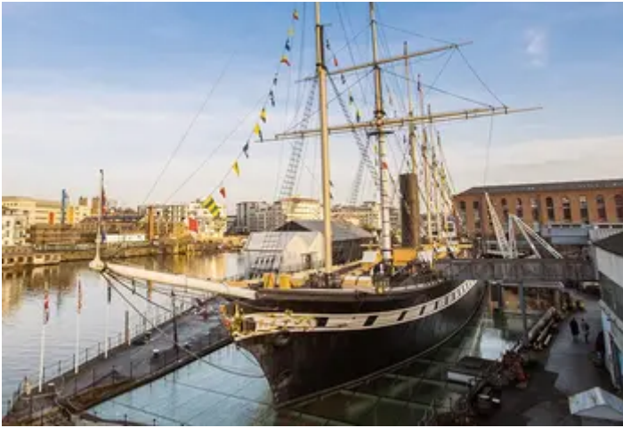
Brunel's SS Great Britain in the dry dock.

Find out how to embed environmental sustainability in your heritage project .