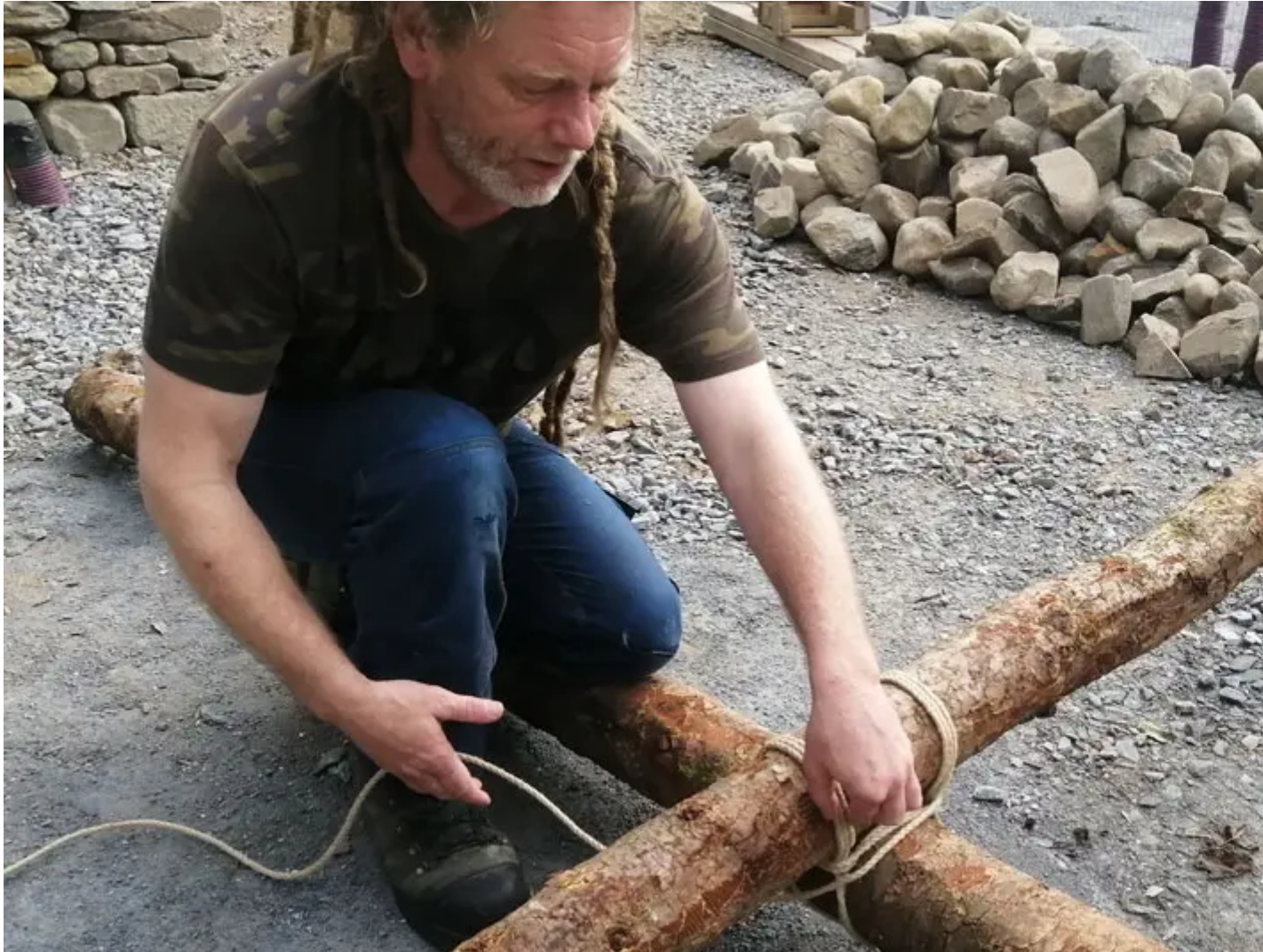
Building a crannog with locally sourced materials.

Following a devastating fire in 2021, The Scottish Crannog Centre has built a new museum using locally sourced materials, skills and sustainable resources.