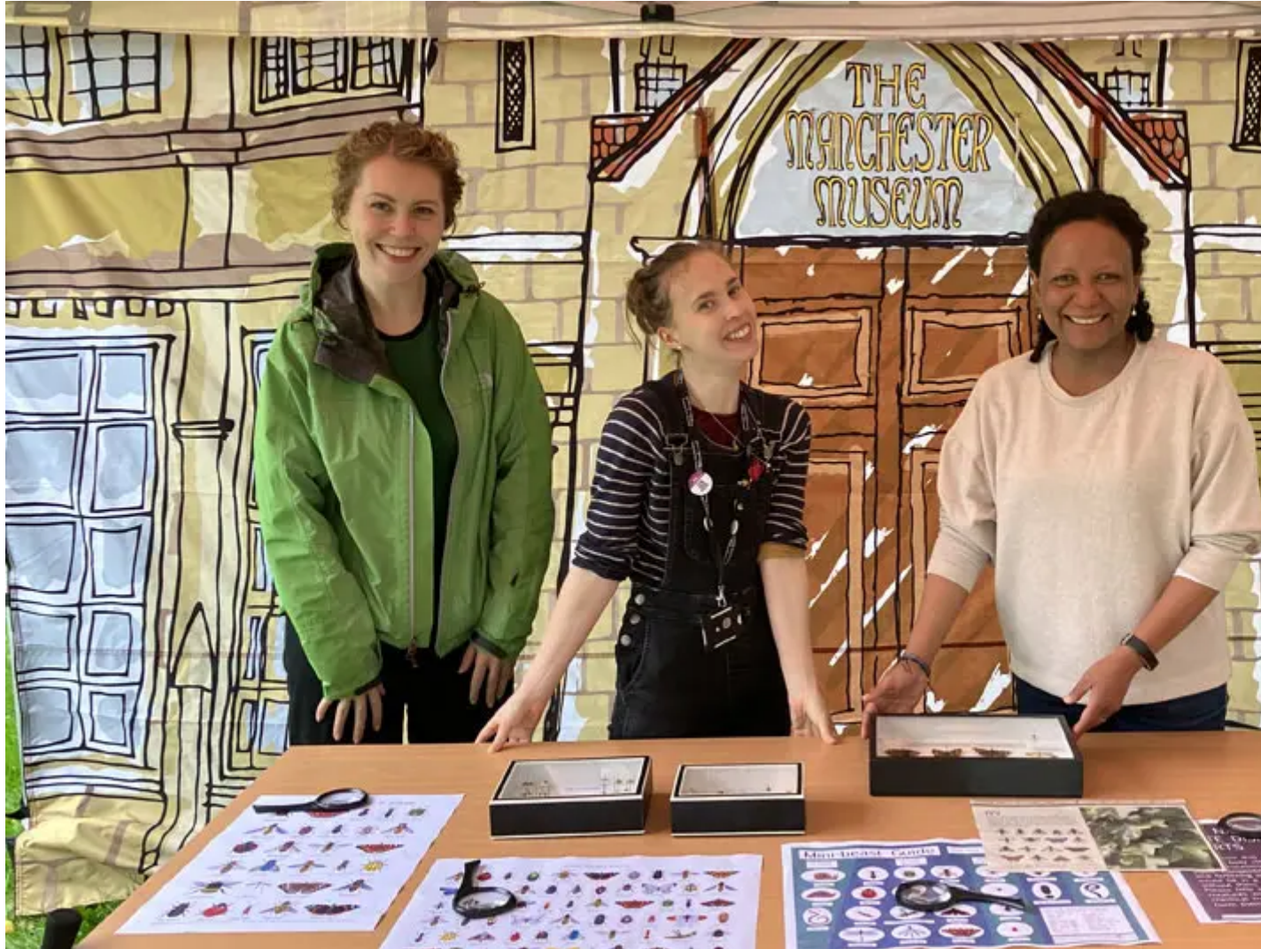
Manchester Museum staff on their pop-up stand at Ardwick Climate Action Day.

Roots & Branches creates opportunities for museums to gain and exchange skills and knowledge, and test initiatives which advance and embed sustainable thinking.