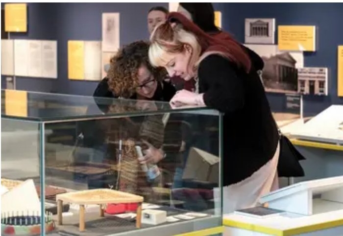
It became Northern Ireland's newest venue