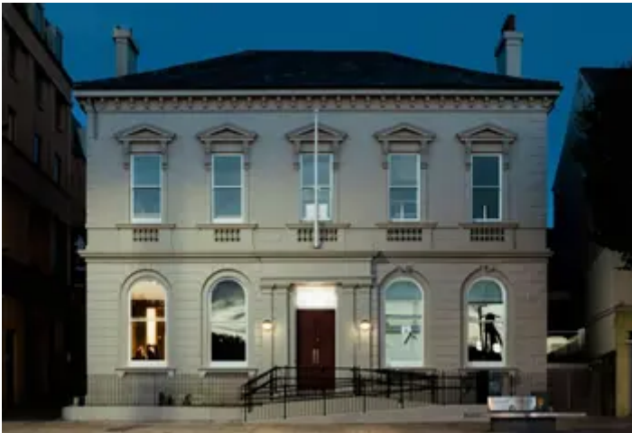
The Court House, Bangor.

Find out who else has won a National Lottery Award or explore more of the inspirational projects we've supported over the years .