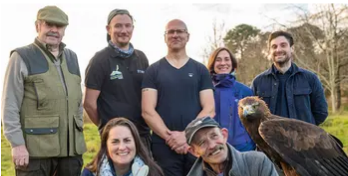
Players and heritage audiences