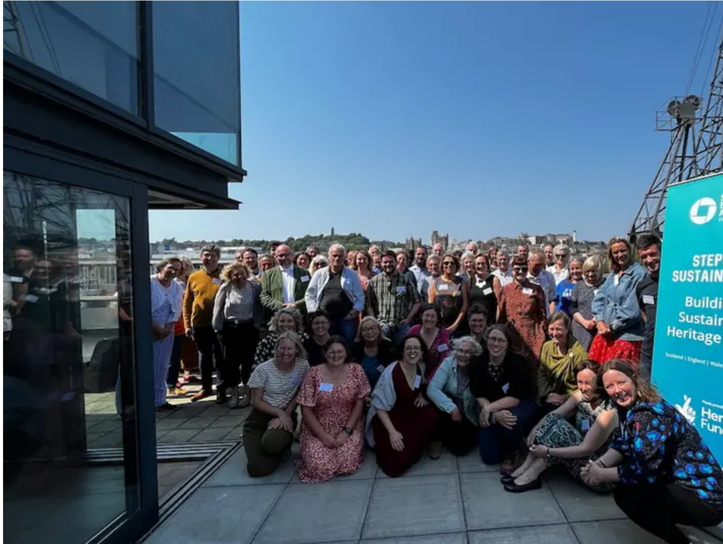
90 organisations took part in Social Enterprise Academy's enterprise development programme.

As the campaign comes to a close, we've collected a summary of learnings and advice from the organisations who took part.