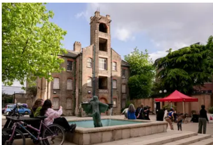
Alice Billings House, Stratford

Seven more organisations have been awarded development funding to finalise plans for creating community hubs for engagement, education, creativity and wellbeing: