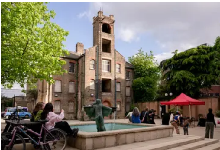
Alice Billings House, Stratford

Seven more organisations have been awarded development funding to finalise plans for creating community hubs for engagement, education, creativity and wellbeing: