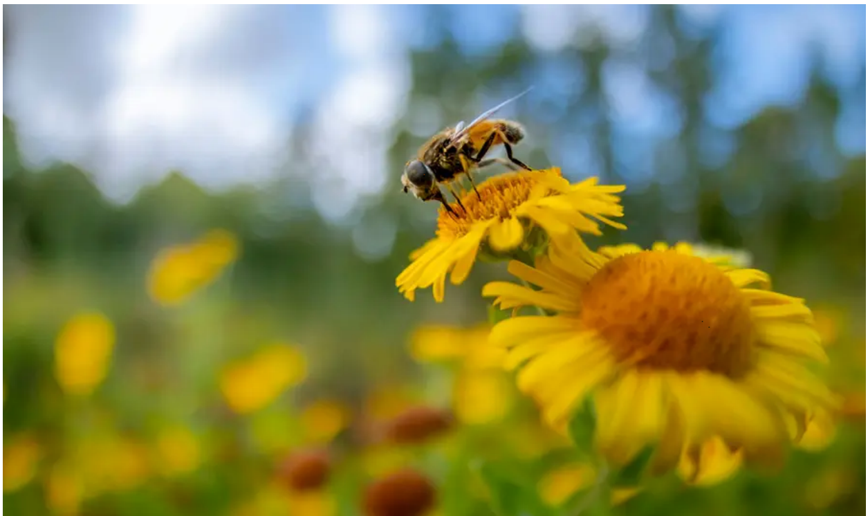
Drone fly, Somerset © Neil Aldridge/Back from the Brink.

"Heritage 2033 was developed with your input, and we're looking forward to collaborating with you to deliver our shared vision for heritage over the years ahead."