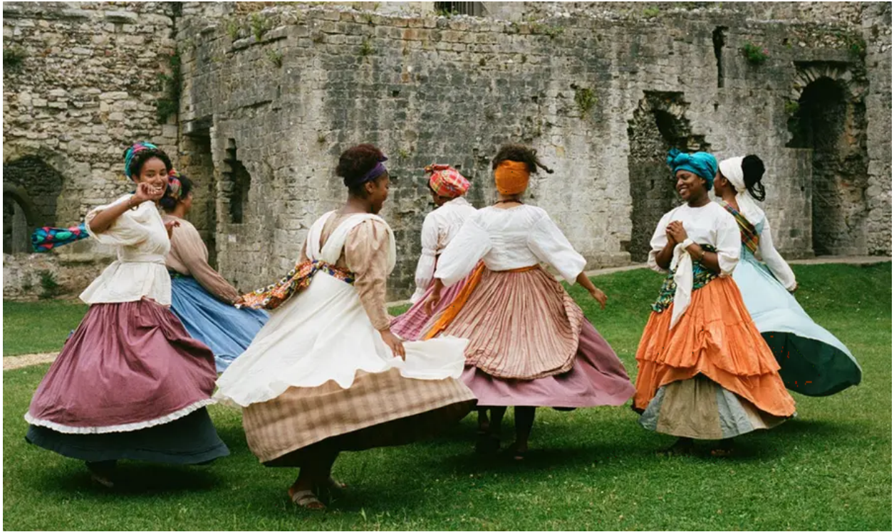
Porchester Castle, Hampshire © Sadé Elufowoju/National Youth Theatre.