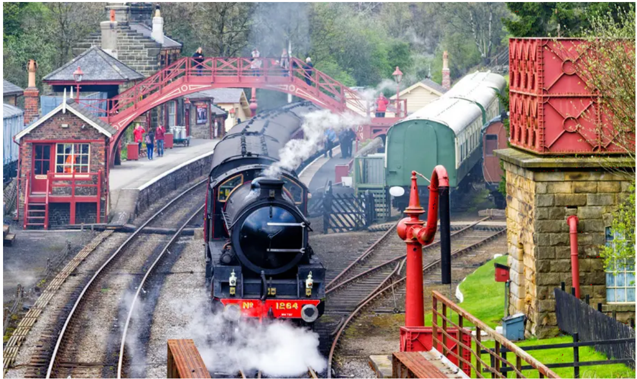
North York Moors Railway