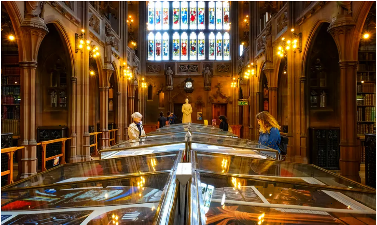
John Rylands Library, Manchester

“We will be interested to see how the strategic initiatives pan out in the environmental sector.”