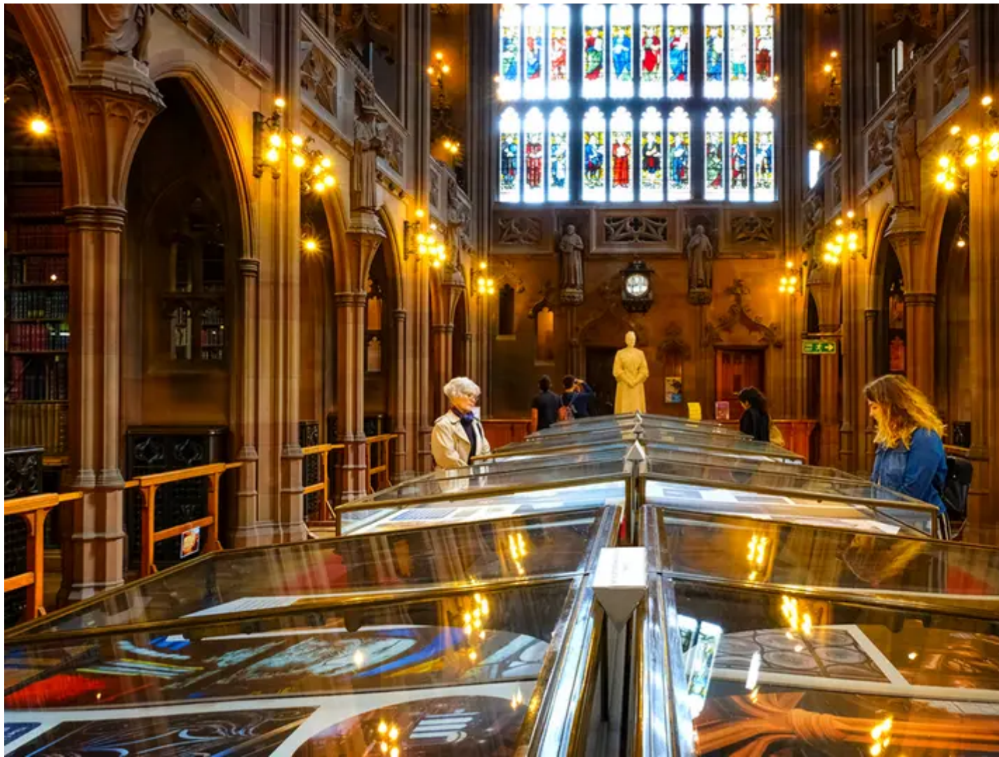
John Rylands Library, Manchester