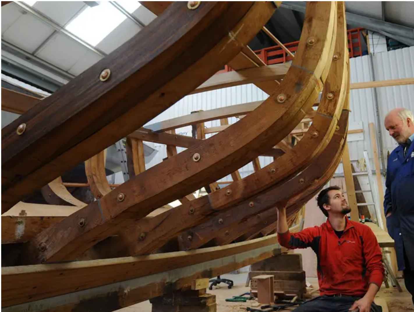
Land & Sea traditional boat skills, Brightlingsea.

“It will enable visionary thinking beyond short term unsustainable project based interventions.”