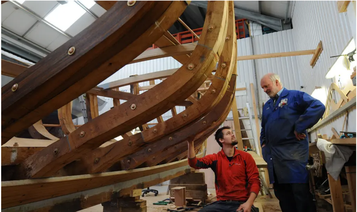
Land & Sea traditional boat skills, Brightlingsea.

"It will enable visionary thinking beyond short term unsustainable project based interventions."