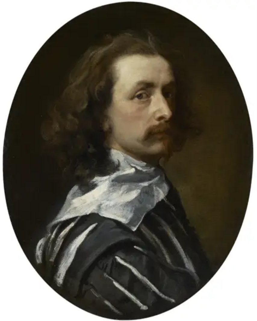
Sir Anthony van Dyck by Sir Anthony van Dyck, circa 1640 © National Portrait Gallery, London.

As one of the most acclaimed royal portraitists of all time, van Dyck was usually found on the other side of the canvas. This self-portrait is said to be one of the finest ever created. It was saved for the nation in 2014 thanks to multiple supporters including a £6.3m grant from the Heritage Fund.