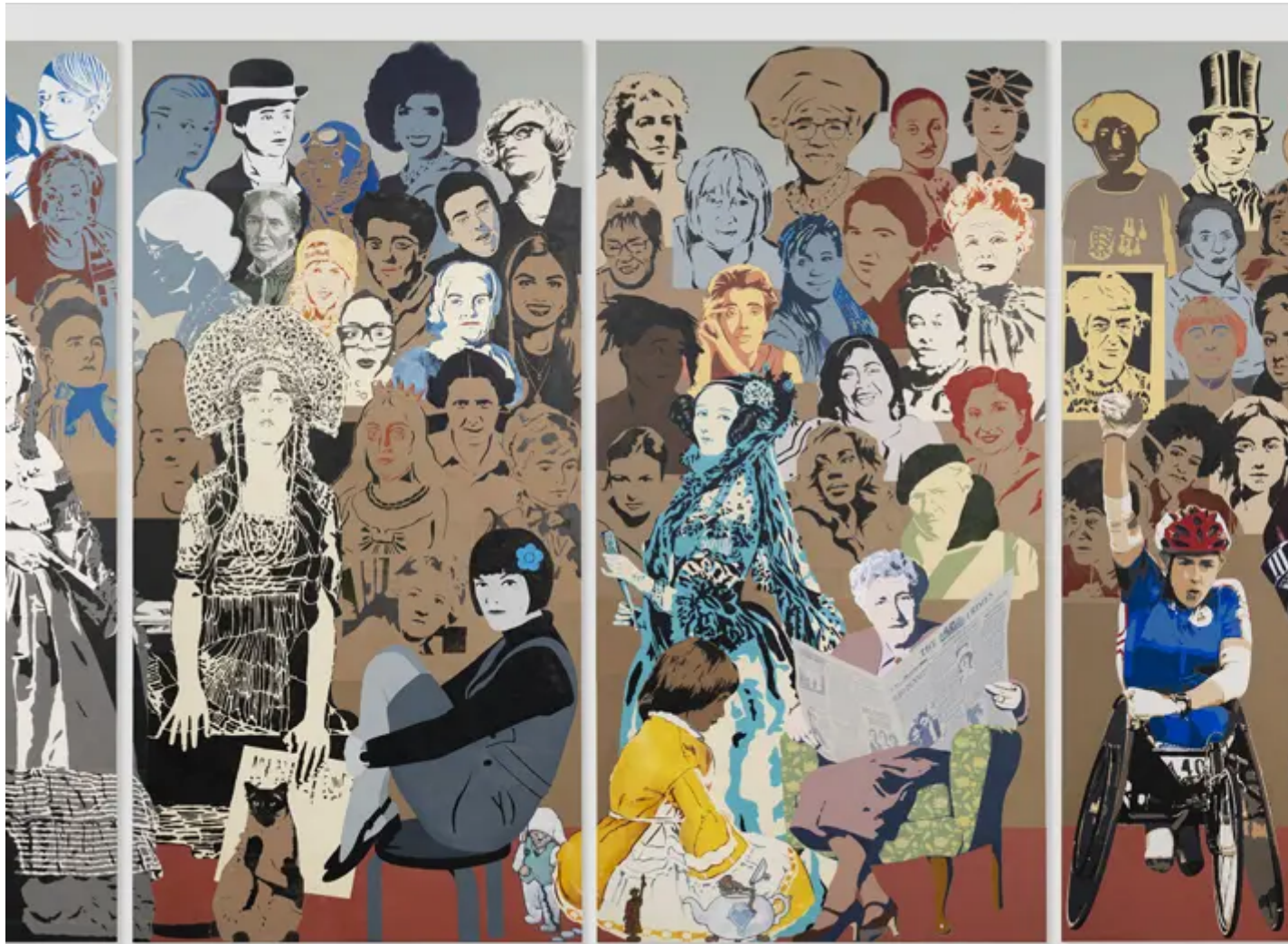
Detail of Work in Progress by Jann Haworth and Liberty Blake, 2021–2022. Commissioned with kind support from the CHANEL Culture Fund for 'Reframing Narratives: Women in Portraiture', 2023.