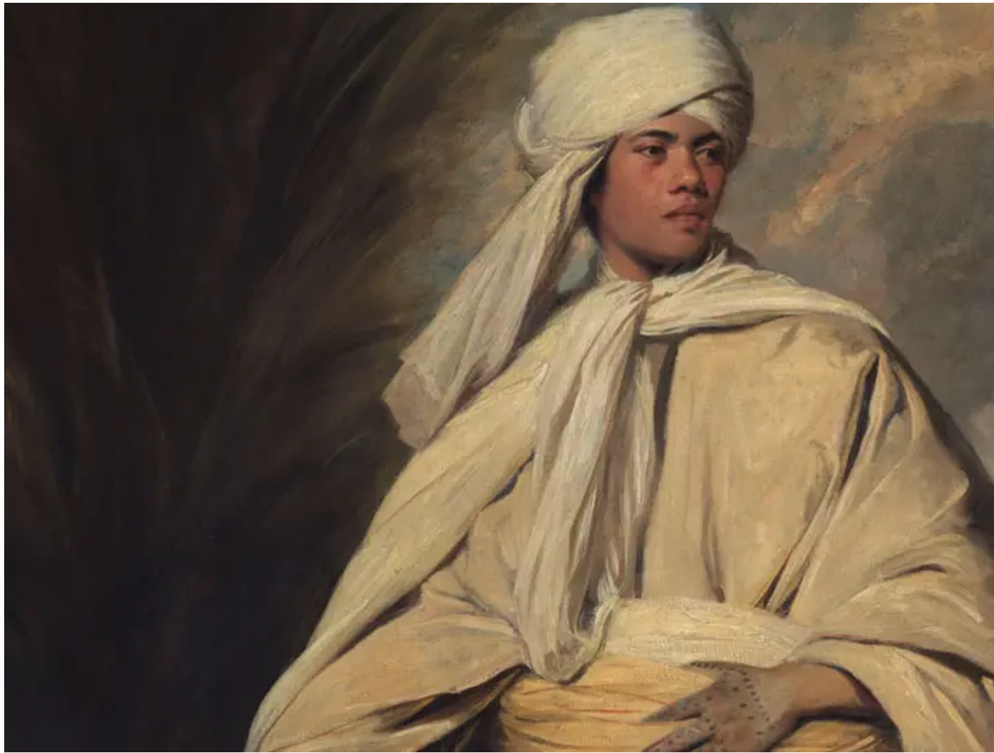
Close up of Portrait of Mai (Omai) by Sir Joshua Reynolds, circa 1776.

Widely regarded as the finest portrait by one of Britain's greatest artists, it depicts the first Polynesian to visit Britain. The painting was saved for the UK following a historic fundraising campaign, including an exceptional £10m grant from the National Heritage Memorial Fund .