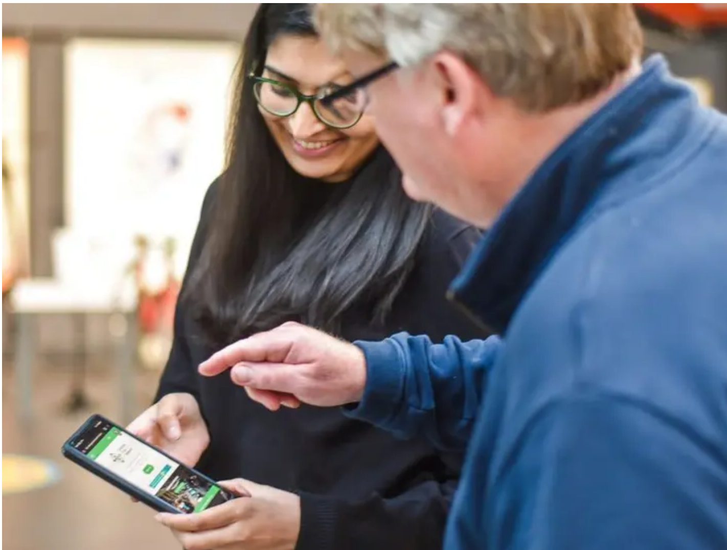
A young woman sharing her digital skills.

Its 730-strong membership is increasingly reflecting that outreach work. It spans traditional heritage organisations, community and arts groups using historic sites, as well as those looking after canals and gardens. It also counts more than 160 students among its membership.