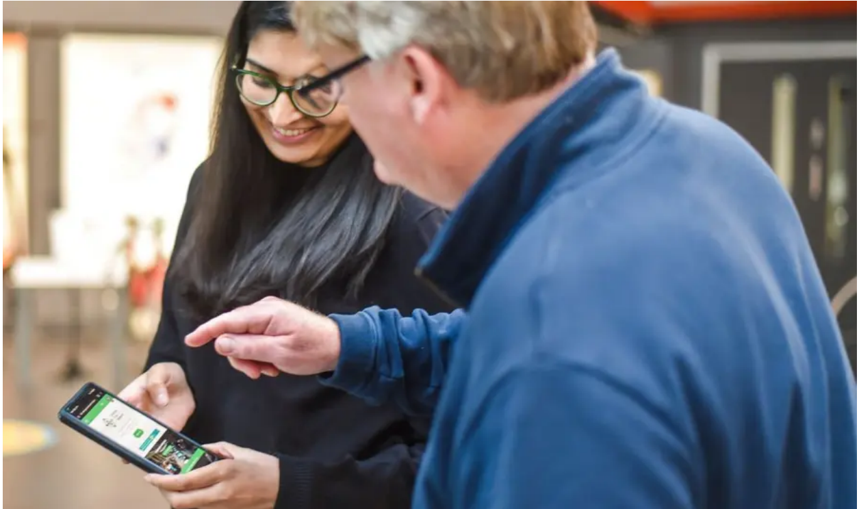
A young woman sharing her digital skills.

Its 730-strong membership is increasingly reflecting that outreach work. It spans traditional heritage organisations, community and arts groups using historic sites, as well as those looking after canals and gardens. It also counts more than 160 students among its membership.