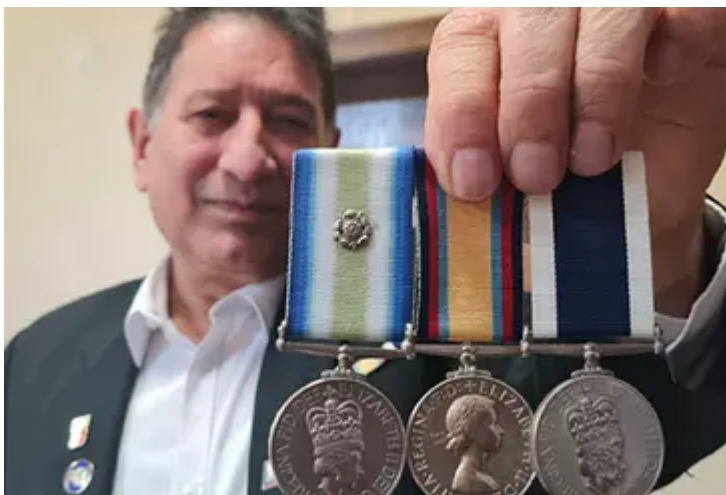
Commonwealth Contribution Memories.

Pupils from Bowling Park Primary School worked with a local author, illustrator and historian to create an immersive picture book telling the story of Bradford.