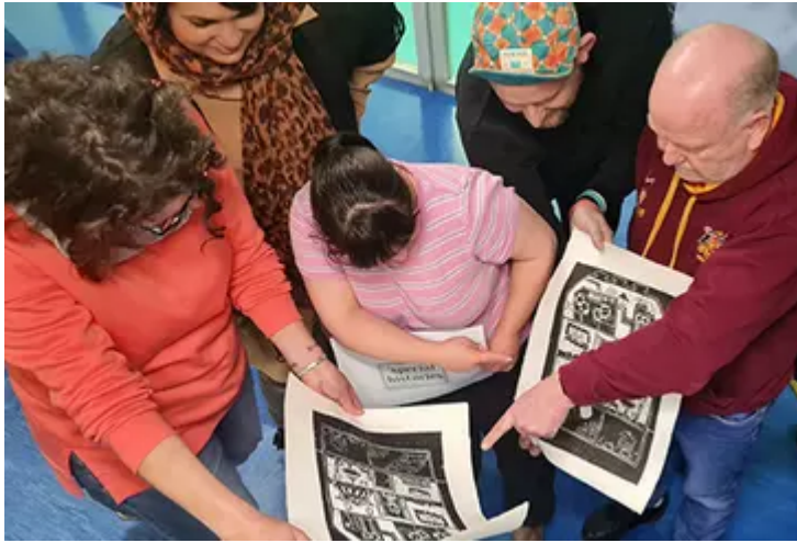
'Special' Histories of Bradford.