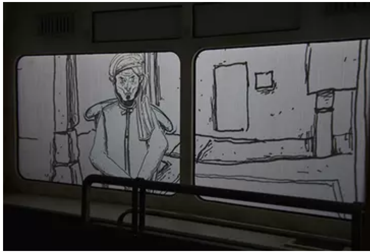
Bussing Out artwork.