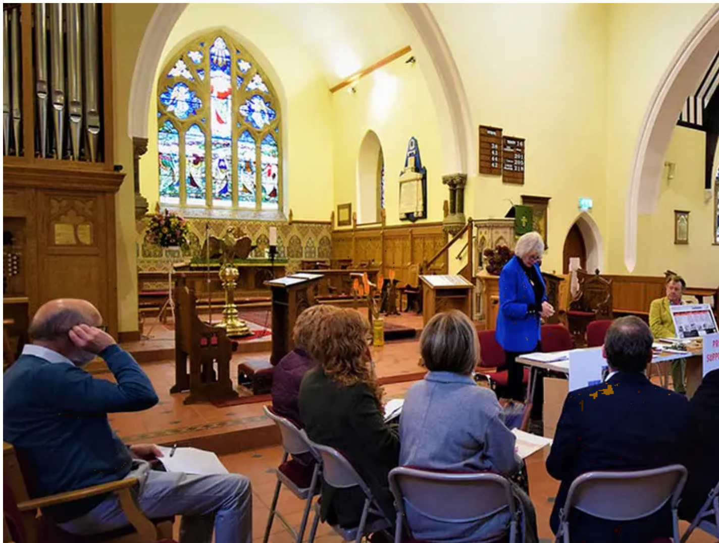
A places of worship forum taking place in Northern Ireland, part of the Treasure Ireland project.

“As well as providing much needed immediate help and practical support, this partnership will allow us to develop new ways of supporting churches and chapels so that they can remain open and available, in use and valued by all.”