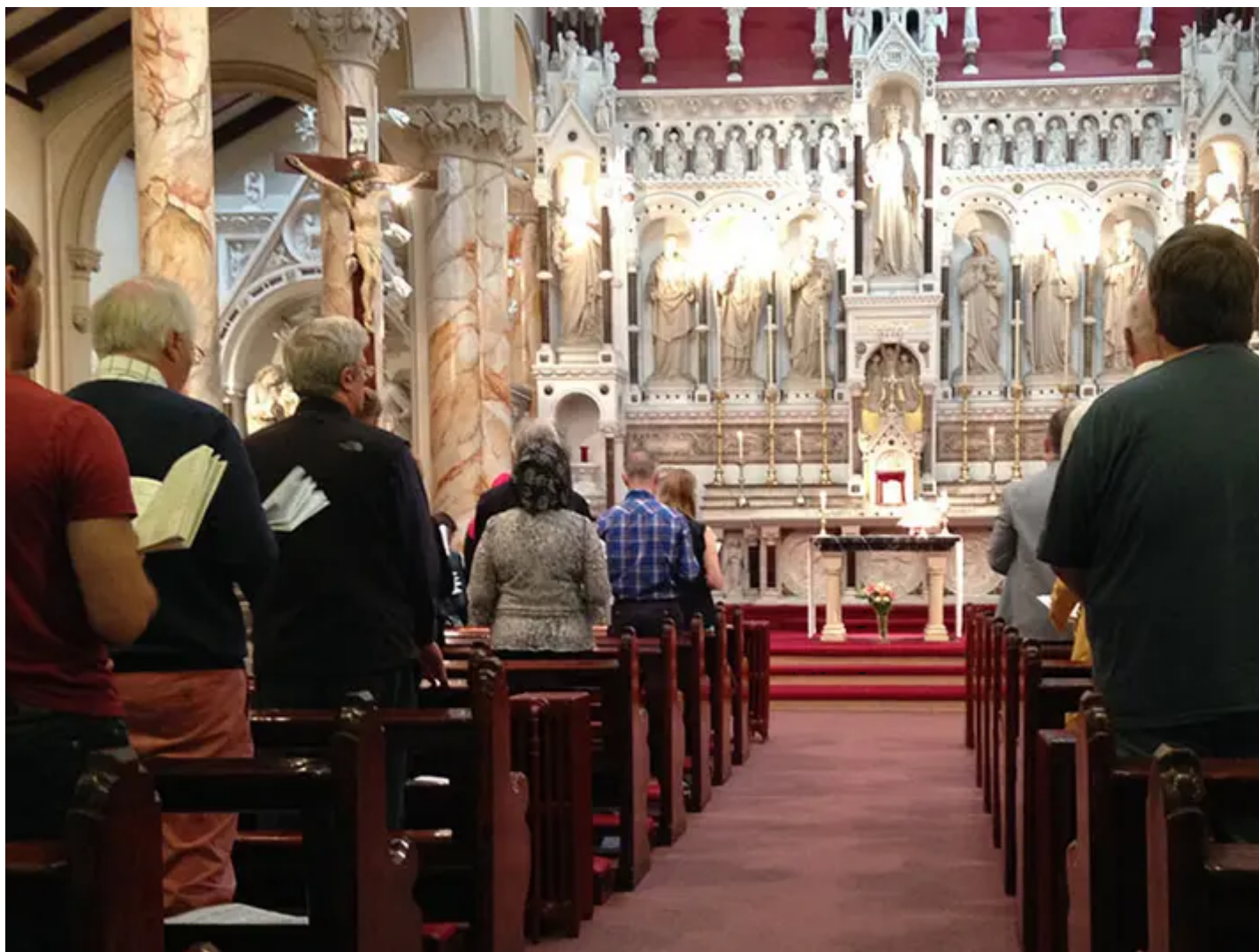
The congregation of St Mary's Catholic Church, Manchester.

"As we look to launch our new ten-year strategy this week, we've listened to what the sector and the public want. This grant will direct funding to where it's most needed, protecting and caring for some of our most precious and fragile heritage, at the heart of communities."