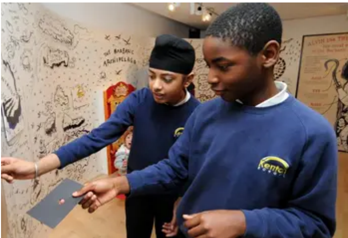
Children enjoying an exhibition at Seven Stories, Newcastle upon Tyne

Our Dynamic Collections funding campaign comes to an end on 24 April 2023. If you are inspired by these projects, find out how to apply . You can still apply for support for collections-based projects via our open programmes at any time.