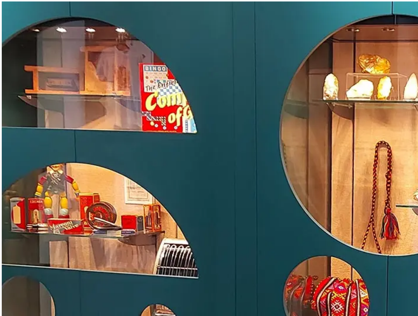
Objects telling the history of Enfield.

The Museum of Enfield are creating a new online cataloguing system that will open up access to their collection. Lunchtime talks, museum lates and new exhibitions will be taking place, aiming to connect the local community with the museum's collection in a new way. Read more about Your Museum of Enfield.