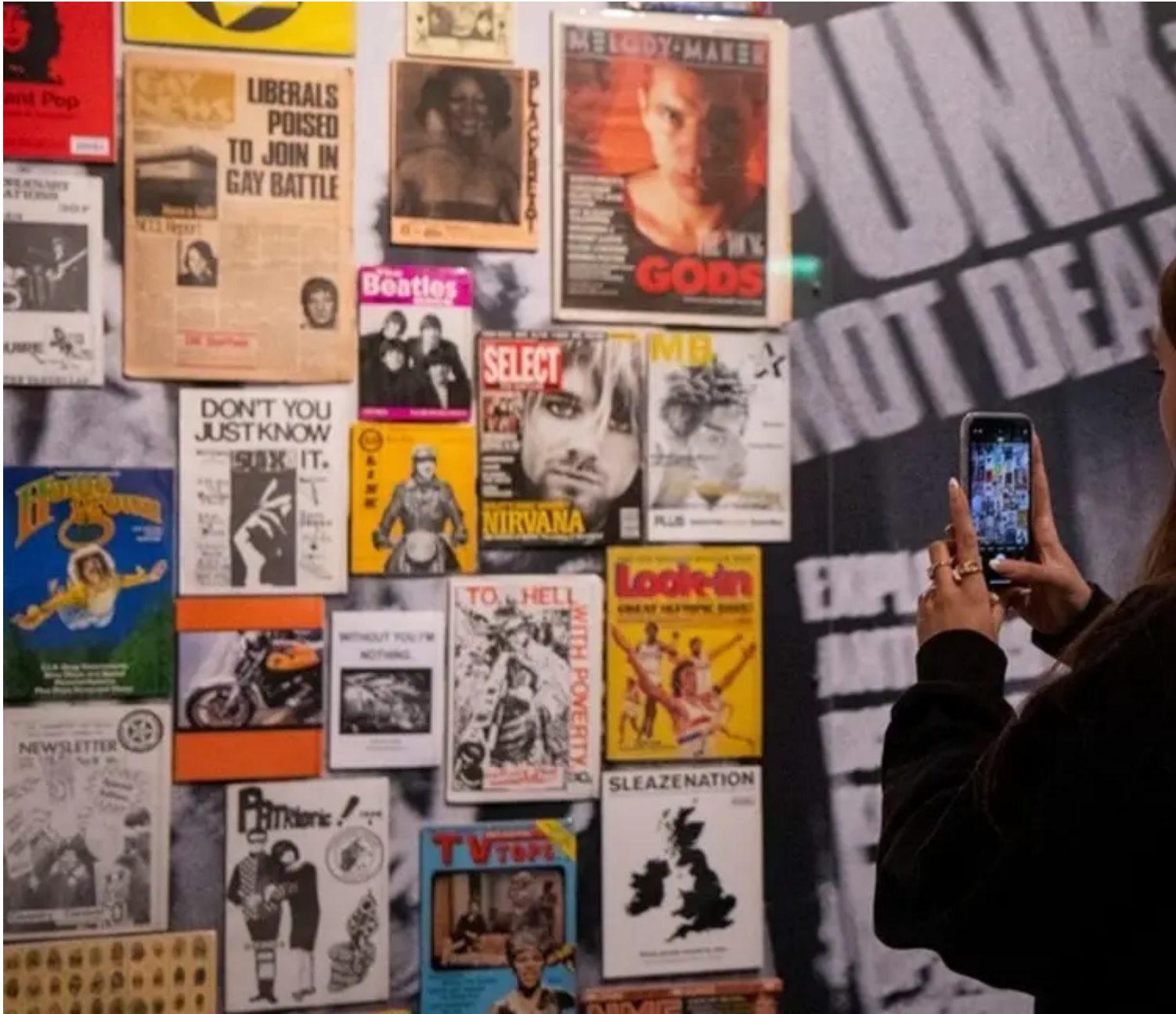
Display of gig posters at The Museum of Youth Culture The Museum of Youth Culture Dynamic Collections

We look at four projects getting underway in museums, libraries and archives that are working innovatively to make the most of their collections.