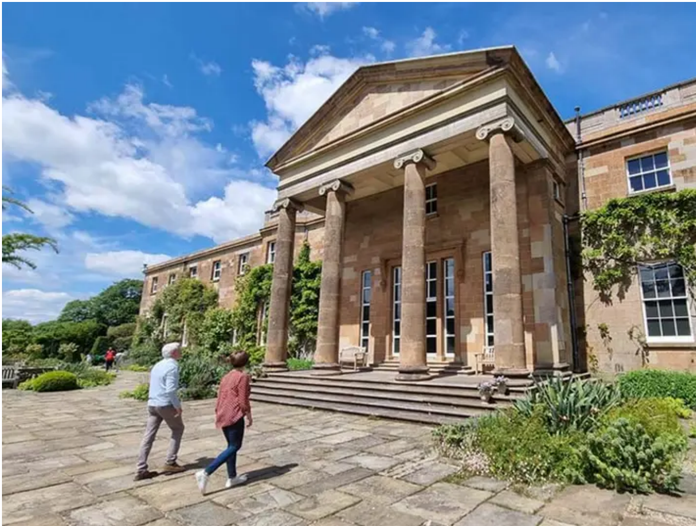
Visitors at Hillsborough Castle, which previously offered 2-for-1 entry.

Take a look at a list examples from previous years for more inspiration.