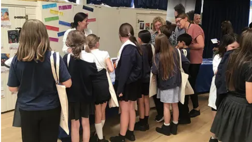
Activities engaged pupils of all ages.