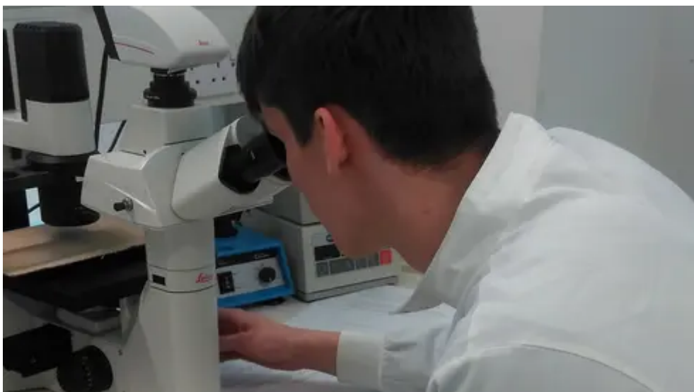
Using a microscope in the lab.

In-school and virtual learning sessions have engaged over 3,700 pupils, from reception class to Year 13, and adults. One teacher said: "There was a palpable buzz of excitement and curiosity around the room. You might have inspired some young people!"