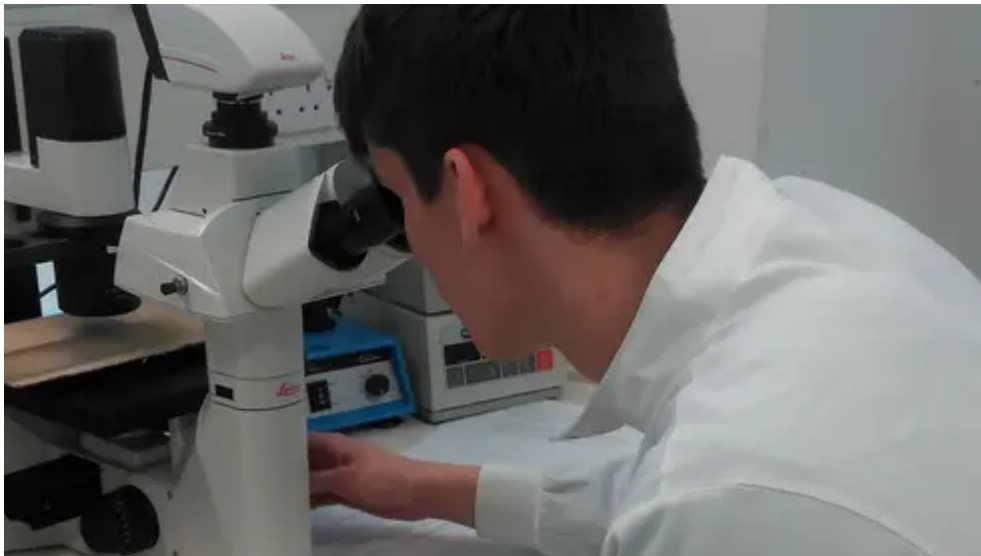
Using a microscope in the lab.

In-school and virtual learning sessions have engaged over 3,700 pupils, from reception class to Year 13, and adults. One teacher said: "There was a palpable buzz of excitement and curiosity around the room. You might have inspired some young people!"