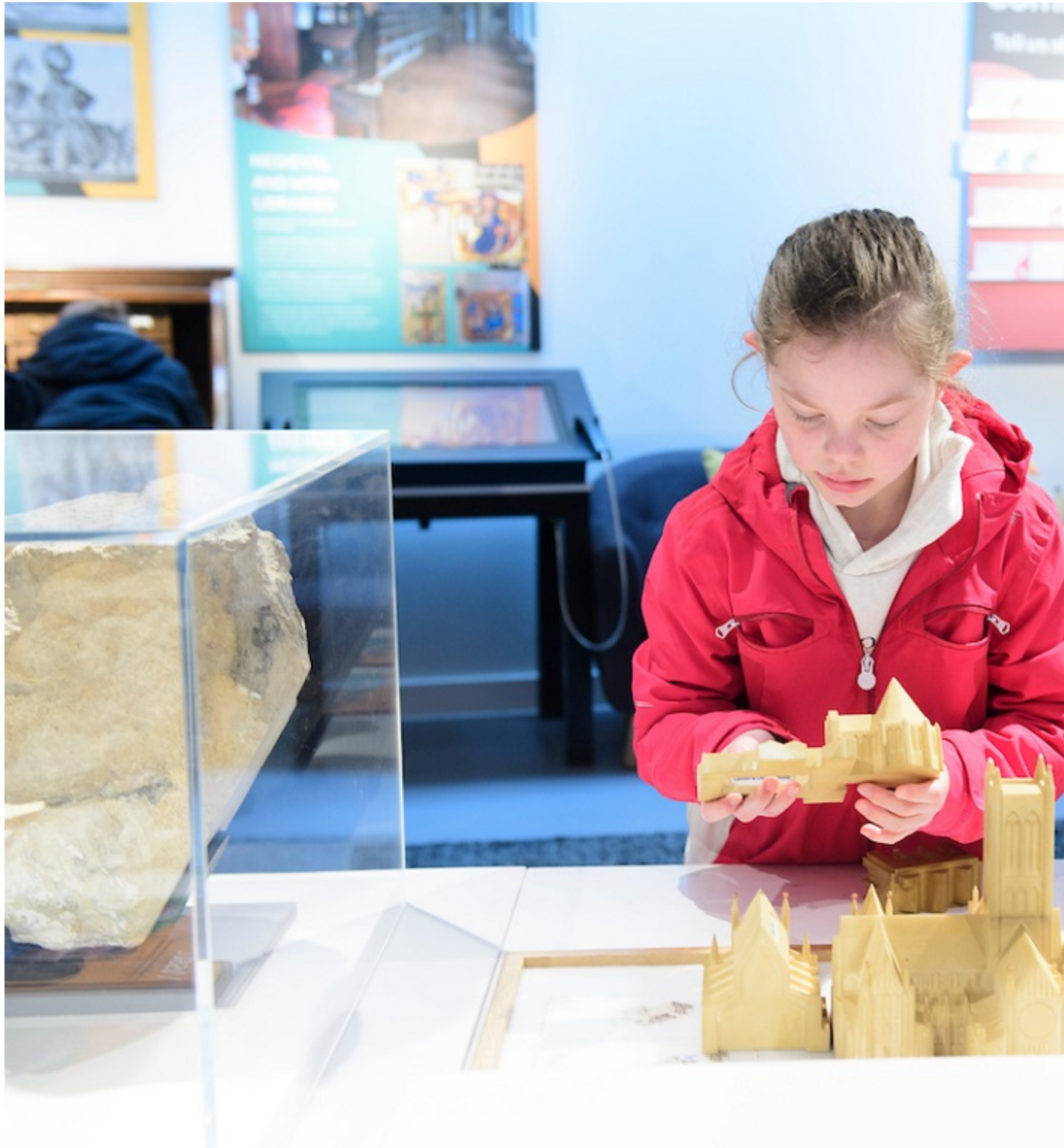
Interactive exhibitions for all ages

"We awarded a major grant of £12.5 million in order to address urgent repairs to this critically important 950 year old building.... Our grant was also intended to provide the dynamic facilities that will allow engaging and inspiring visitor experiences now and for generations to come.