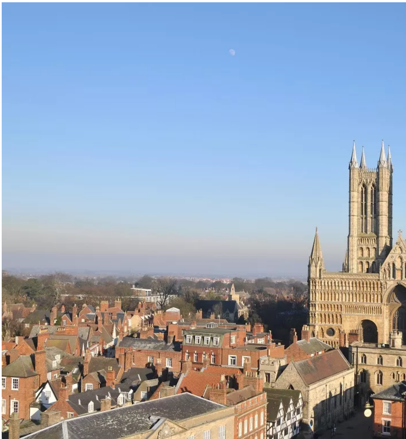
Lincoln Cathedral dominating the city skyline.

And the West Front is scaffold-free for the first time since 1986.