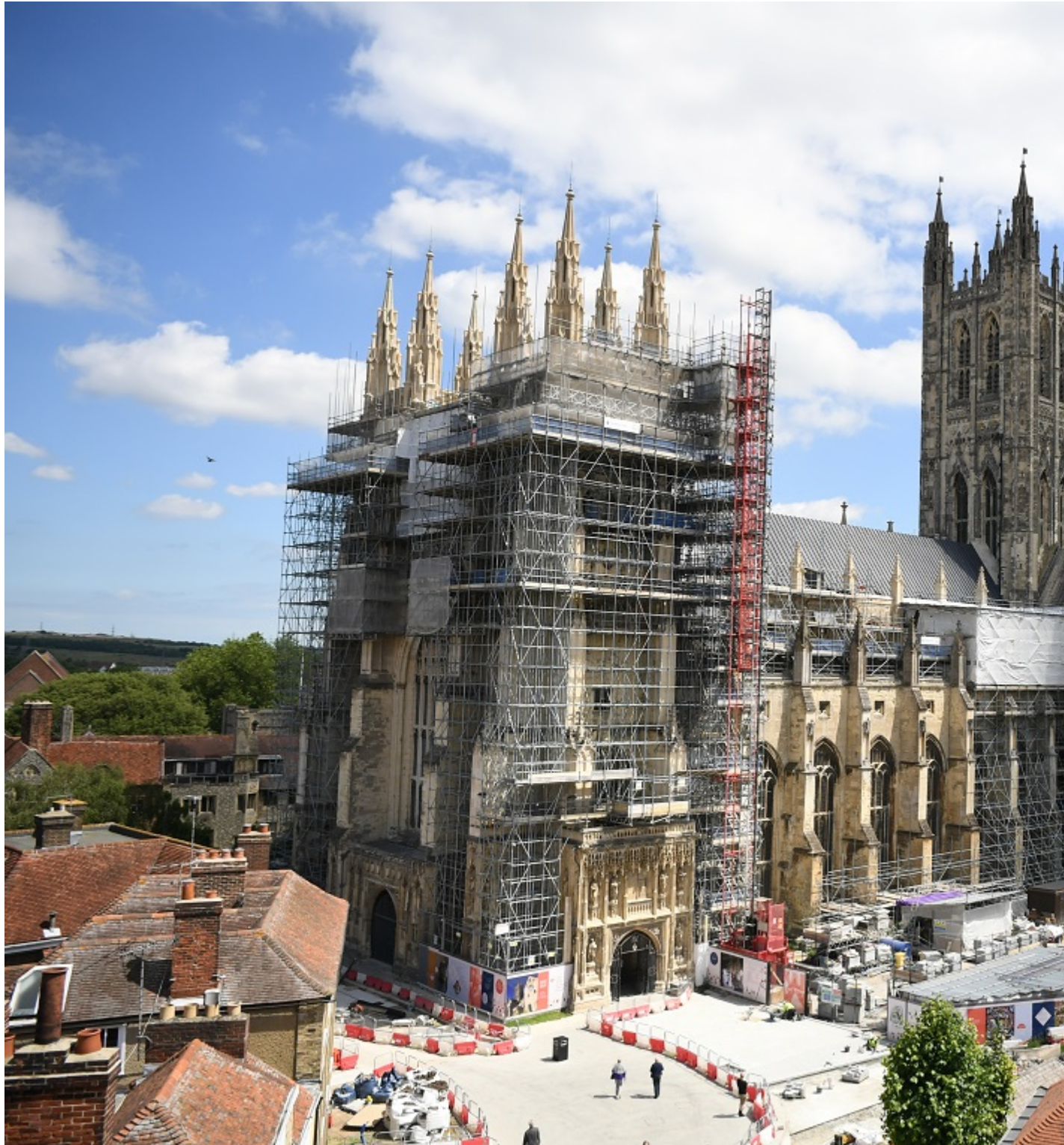
Canterbury Cathedral undergoing restoration