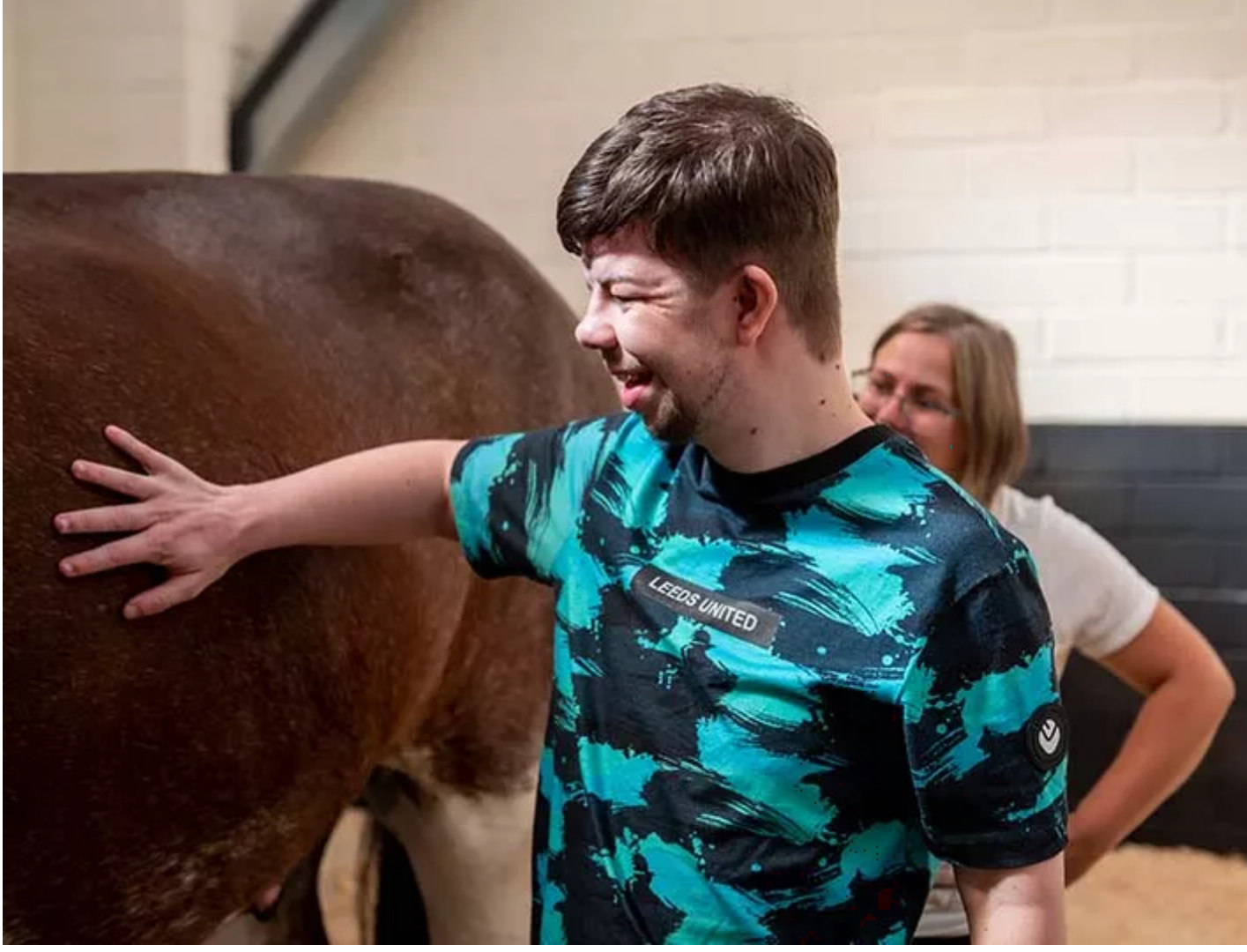
Visiting the National Coal Mining Museum.

The industrial heritage movement from the late 1960s onwards was prompted by the loss of industries that were large employers: the textile industry, coal mining, steam railways.