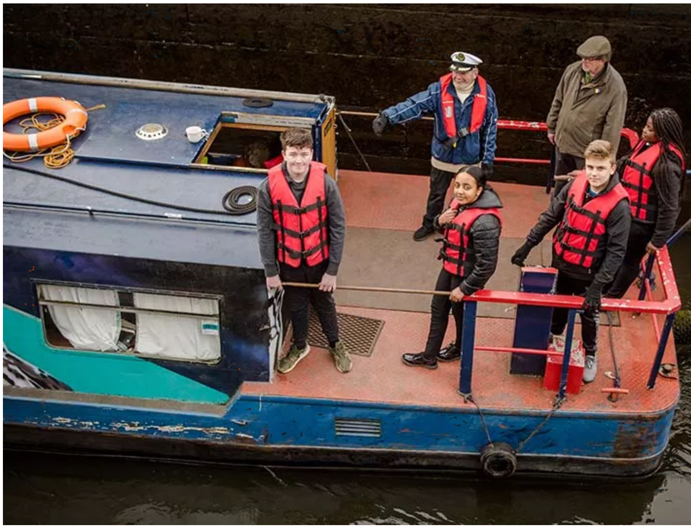
Young people enjoy a Canal Connections project.

We've done it in all sorts of ways. Creating with young people is really important aspect. We also have young people on boards and forming consultative groups at museums.