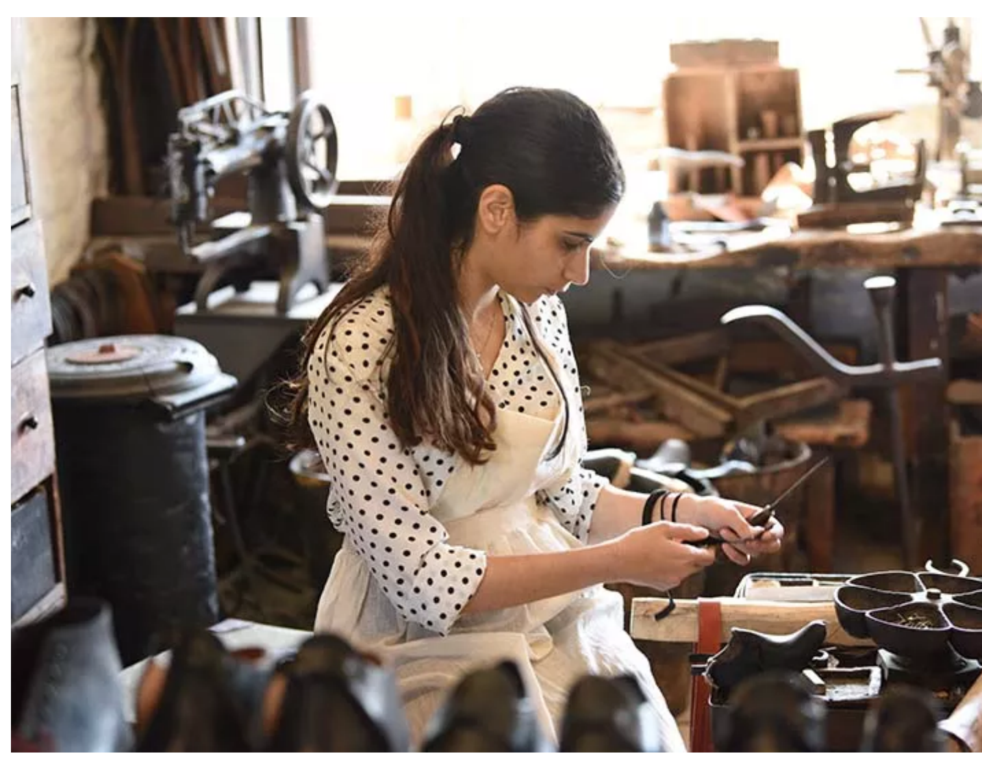
Taking part in the Made in Huddersfield project.

For some of the young people, due to the pandemic, they were not able to do their GCSEs. But we know that the experience they have had with us has helped them get into agricultural college or onto an archaeology degree, for example.