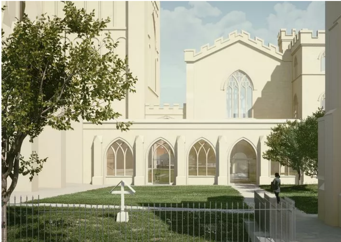
Exeter Cathedral New Cloister Gallery - West Elevation. Credit: Acanthus Clews Architects / Marvin Chic