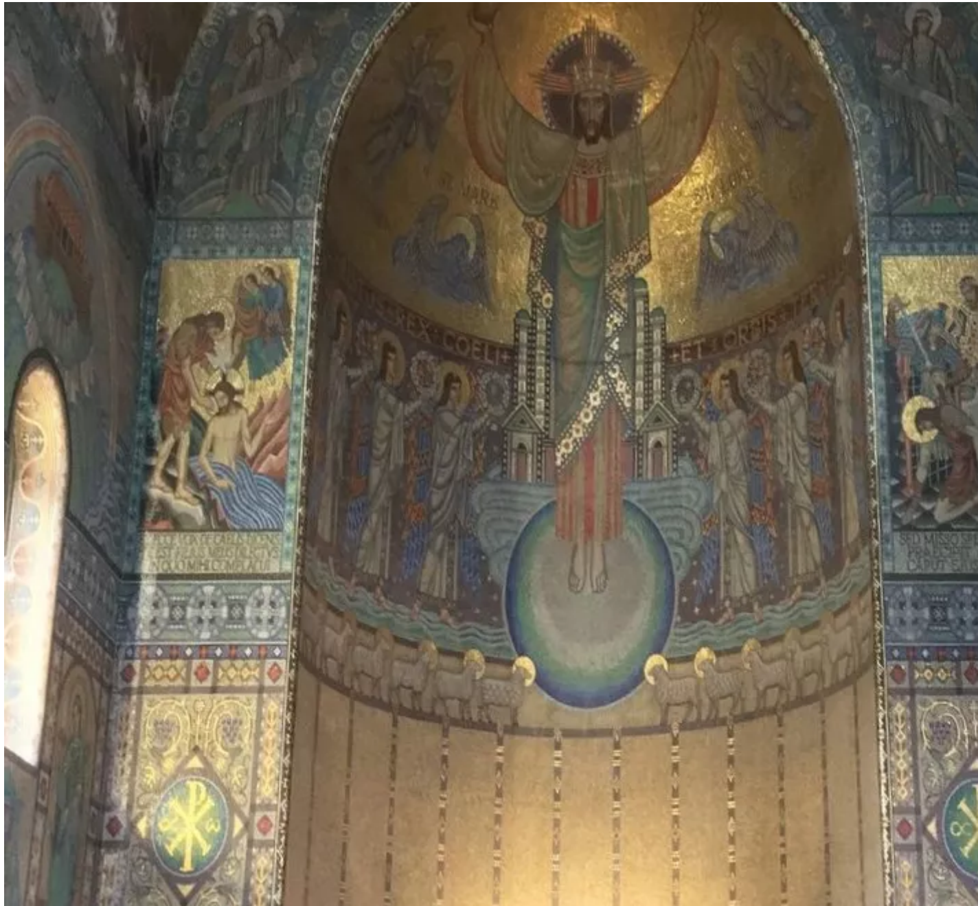
Mosaic dome at St John the Baptist RC Church, Rochdale.