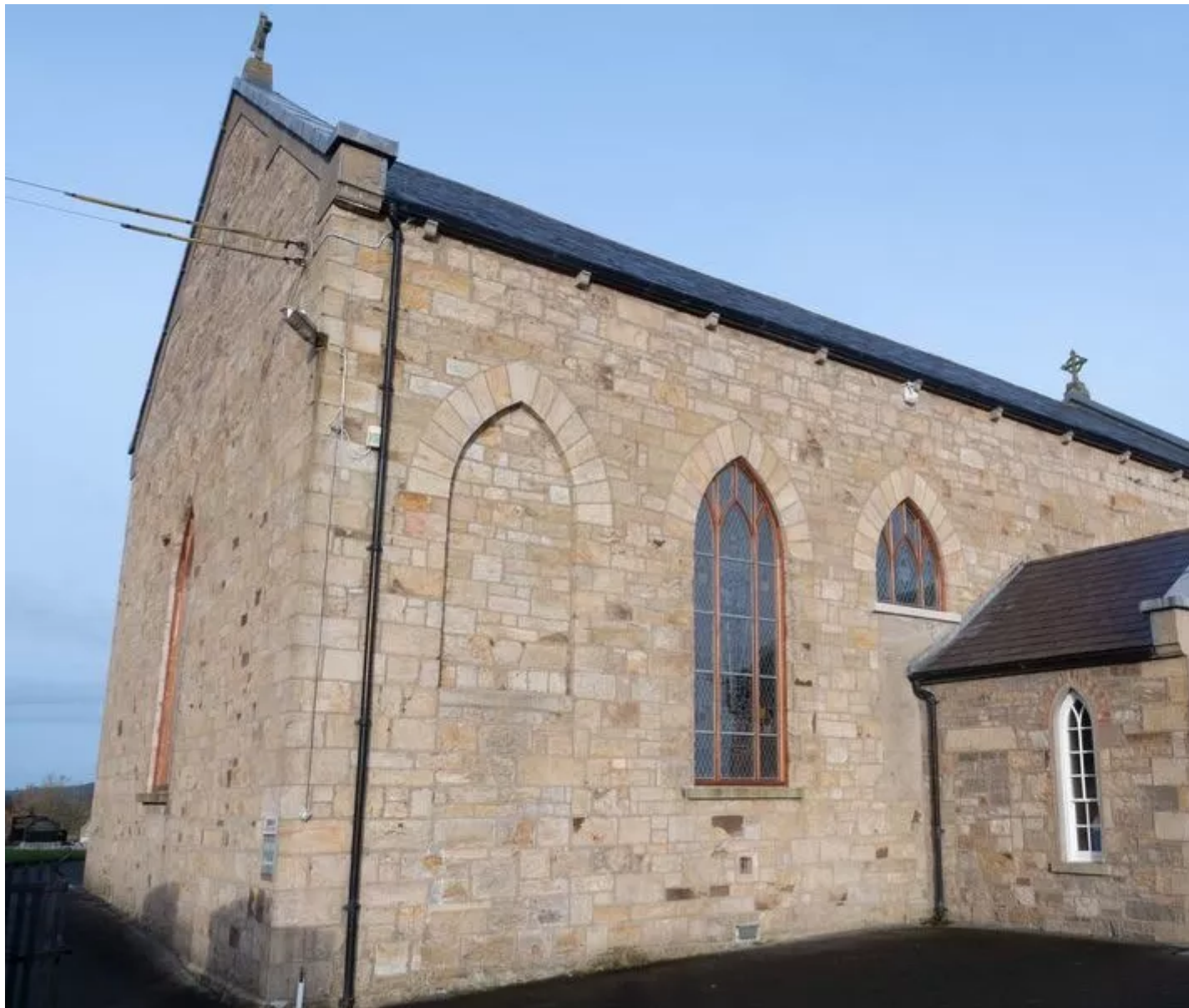
Outside of St Macartan's, The Forth Chapel, Augher.