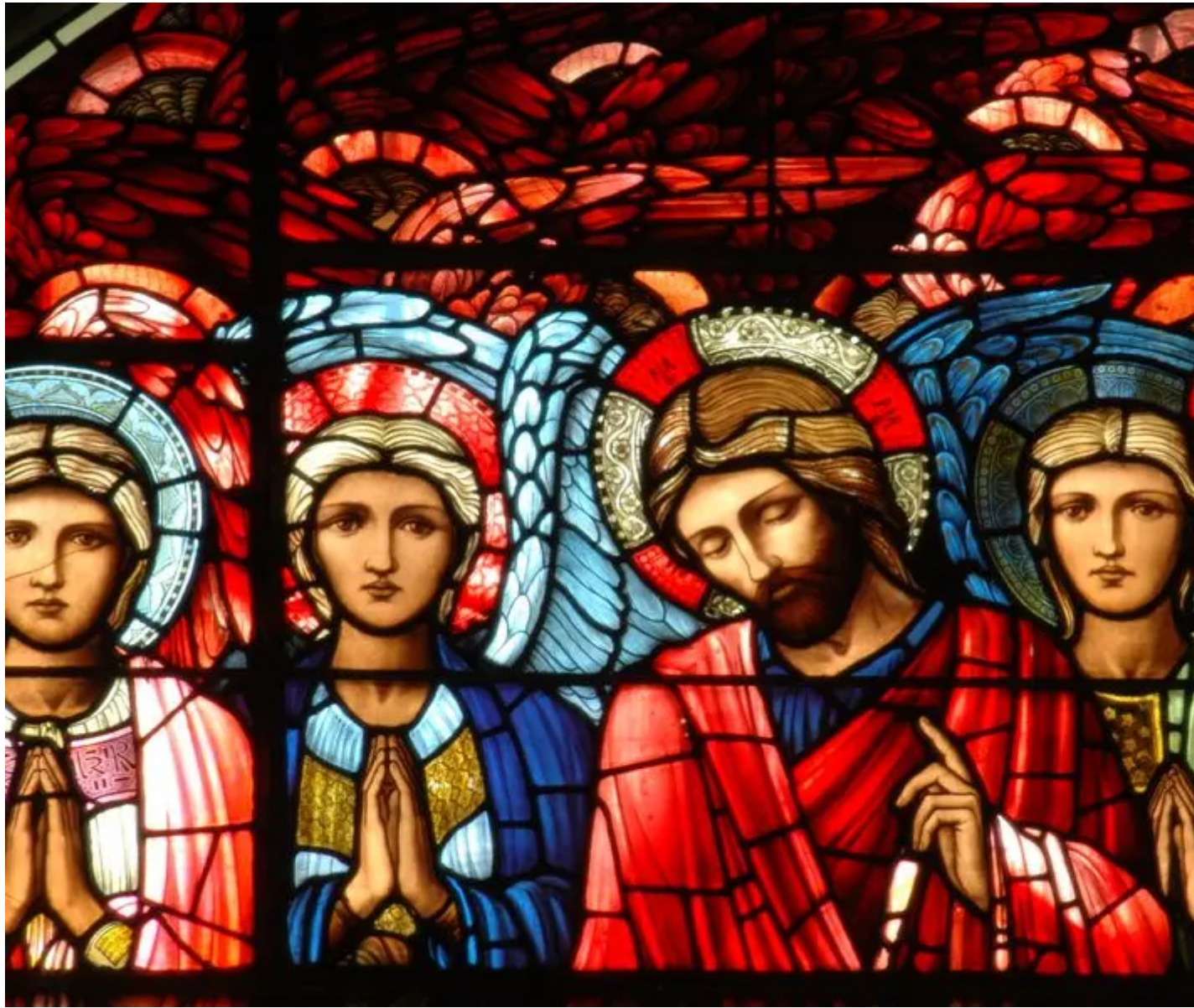
Burne-Jones Stained Glass Window at Birmingham Cathedral.