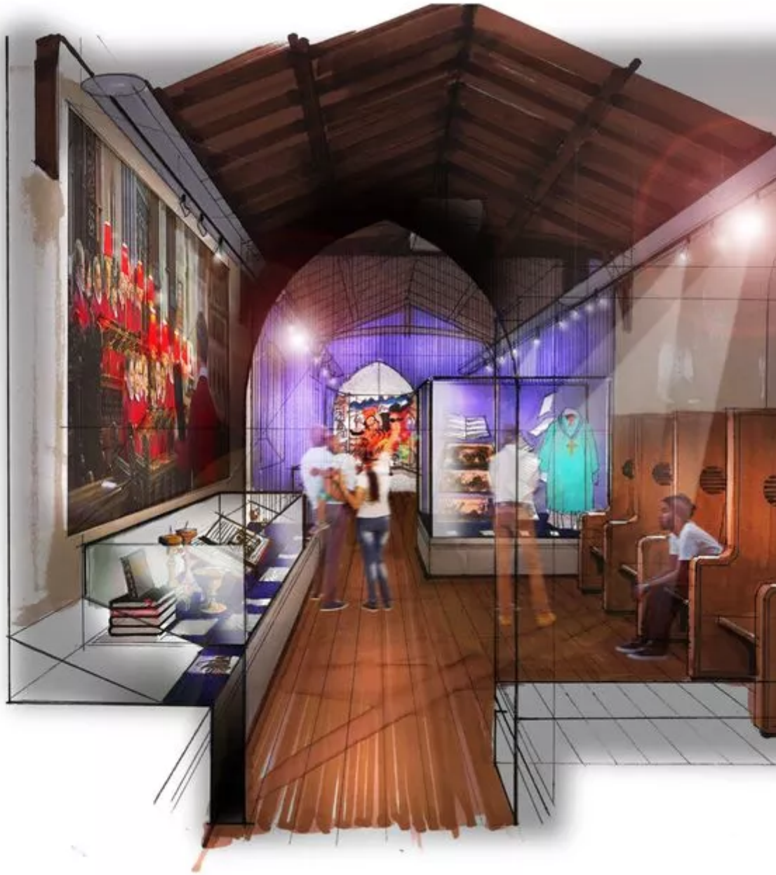
Exeter Cathedral New Treasures Exhibition.