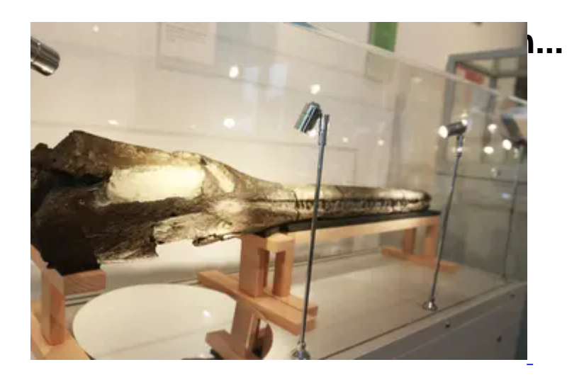
160-million-year-old crocodile skull.