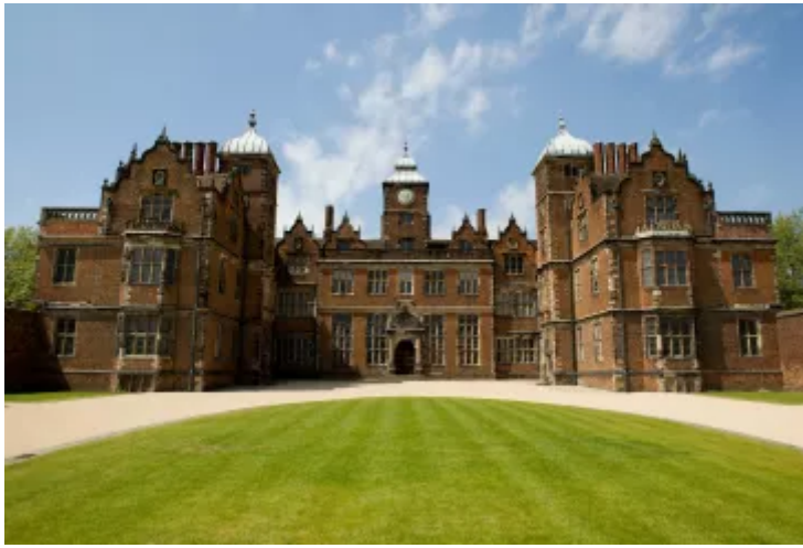
The stately Aston Hall in Birmingham

Explore over 30 rooms of this grand mansion, including King Charles' Chamber, the elaborate Great Stairs and the breath-taking Long Gallery. Top it off with a walk in Lady Holte's Garden. 50% off entry to Aston Hall is available throughout the week.