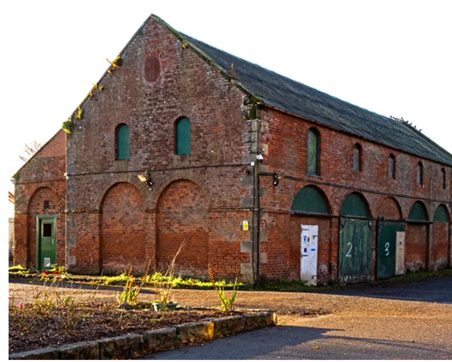
The much-loved mill is at the centre of a five-year project, set to receive £3.47million from the Heritage Fund.

A derelict mill near Leven in Fife is to be brought back to life thanks to funding from National Lottery players, with people's physical and mental wellbeing at the centre of the project.