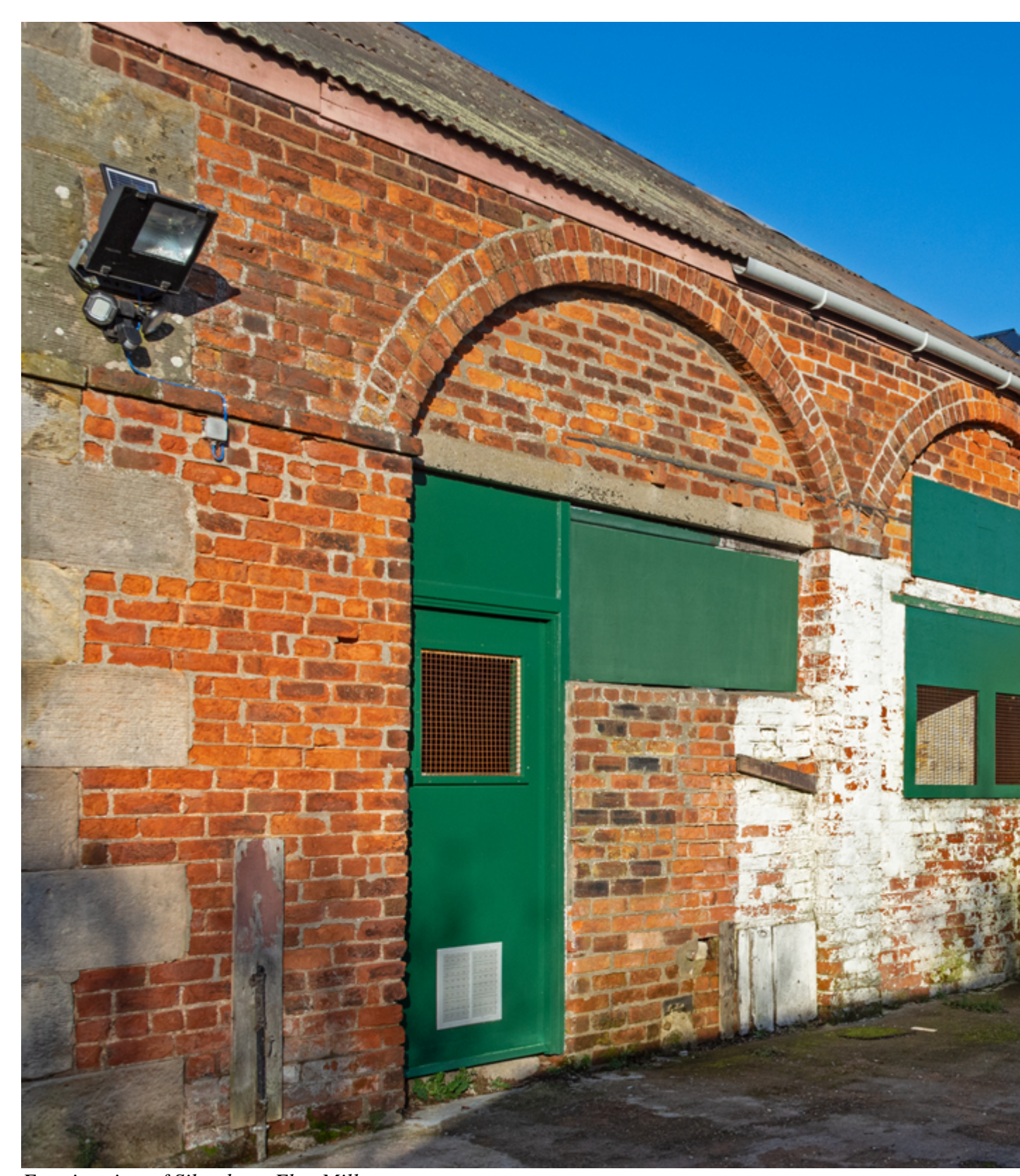
Exterior view of Silverburn Flax Mill