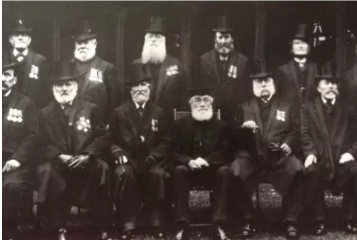
The Brethren in 1897.

More than 400 such people – known as the ‘Brethren’ or ‘Brothers’ – have lived at the hospital over the 450 years since. They have fought in numerous battles and wars, including the Battle of Waterloo, the Crimean War and both World Wars.