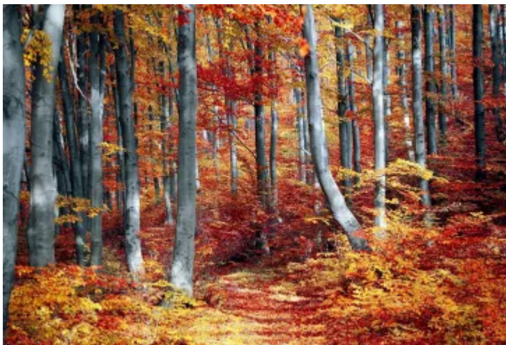
Trees are a critical part of our natural heritage

Lord Goldsmith, Minister for the Environment, said: "With the climate change summit COP26 just days away, there has never been a more important time for trees and tree planting.