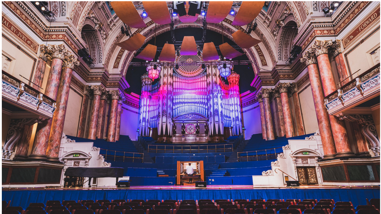
Victoria Hall in Leeds

Our investment will also see the full repair and renewal of the more than 6,000 façade pipes on the much-loved Leeds Town Hall organ – one of the largest of its kind in Europe.