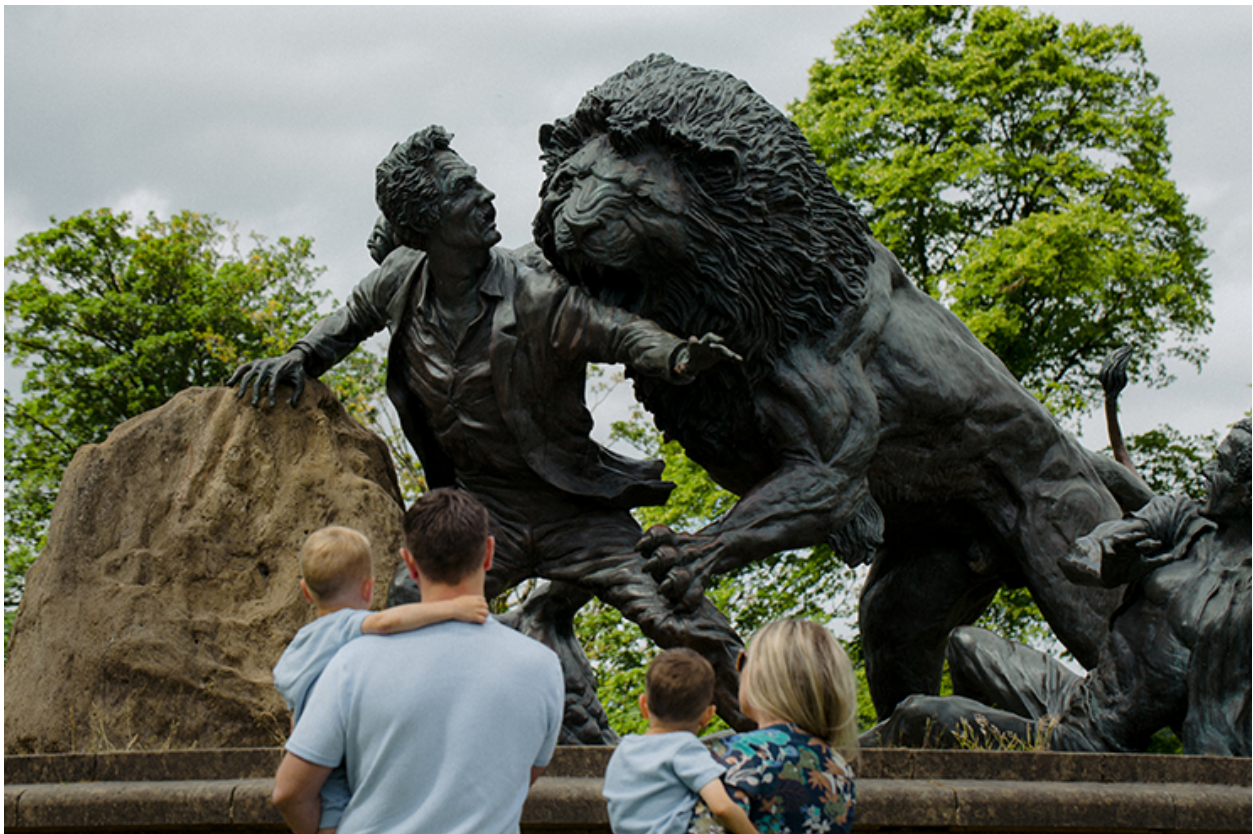
Livingstone and Lion sculpture depicting a lion attack Livingstone experienced in Southern Africa.

"The tenacity and resilience of the Trust in driving this world-class heritage project through the challenges of the pandemic should be applauded, and we are delighted the Birthplace is now open."