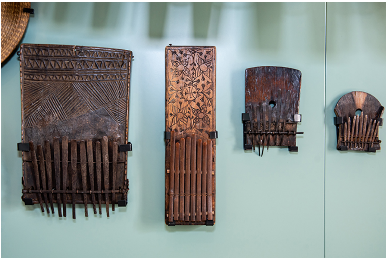
A selection of Southern and Central African objects on display in the museum.

Visitors will also be able to view a new video series produced in partnership with the Scotland Malawi Partnership. The series examines Livingstone's ongoing legacy and how it relates to faith, anti-racism, the story of Africa and his impact on colonialism.