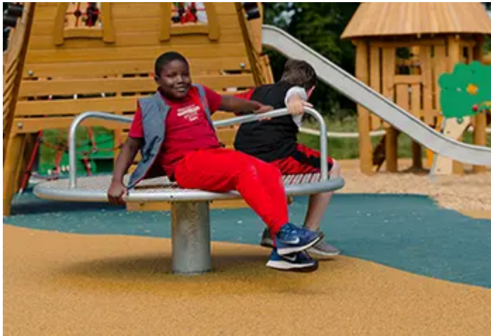
New play area at the David Livingstone Birthplace

The birthplace of one of Scotland's most famous explorers has re-opened following a £6.86million National Lottery grant.