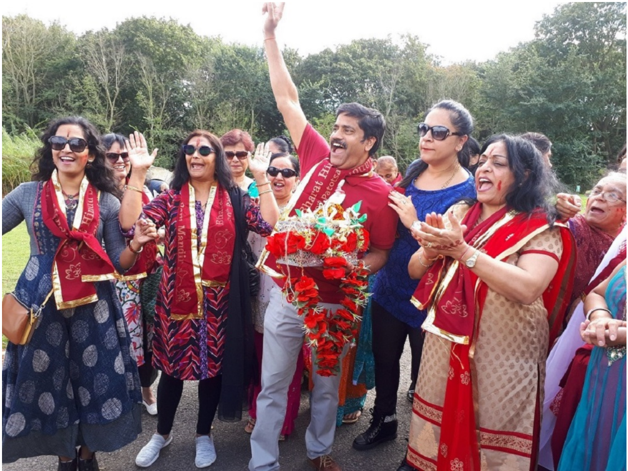
People celebrating at Ferry Meadows Country Park

Your Community Greenspace will also work with other groups, such as people with limited physical ability, and people living in areas of high deprivation. Activities will include: