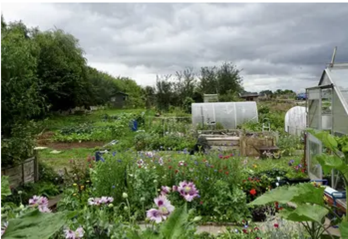
Boundary Way allotments, Wolverhampton

We fund heritage projects large and small, providing grants from £3,000 up to millions of pounds. Take a look at our funding programmes and decide which one might be right for you.