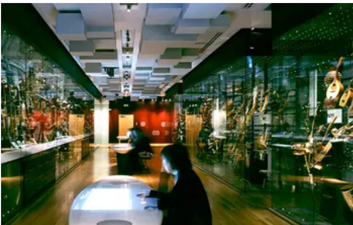
COVID-19 crisis on heritage