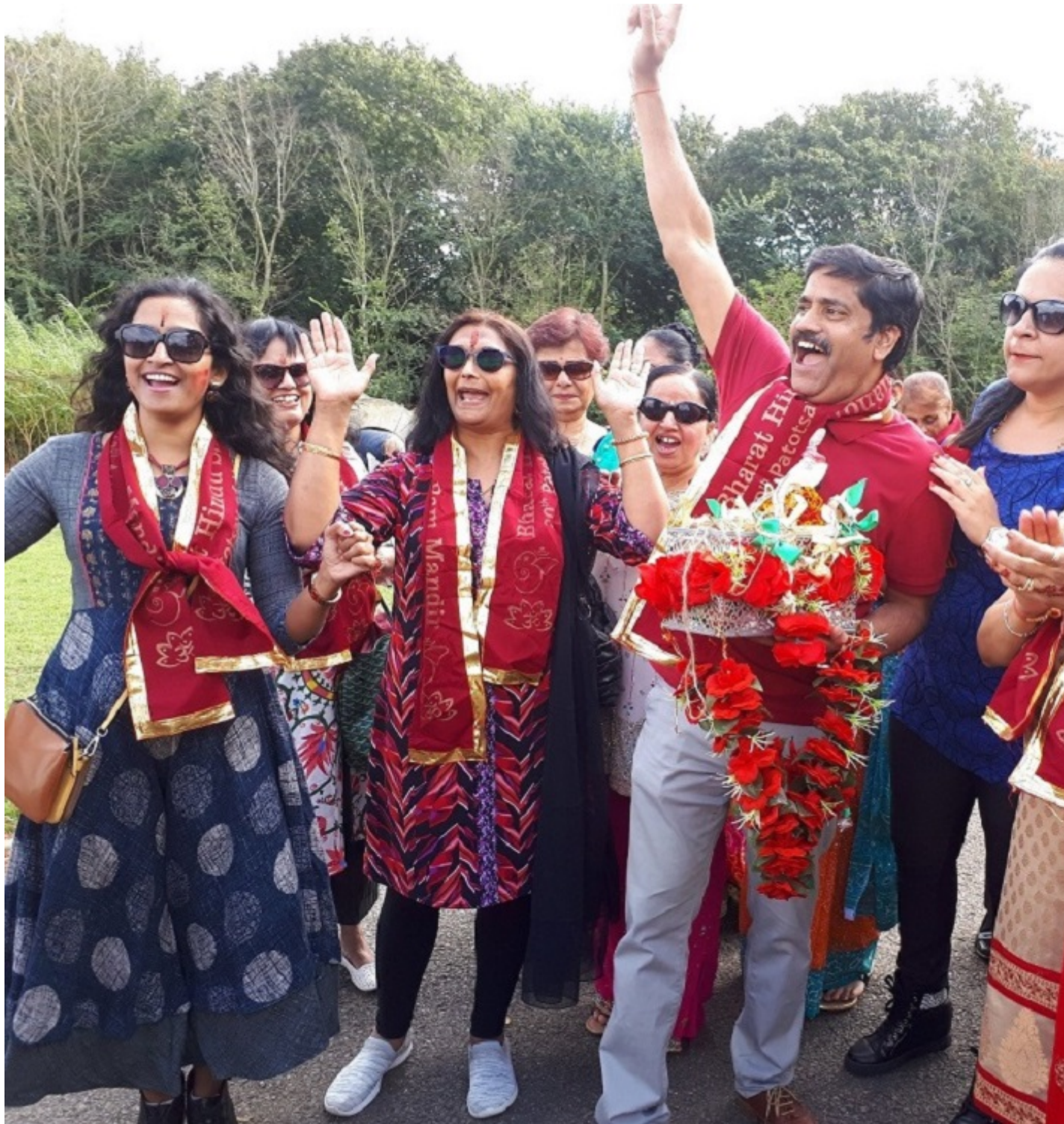
People celebrating at Ferry Meadows Country Park

Your Community Greenspace will also work with other groups, such as people with limited physical ability, and people living in areas of high deprivation. Activities will include: