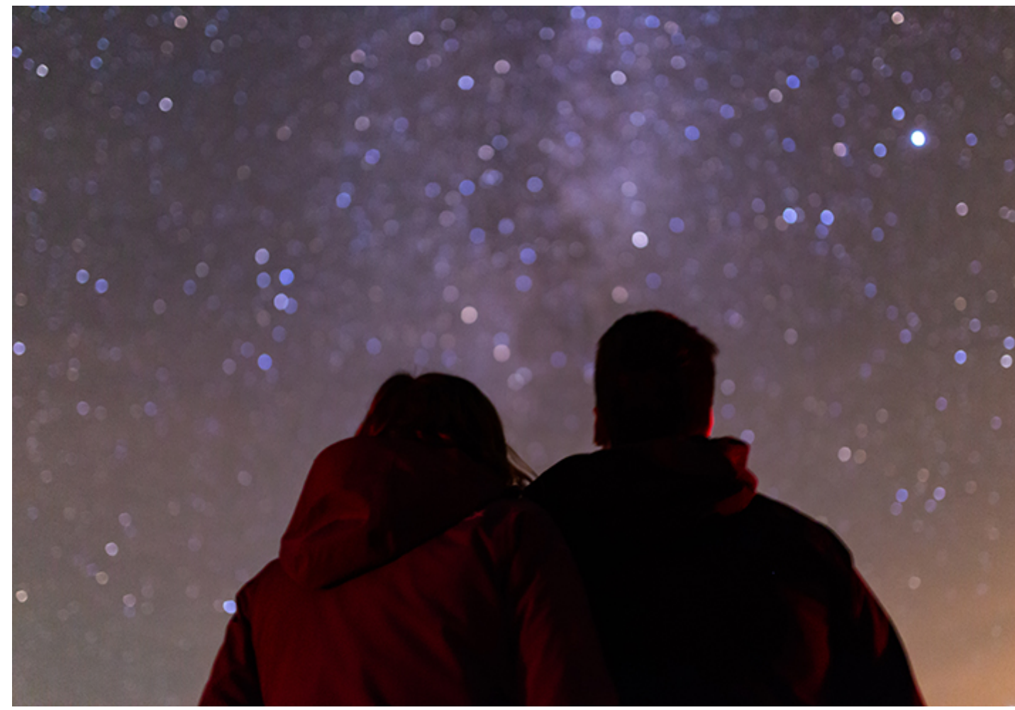
The Kielder Observatory received a grant of £23,300 in the second round of the Culture Recovery Fund.

We've been working with the Department for Digital, Culture, Media and Sport (DCMS) to deliver grants through The Culture Recovery Fund for Heritage since the start of the pandemic. We're pleased to announce that further funding is now available.