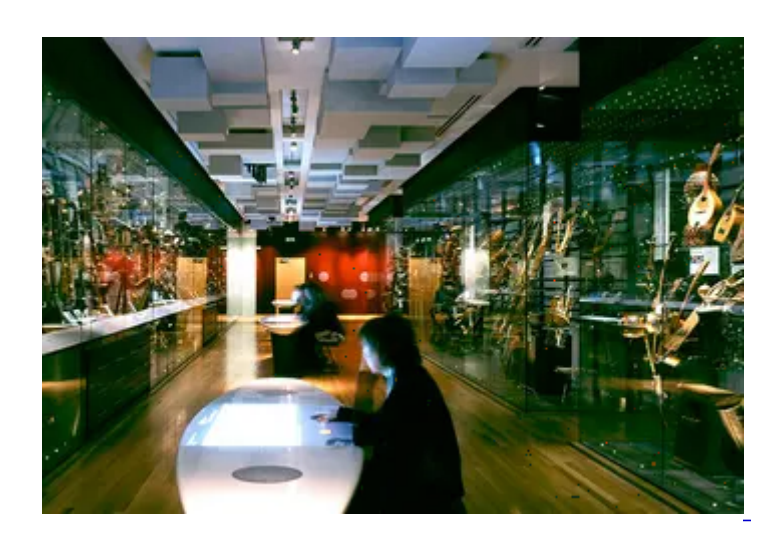
Music Gallery, Horniman Museum

Expressions of interest for the Culture Recovery Fund: Emergency Resource Support are open until midday on 30 September 2021 .