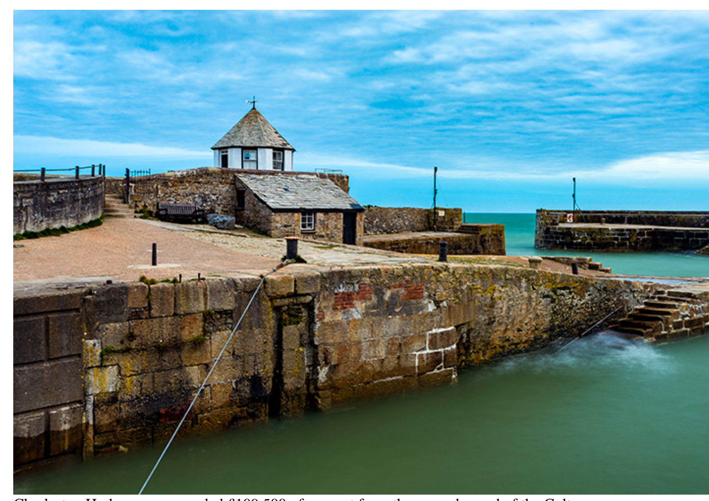
Charleston Harbour was awarded £109,500 of support from the second round of the Culture Recovery Fund

The first strand, Emergency Resource Support, is open to heritage organisations in England whose livelihoods are threatened by the ongoing impact of the pandemic. Grants of between £10,000-£1m are available.