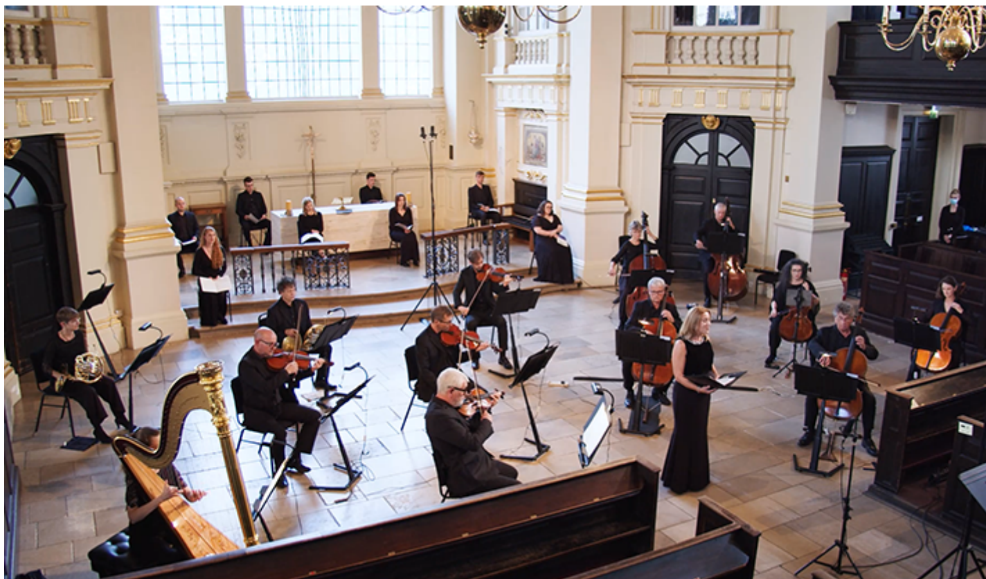
A concert at St-Martin-in-the-Fields, London

“This report provides key insight into how heritage was affected as well as how we as a funding body can continue to help them innovate and adapt going forward.”