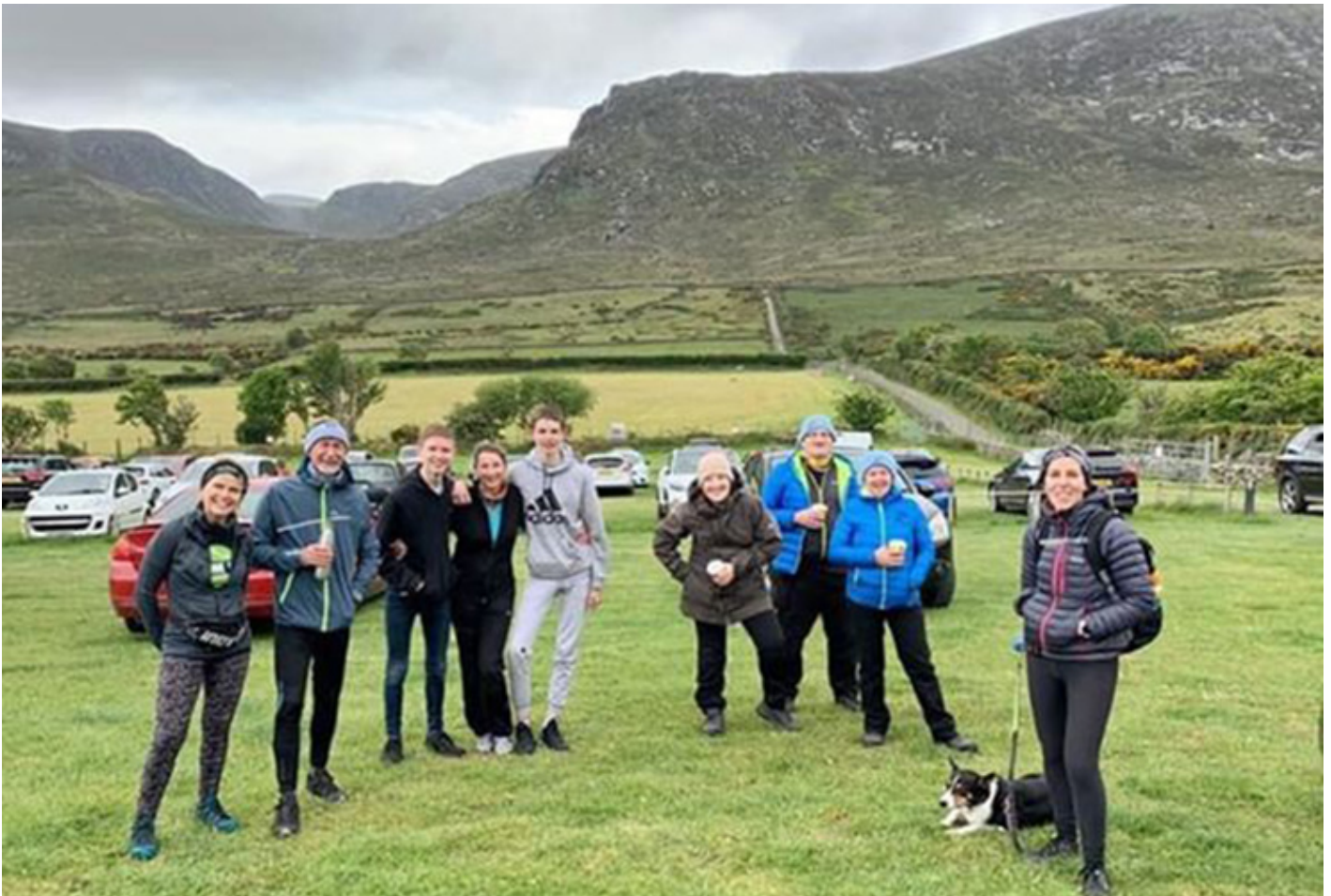
Mourne heritage volunteers

Over two-thirds of respondents said they spent at least some of their grant on social distancing measures . This helped many heritage organisations to safely reopen, and volunteers to return to their roles.