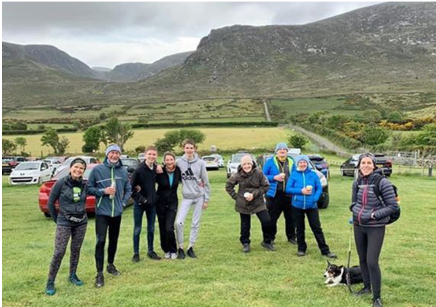
Mourne heritage volunteers

Over two-thirds of respondents said they spent at least some of their grant on social distancing measures . This helped many heritage organisations to safely reopen, and volunteers to return to their roles.