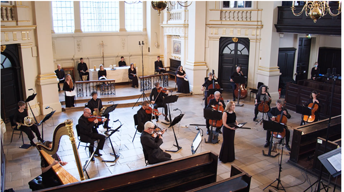
A concert at St-Martin-in-the-Fields, London

"This report provides key insight into how heritage was affected as well as how we as a funding body can continue to help them innovate and adapt going forward."