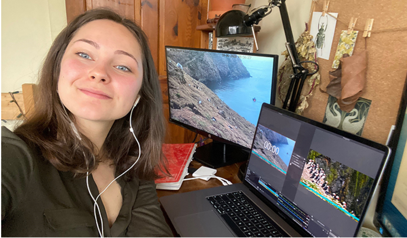
Skomer Island volunteer editing puffin videos

The £1m National Lottery funding announced today through our Digital Skills for Heritage initiative is in response to this. Heritage organisations and partnerships of all sizes across the UK can apply.