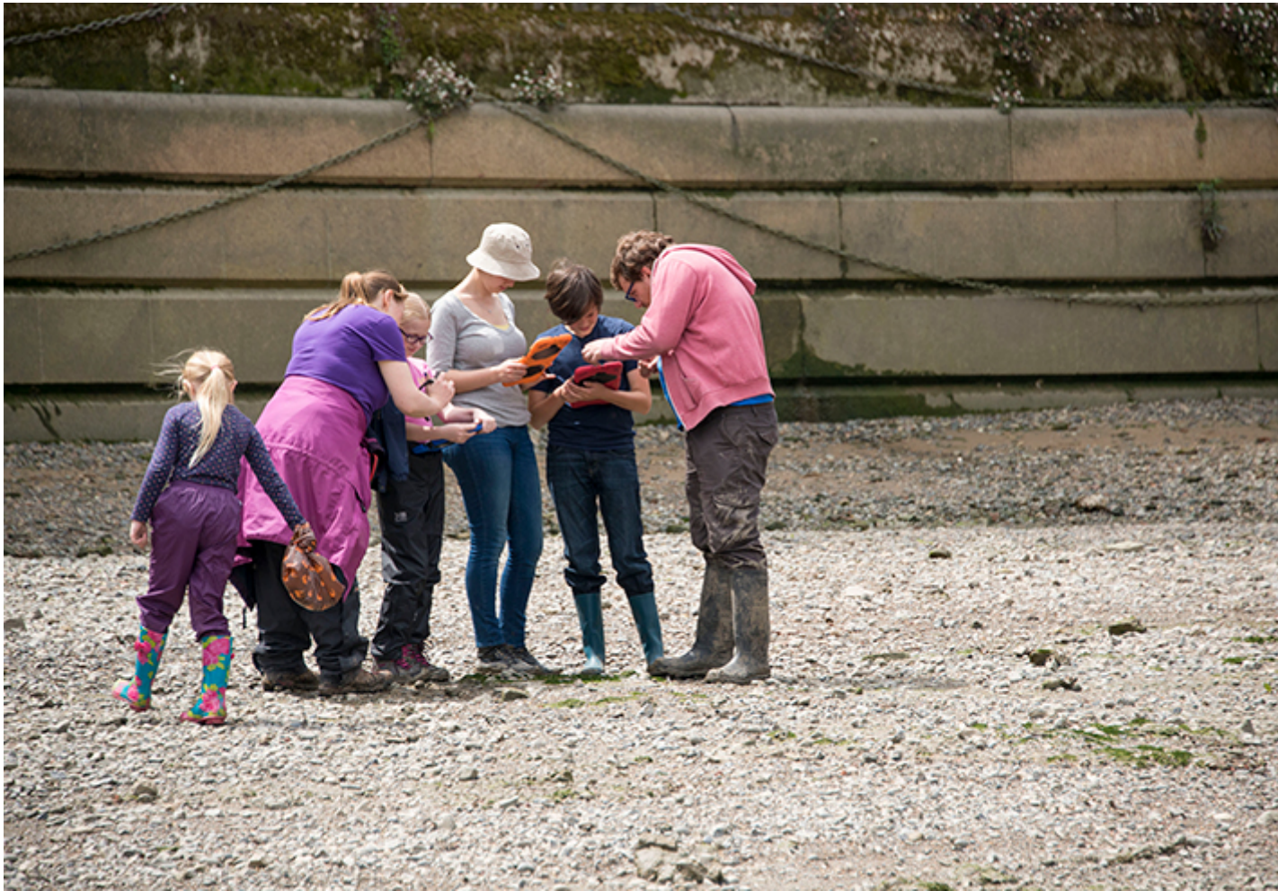
Thames Discovery Programme.