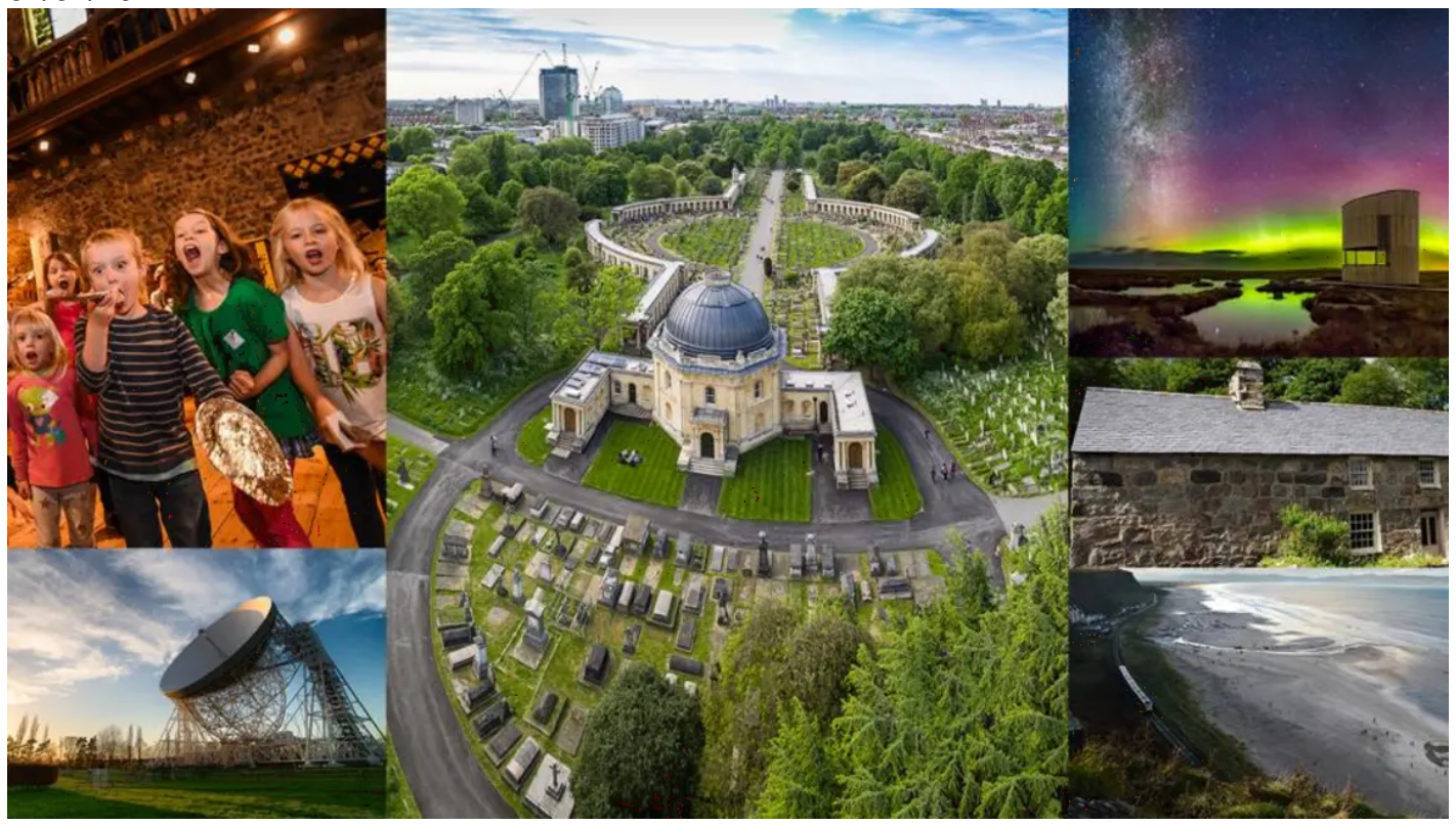
Join The National Lottery Heritage Fund and The Young Foundation to explore the question: how can innovation help us do the best we can for the future of heritage?

The National Lottery Heritage Fund is undertaking new research to explore how we can accelerate the emerging ideas needed to support heritage in the future.