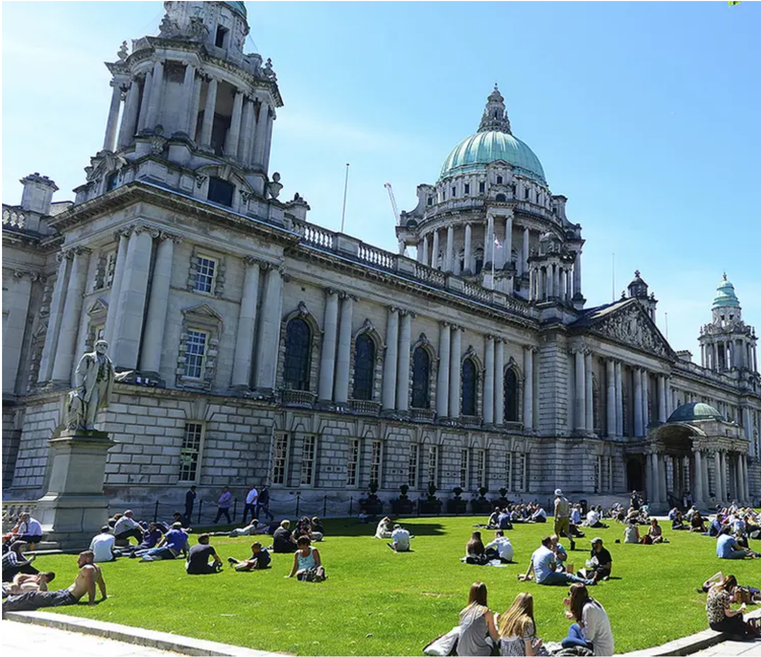
Belfast City Hall

Thirty nine projects have received grants totalling £1million to mark the Centenary of Northern Ireland in a thoughtful, inclusive and engaging way.