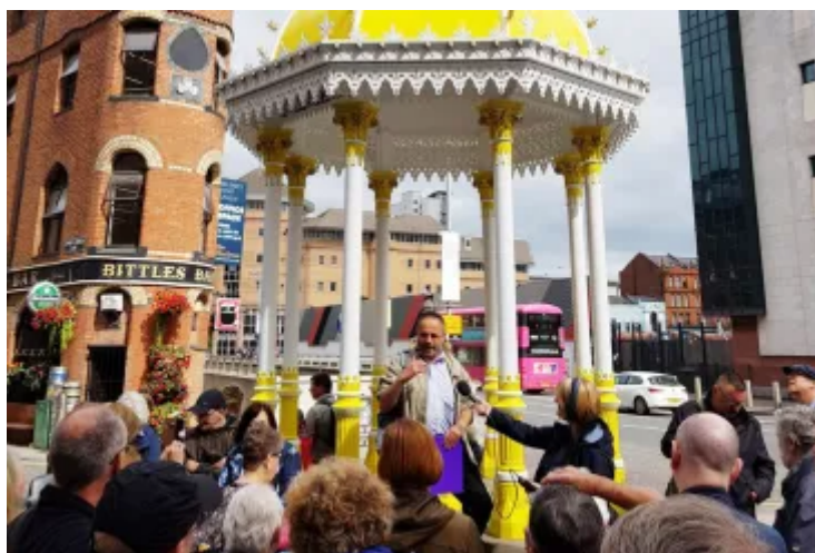
Tour at Jaffe Fountain, August 2018

Exploring the role and contribution of minority communities, with projects led by the Belfast Jewish Community, Chinese Welfare Association and Armagh Roma Traveller Support.