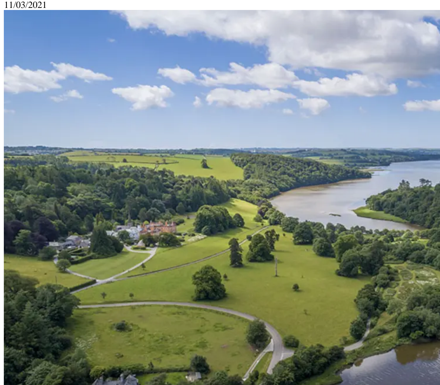
Thanks to National Lottery players, an ambitious five-year project will provide a brighter future for the Tamar Valley and its communities.

A hidden gem along the Devon and Cornwall border, the stunning Tamar Valley is a landscape at risk.