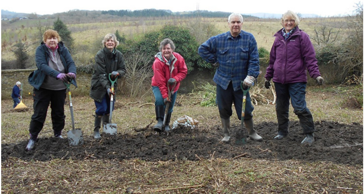
Workers at Cefn Ila, Monmouthshire

Organisational resilience is being able to respond to changes, threats and opportunities. The report outlines the two key aspects to resilience: