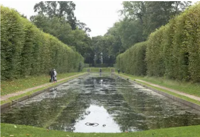
History of Northern Ireland