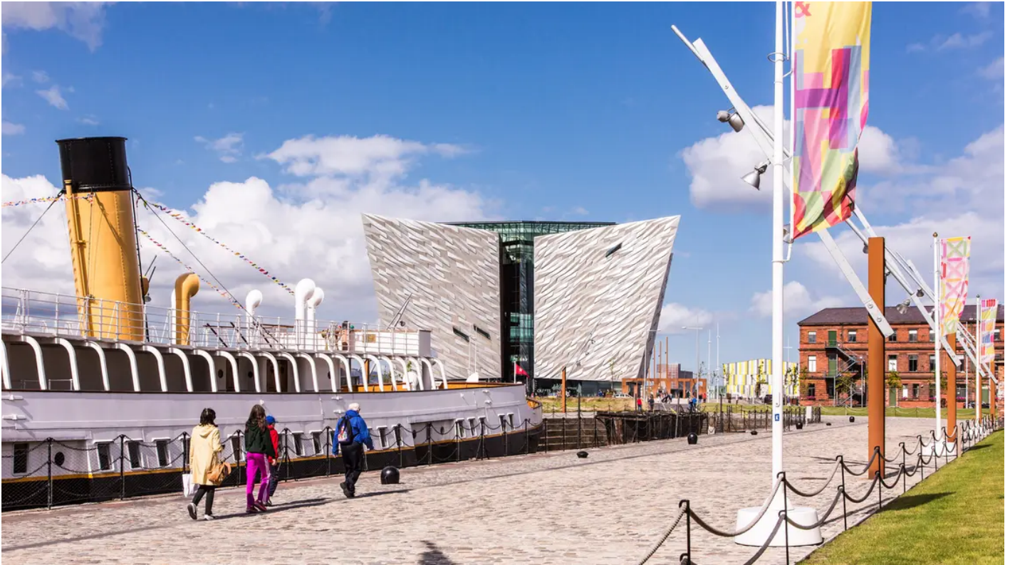
Titanic Belfast and SS Nomadic

£5.28million Department of Communities funding will support 50 heritage organisations and 41 heritage workers, reaching across the sector and keeping vital skills alive.