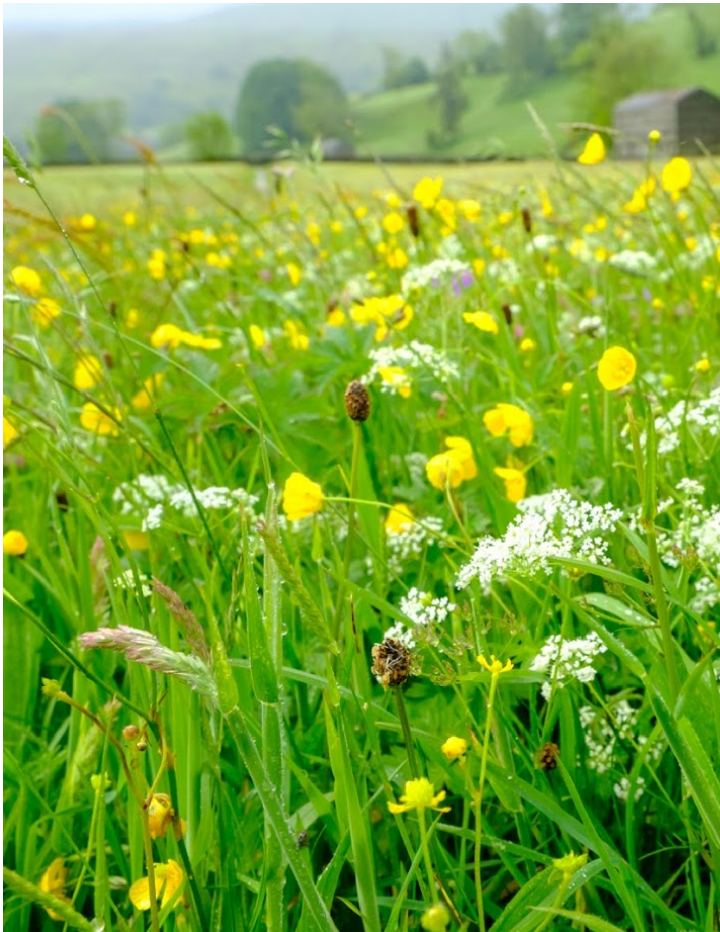
Muker Meadows.