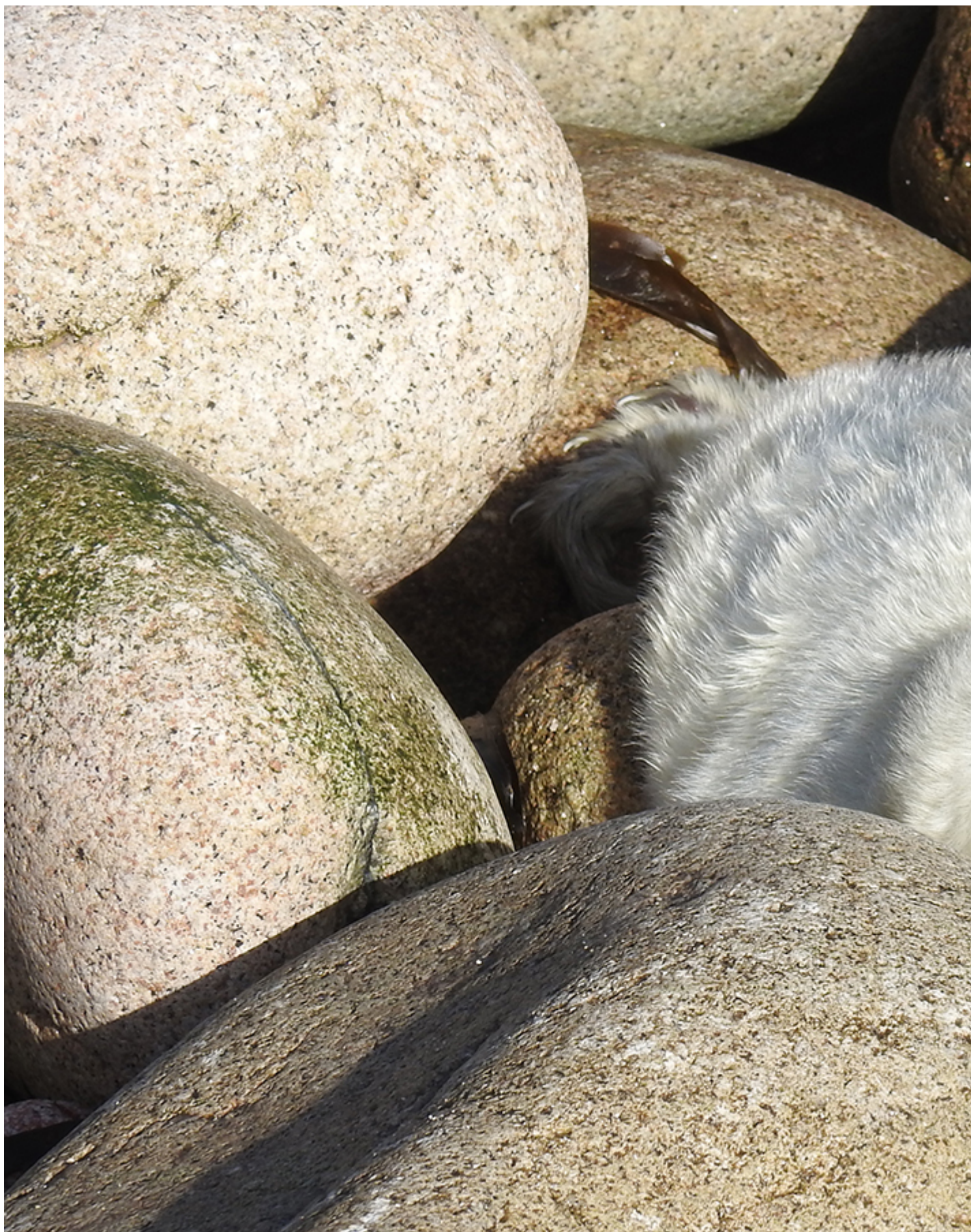
Grey seal pup