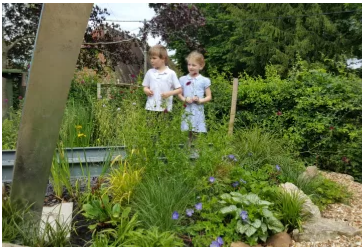
Protecting rivers.

The project will create jobs and develop training materials on forestry conservation for hundreds of future foresters.