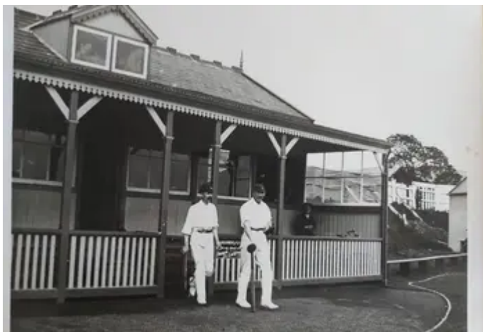
Weekly cricket reminiscence sessions

Become a tree explorer by downloading Forestry England's amazing activity pack. Learn about leaf identification, how to calculate the age of a tree and how to grow your own tree.