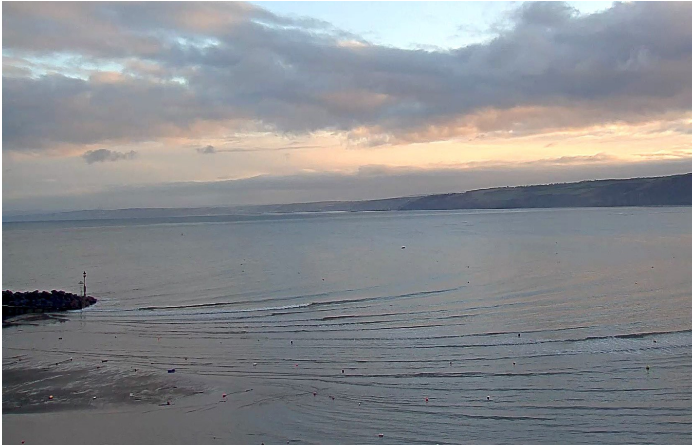
New Quay, Cardigan Bay live daily dolphin watch from 5am to 11pm

Bring the whole family together for a nature break with North Pennines AONB . Every day at 8am during February they will post fun outdoor activities on their Twitter page.