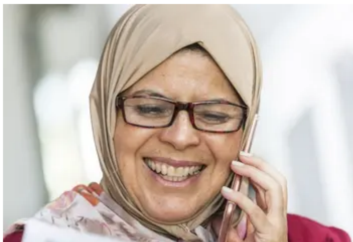
Toynbee Hall phone chats

Check out Cardigan Bay Marine Wildlife Centre's live daily dolphin watch from 5am to 11pm. Tune in and you may be lucky enough to spot the pod of bottlenose dolphins that reside in New Quay Bay throughout the year!