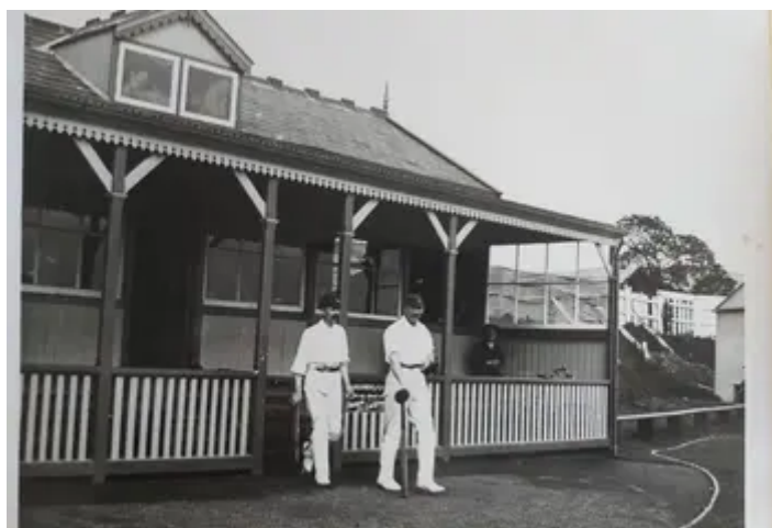
Weekly cricket reminiscence sessions

Become a tree explorer by downloading Forestry England's amazing activity pack. Learn about leaf identification, how to calculate the age of a tree and how to grow your own tree.