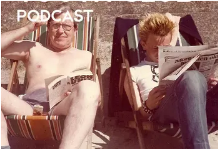
Youth Club Podcast