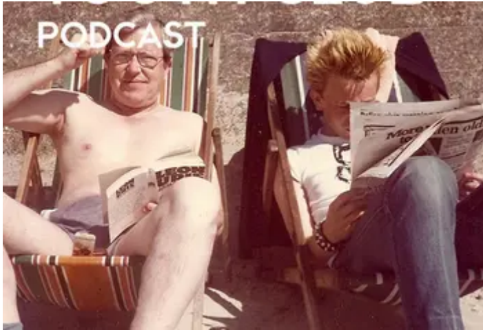
Youth Club Podcast