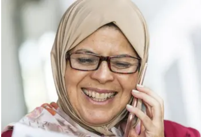
Toynbee Hall phone chats

bored during isolation. You can also participate in their Tower Hamlets Phone Befriending Service , which brings together people with shared interests for a regular chat over the phone.