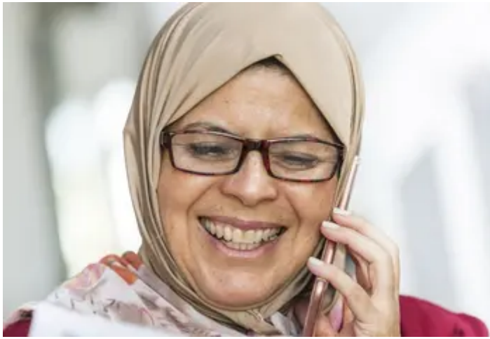
Toynbee Hall phone chats

Check out Cardigan Bay Marine Wildlife Centre's live daily dolphin watch from 5am to 11pm. Tune in and you may be lucky enough to spot the pod of bottlenose dolphins that reside in New Quay Bay throughout the year!