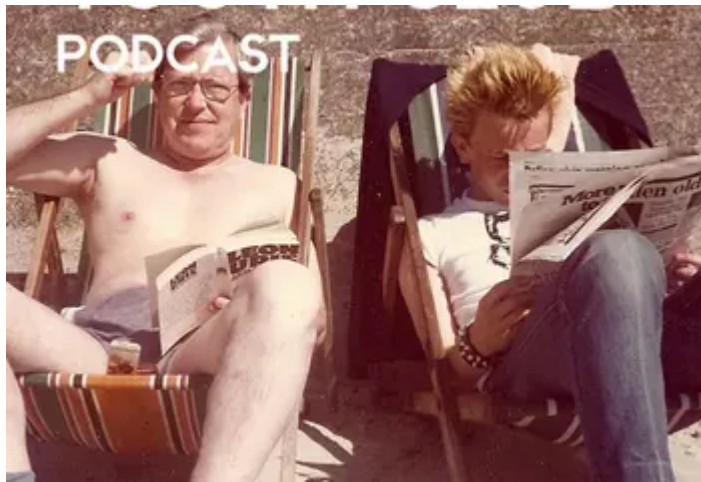
Youth Club Podcast