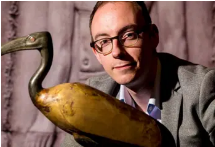
Egyptology in Lockdown