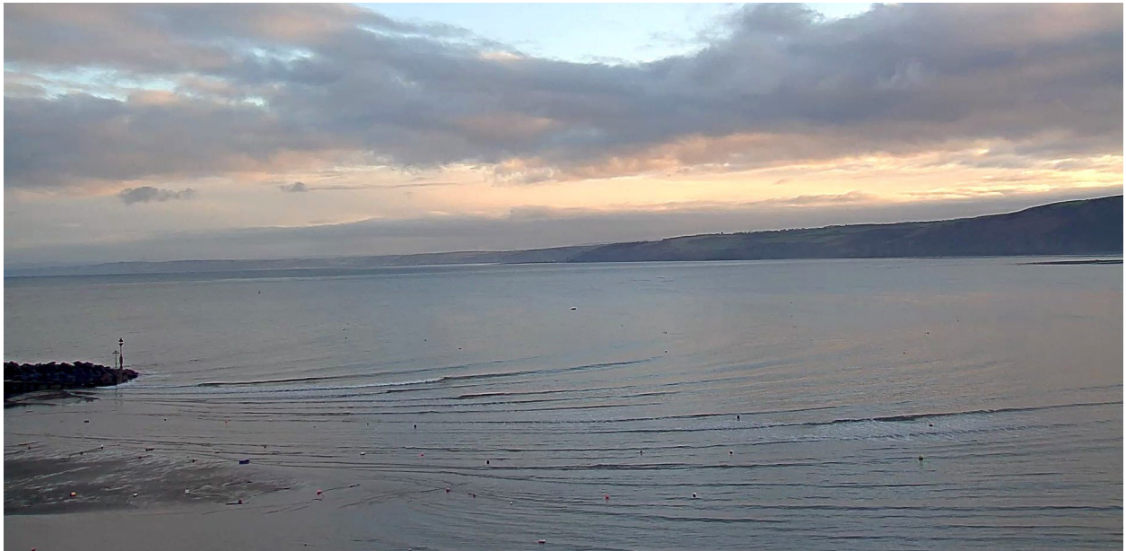
New Quay, Cardigan Bay live daily dolphin watch from 5am to 11pm

Bring the whole family together for a nature break with North Pennines AONB . Every day at 8am during February they will post fun outdoor activities on their Twitter page.