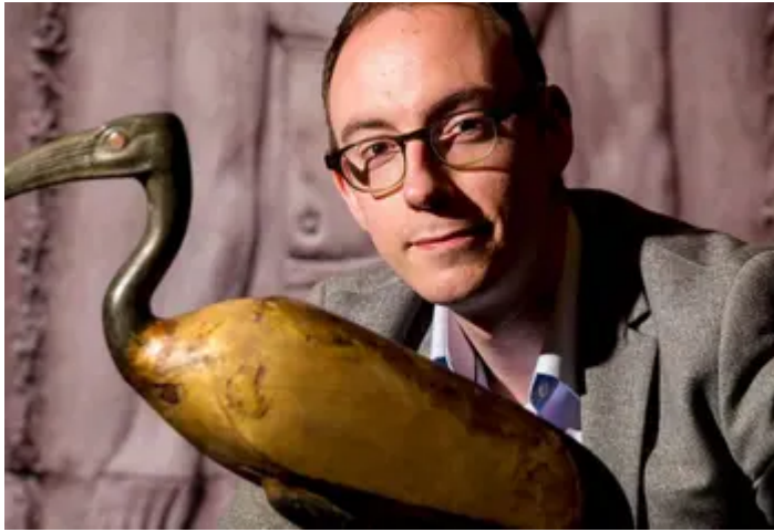
Egyptology in Lockdown