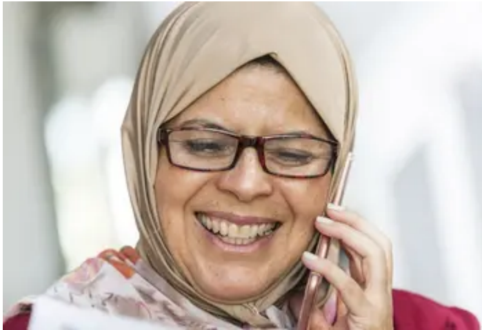
Toynbee Hall phone chats

bored during isolation. You can also participate in their Tower Hamlets Phone Befriending Service , which brings together people with shared interests for a regular chat over the phone.