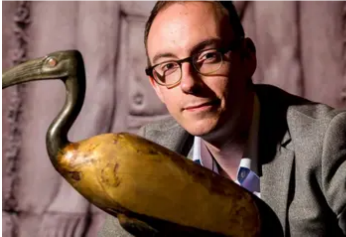
Egyptology in Lockdown