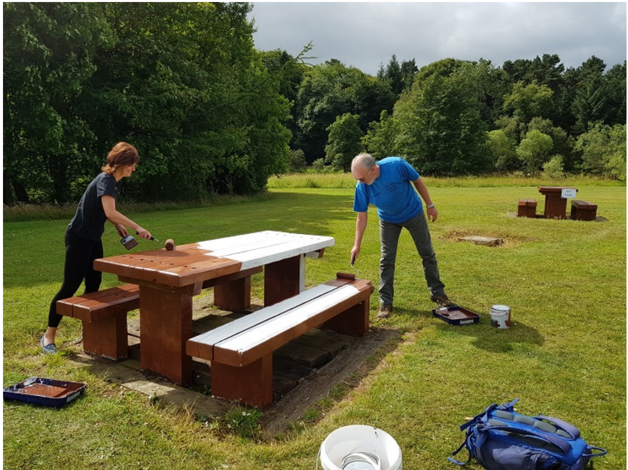
Forth Rivers Trust volunteers carrying out important maintenance tasks