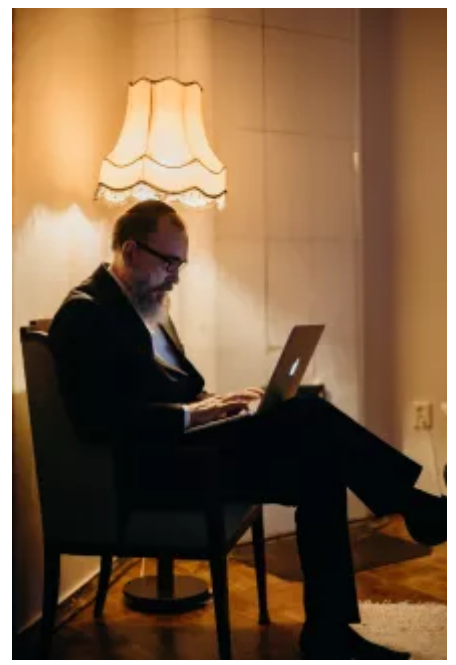
Help us support digital skills in heritage