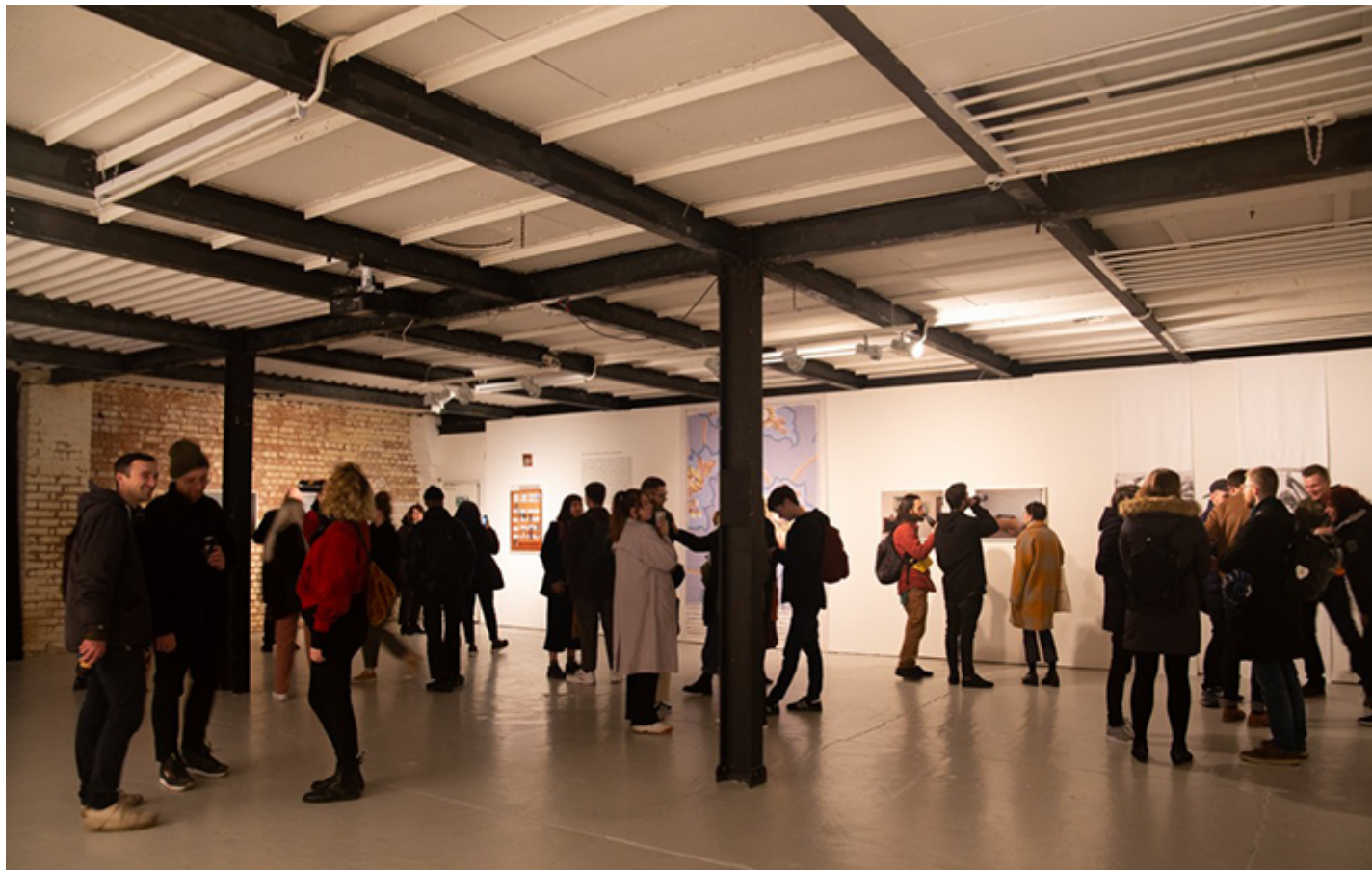
Visitors at an exhibition at Centrala before lockdown.

Centrala was launched in 2012. Since then it has played a significant role in bringing diverse audiences together, and helping people to recognise and understand the arts, culture and heritage of Central and Eastern European communities.