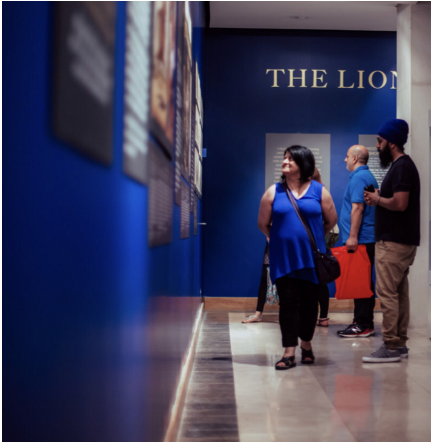
A pre-lockdown exhibition visit

Using a National Lottery grant from our Heritage Emergency Fund, UKPHA was quick to adapt.