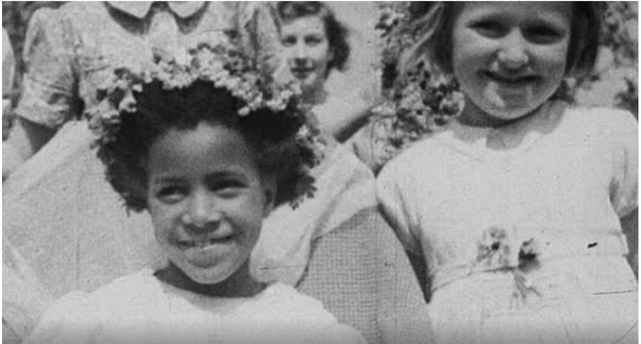
Springtime in an English Village 1944, Crown © Ministry of Information, BFI National Archive

Manchester Museum have uploaded their digital content to a new mobile site called Manchester Museum in Quarantine . Visit for online collections and exhibitions, resources for adults, families and carers and an Encyclopedia of Wondrous Objects. Follow on Twitter at #MMinQuarantine .