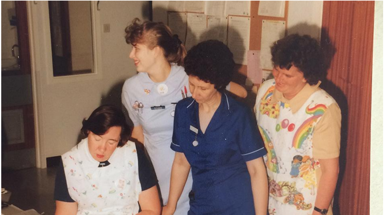
Share your memories of the NHS.

Share your stories of the NHS with the NHS at 70 project . They're creating a Digital Archive of health service history by recording the stories of people who have worked for or been cared for by the NHS since its creation in 1948.