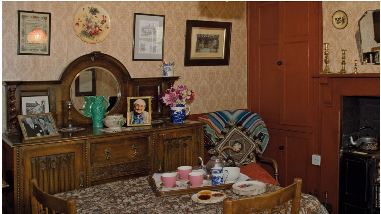
Inside Mrs Smith's Cottage

The Then & Now – 100 Years of Old Swan Women project is gathering memories & hidden stories of women who lived through the First World War in Old Swan in Liverpool. Receive a free resource pack to take part.