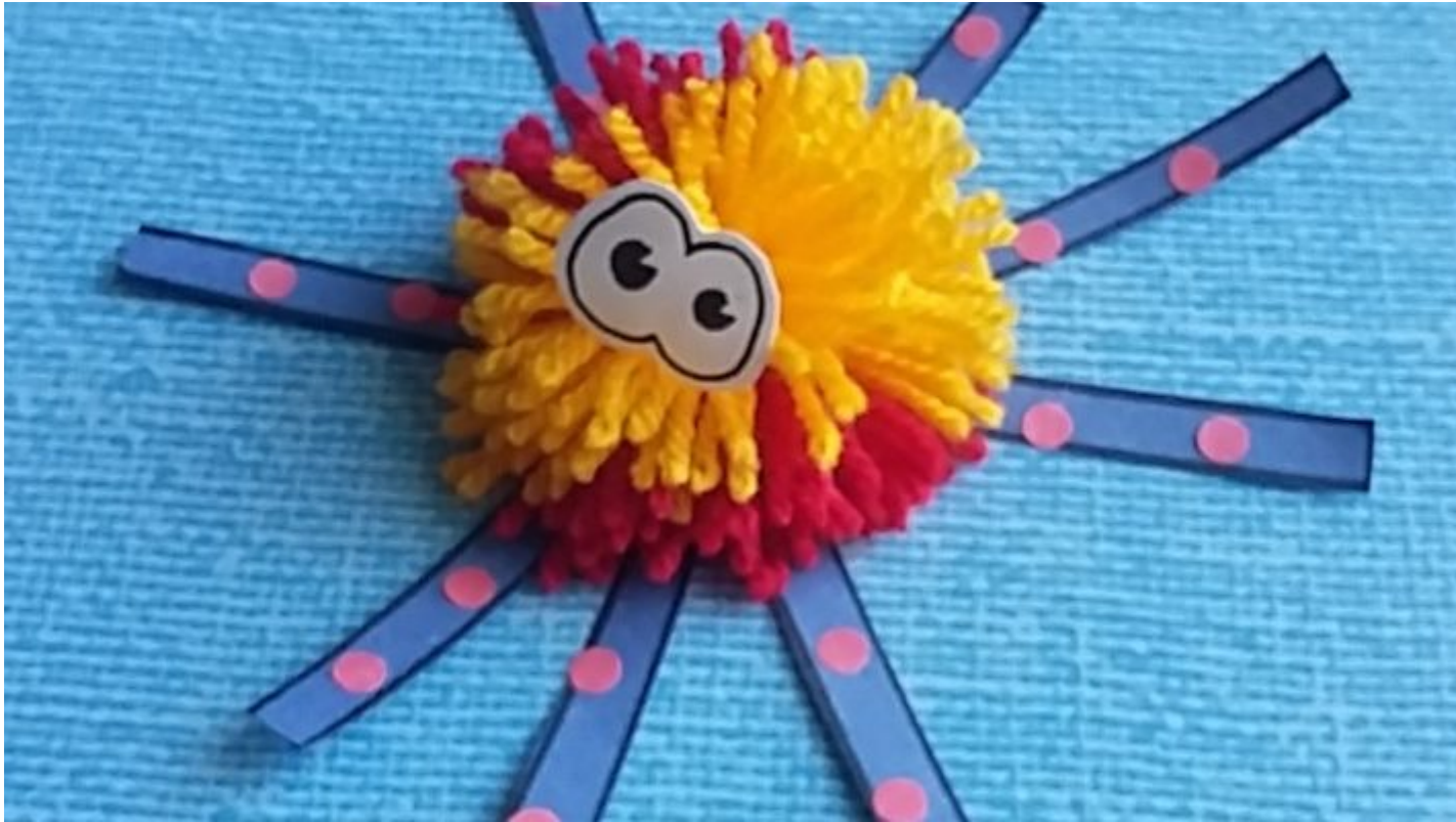
Make a pom pom octopus with Historic Dockyard Chatham

Historic Dockyard Chatham have many a sea-inspired activity available in their new Museum From Home , including arts, crafts, quizzes and kitchen science for kids. Adults can also dive into the dockyard's fascinating collection to discover 400 years of Kent's naval history. Follow on Twitter and Facebook for daily inspiration.