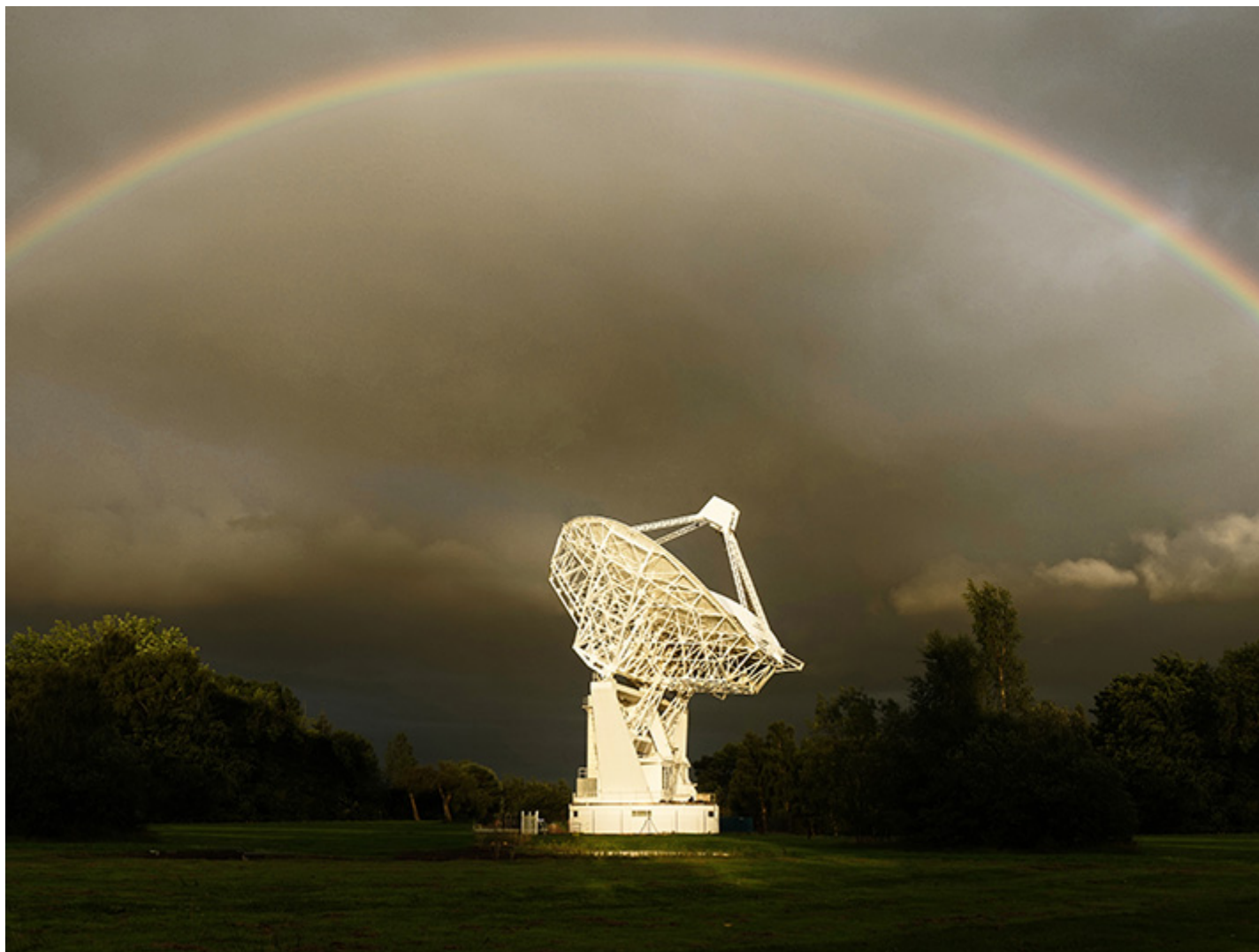
A rainbow arcing over Jodrell Bank Observatory.

Fun and easy things to do to keep the family entertained.