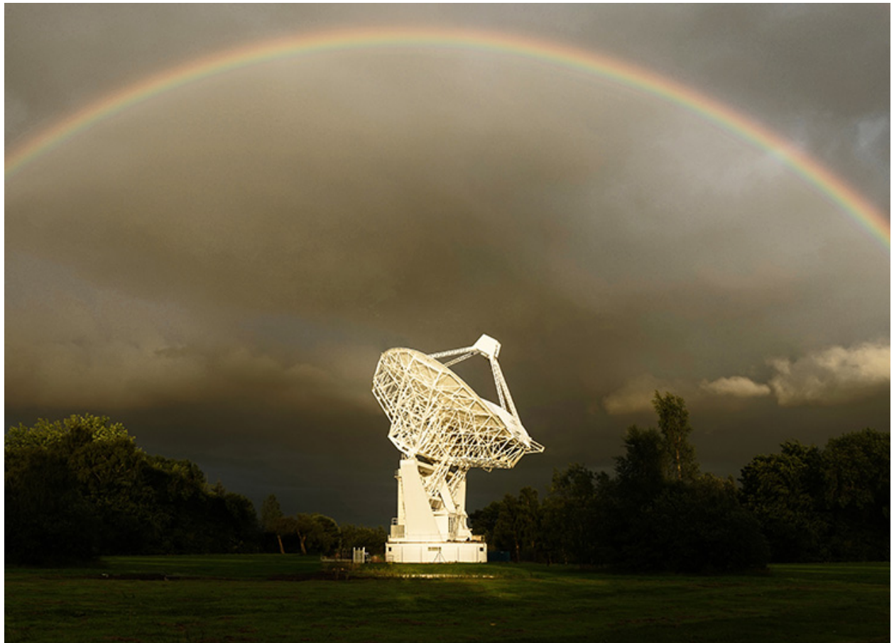
A rainbow arcing over Jodrell Bank Observatory.

Jodrell Bank is exploring Science Learning at Home with themed activities around rainbows, the moon, stargazing, and the iconic Jodrell Bank Observatory itself.