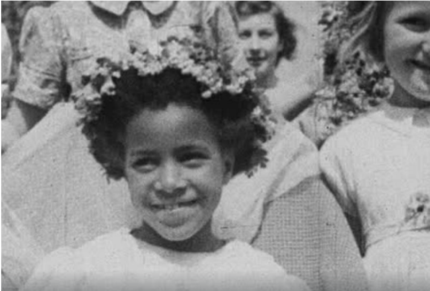
Springtime in an English Village 1944

The BFI's Britain on Film showcases thousands of preserved films taken from the last 120 years of British life. These can be easily searched by location, subject and decade using the Britain on Film map . Help improve the map by identifying locations you see in the archive films. You can also use BFI Player to find more heritage films , including moving images from the Victoria Film collection – “the last great invention of the age”.