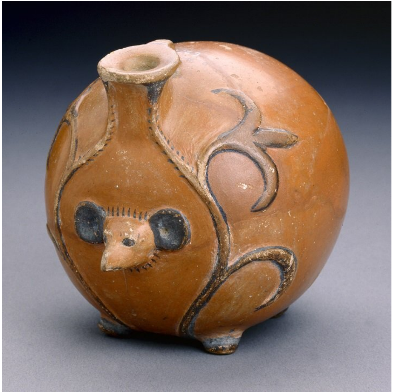
Pottery vessel in the shape of a hedgehog, 1500BC, Abydos, Egypt – The Ashmolean Museum – The inspiration behind the #IsolationCreation above

Why not get scribbling with the Royal Academy's Daily Doodle? Each day the gallery offers up a topic, from people's home workspaces to "happy apples". Share your masterpiece with #RADailydoodle .