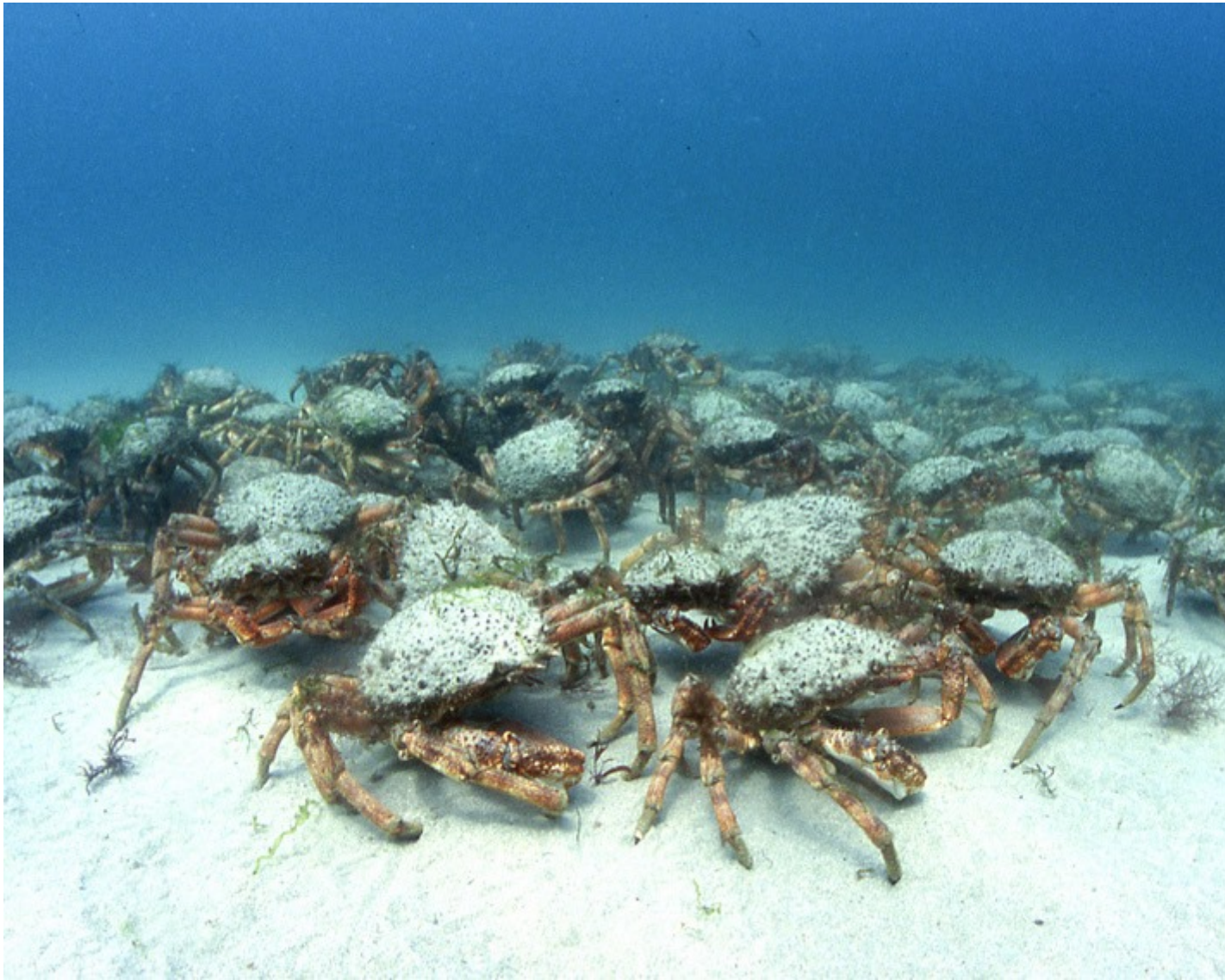
Explore the Welsh coastline with Living Seas Wales. Spider crabs.

The Mary Rose Museum website has put together some fun historical crafts .