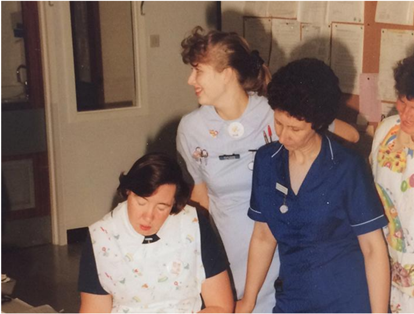
Share your memories of the NHS.

Share your stories of the NHS with the NHS at 70 project . They're creating a Digital Archive of health service history by recording the stories of people who have worked for or been cared for by the NHS since its creation in 1948.