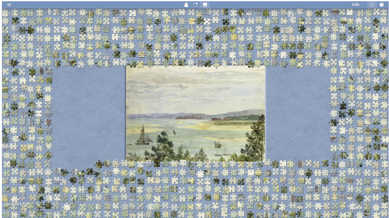
Drawing of a view of Exmouth: online jigsaw puzzle, Devon & Exeter Institution

National Galleries Scotland have been working with PAMIS ( Promoting A More inclusive Society ) to create sensory stories which support people with profound and multiple learning disabilities to access heritage. These stories, inspired by sculptures in the gallery, have been adapted so that people can use them with objects found at home. Investigate the Kolbenneblok and the little magic pit, have conversations with magic stones, and find out how the robin got his red breast.