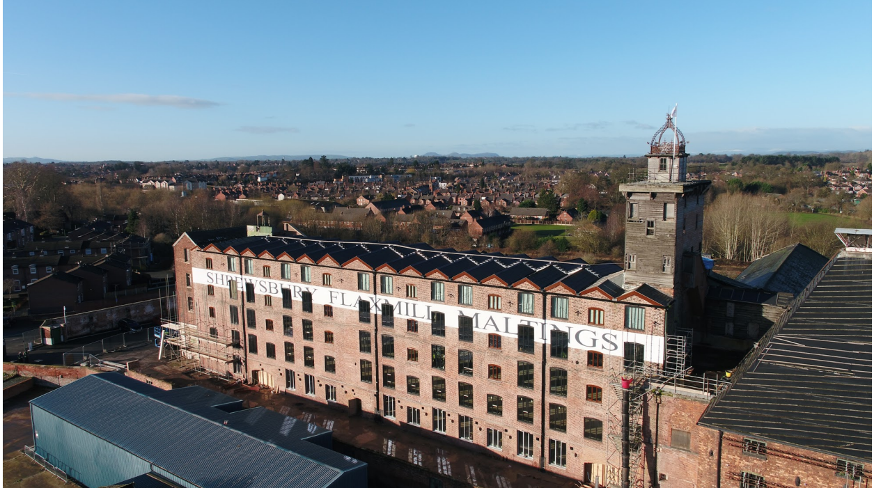
January 2019 – Front of the Main Mill at Shrewsbury Flaxmill Maltings.

Shrewsbury Flaxmill Maltings is a monument to the industrial revolution. Its Main Mill, built in 1797, was the world's first iron-framed building. A partnership led by Historic England is saving and restoring the buildings after years of dereliction. You can take a virtual tour of the building site as it was in 2019.