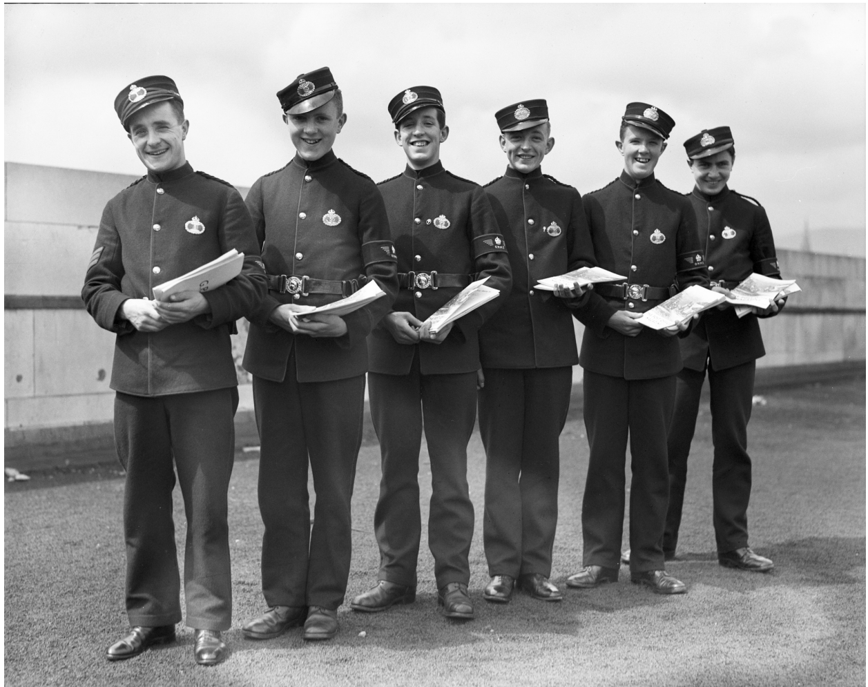
Messenger boys, Belfast 1935.

Explore the National Army Museum's collection s, which showcase the British Army's role as protector, aggressor and peacekeeper from the British Civil Wars to the modern day.