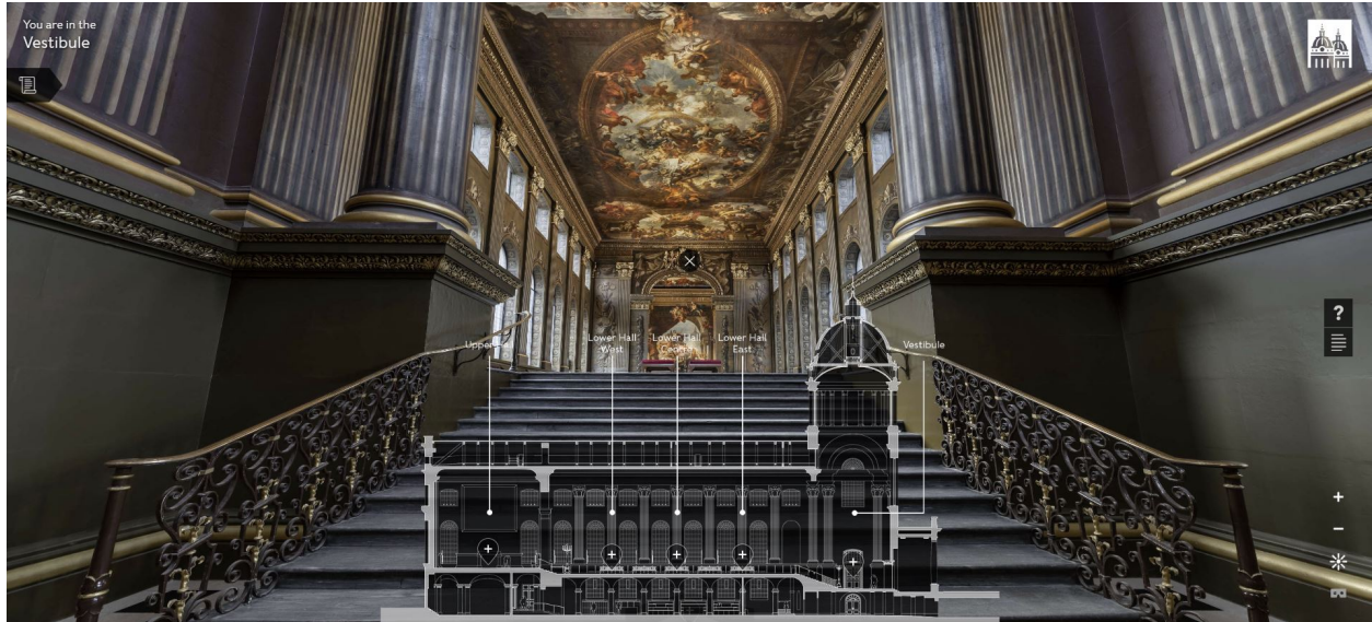
Inside the Painted Hall

The Painted Hall in Greenwich, London, was designed to be a public display of magnificence , reflecting the power and prestige of the Royal Navy. Explore this magnificent Baroque masterpiece from the comfort of your own home through a new 360 degree virtual tour , with descriptions available in British Sign Language.