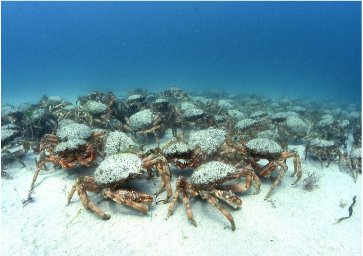
Explore the Welsh coastline with Living Seas Wales. Spider crabs.

The Mary Rose Museum website has put together some fun historical crafts .