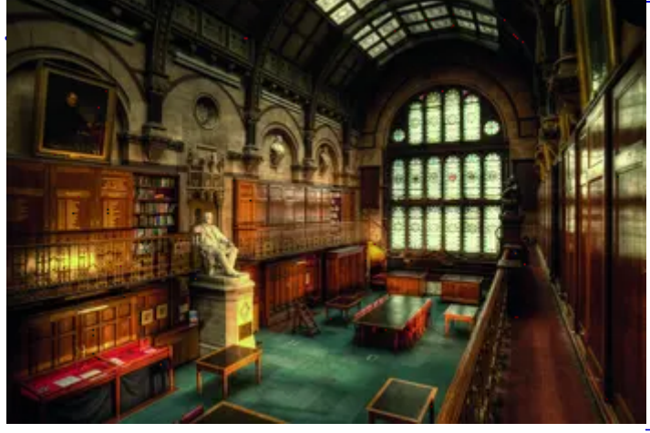
Bydd neuadd yn Sefydliad Mwyngloddio, yn cael ei adnewyddu

From revolution to regeneration: former industrial powerhouse hits National Lottery