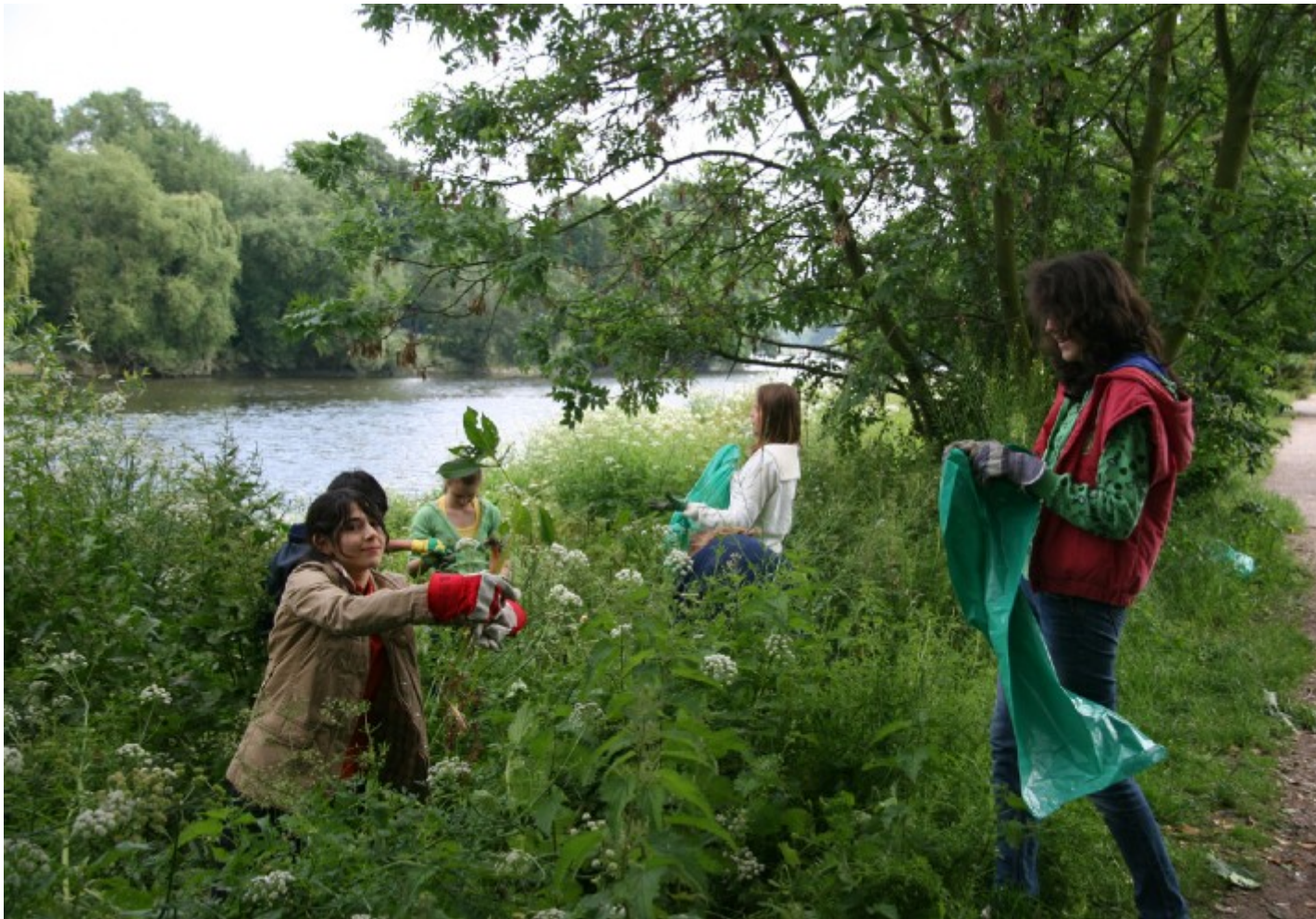
Volunteers in Richmond Park, London

From a lot of the international evidence we see, parks and green spaces can be really good in terms of helping newcomers, especially refugees and migrants, integrate into communities. So things like gardening projects, community projects, or simply a space where people of very different communities can feel safe and feel they can interact with other people.