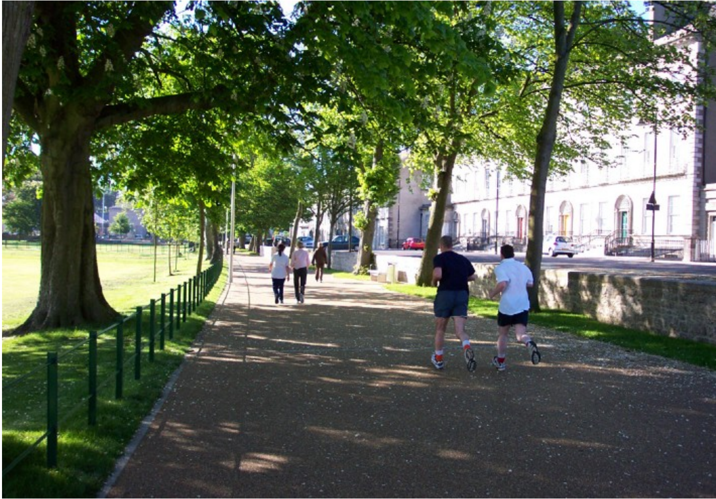
The Mall, Armagh, after restoration

What's really clear from the evidence is that parks are really good for people, people like to use them. But if they feel that those spaces aren't safe, that they aren't well kept – if there's lots of broken glass, signs of drug use, if equipment hasn't been maintained – what is at first a positive becomes a negative. People will actually avoid places they perceive as being dangerous