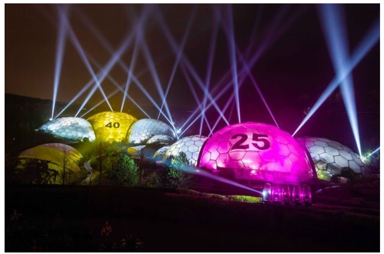
The Eden Project celebrates 25 years of The National Lottery

The Eden Project's massive biomes house the largest rainforest in captivity and year-round events, exhibitions and concerts. It would not have been possible without £56m from The National Lottery.