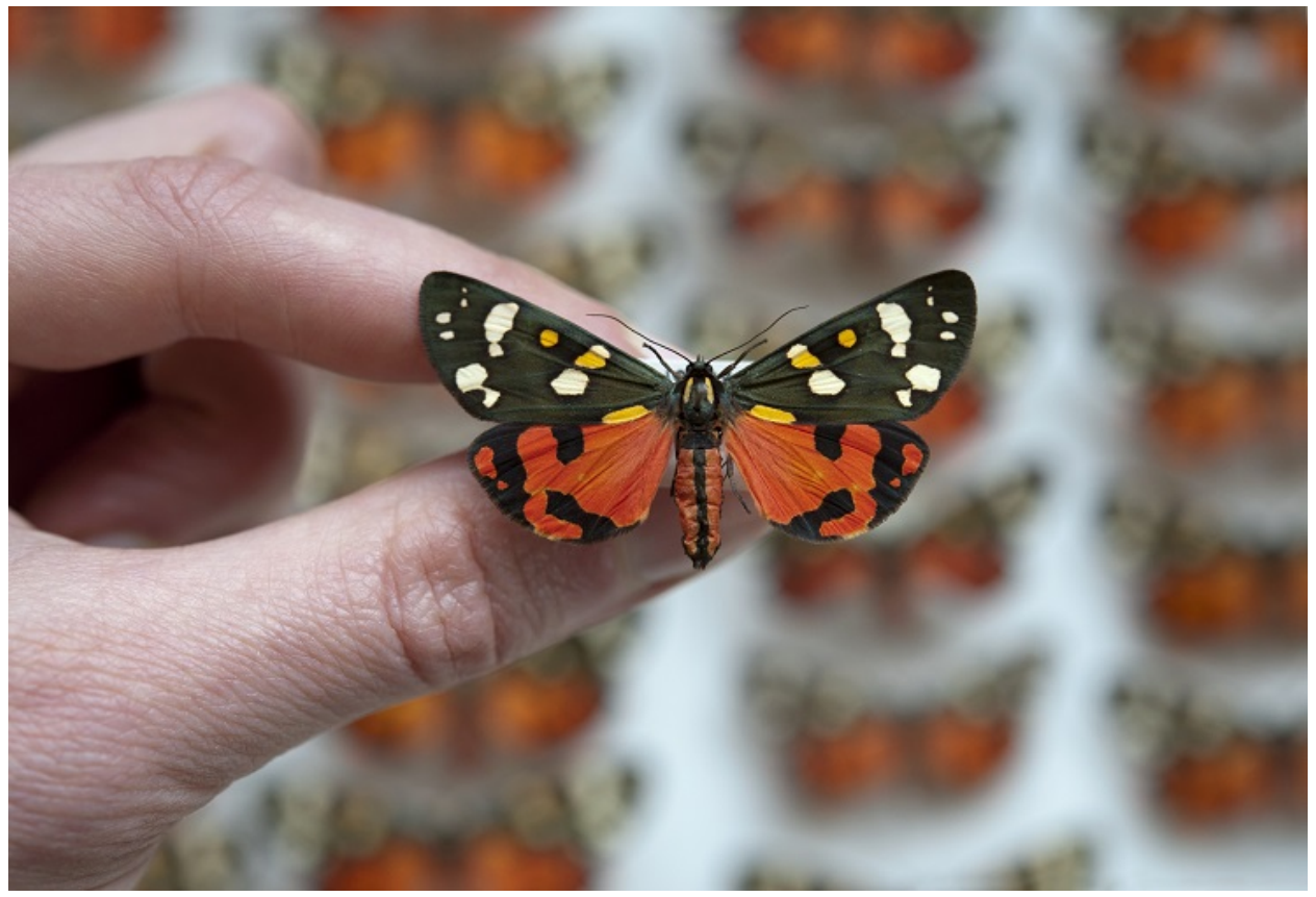
Callimorpha (scarlet tiger moth).

Home to seven million objects, including the world's first scientifically described dinosaur and the only soft tissue remains of the extinct dodo, the museum's latest National Lottery funding will safeguard its collection of one million insects.