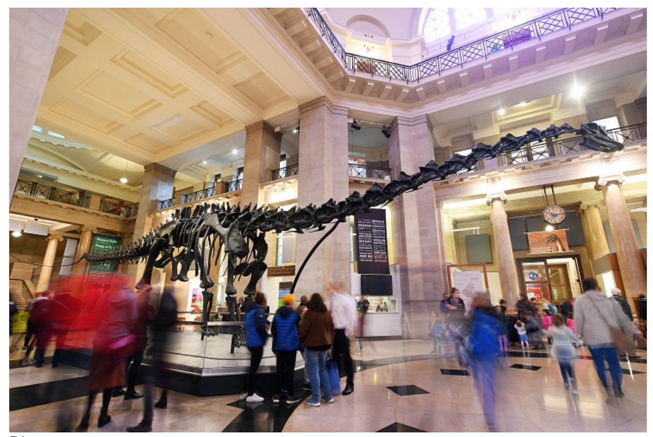
Dippy on tour

Housing <u>world-class art</u>, natural history and geology collections, National Museum Cardiff has benefited from major National Lottery support over the past 25 years. The museum is also Dippy the Diplodocus' current stop on his National Lottery-funded tour!