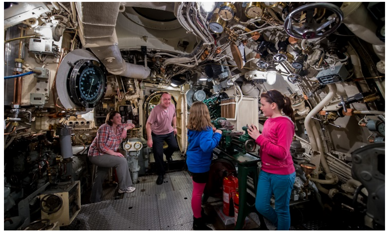
In the engine room of submarine HMS Alliance

The Royal Navy Submarine Museum, part of the National Museum of the Royal Navy, charts the development of submarines from the time of Alexander the Great to the present day. Visitors can board HMS Alliance , the only remaining Second World War-era submarine, which was restored with £6.4m of National Lottery funding.