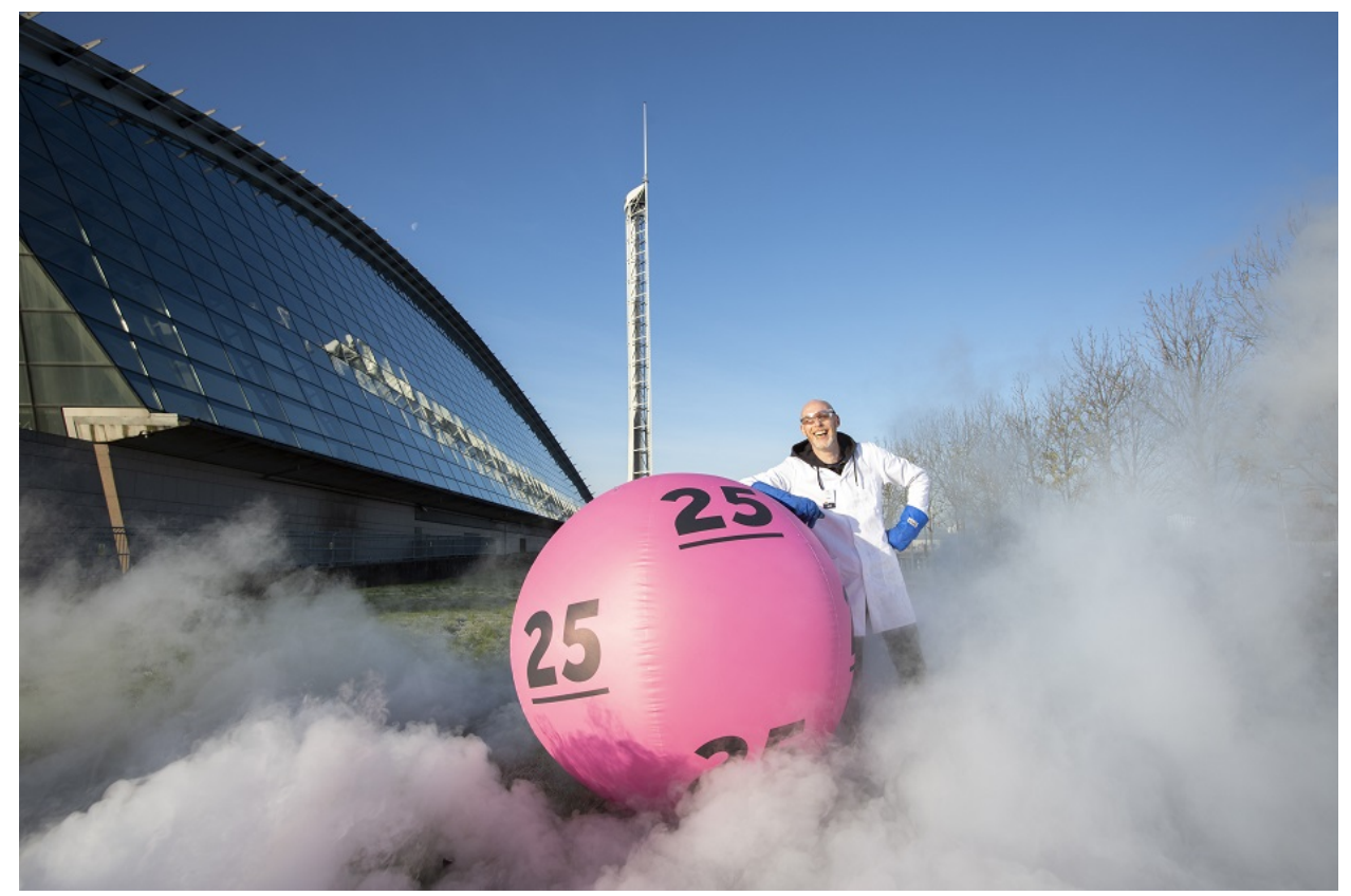
Glasgow Science Centre receives a flamboyant visitor in 2019

Hundreds of interactive exhibits bring science and technology to life at one of Scotland's most popular attractions, which opened thanks to £36m from The National Lottery.