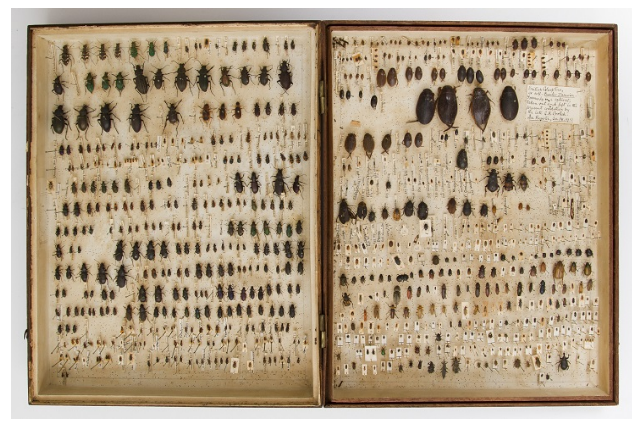
"Forms most beautiful and most wonderful" - Charles Darwin

Giant ground sloths and a box of beetles collected by Charles Darwin himself are just some of the fascinating specimens at the museum. <u>It reopened in 2018</u> following a major redevelopment supported by £2m from The National Lottery.