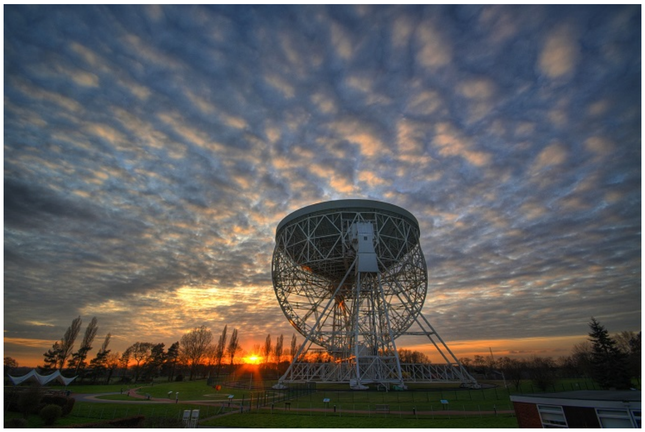
The striking Jodrell Bank.

With one of the most powerful radio telescopes in the world, Jodrell Bank offers visitors the opportunity to explore the wonders of the universe. The National Lottery-funded <u>First Light Project</u> will reveal some incredible stories and feats of engineering in a new gallery and interpretation space opening in 2021.