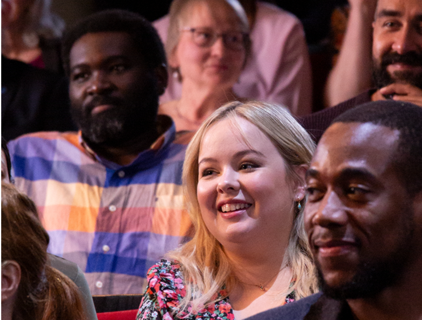
Derry Girls star Nicola Coughlan was in the crowd to celebrate National Lottery funding

Athletes, stars of the screen and other famous faces add their ideas to a fast-growing list of how £40 billion of National Lottery funding has changed people's lives in the areas of sport, arts, community and heritage.