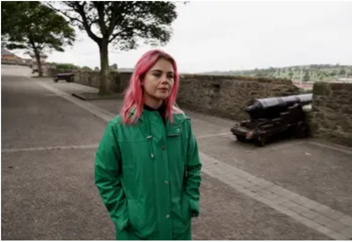
al Lottery players