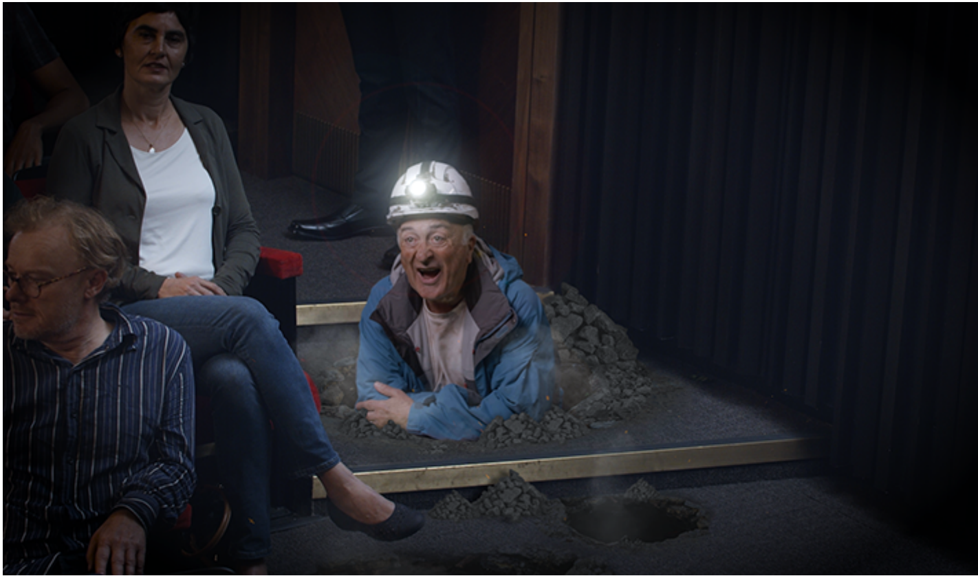
Tony Robinson emerges from the floor to celebrate funding for archaeology

Jimmy Carr concludes: “Right, but apart from charities, Wembley Stadium, community projects, medals, the Angel of the North, heritage sites, films, support for homeless people, green spaces, archaeology and wildlife – what’s The National Lottery ever done for us?”