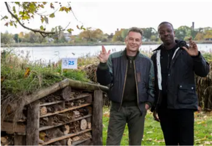
of her home city

Chris Packham and Jamal Edwards celebrate 25 years of funding for nature