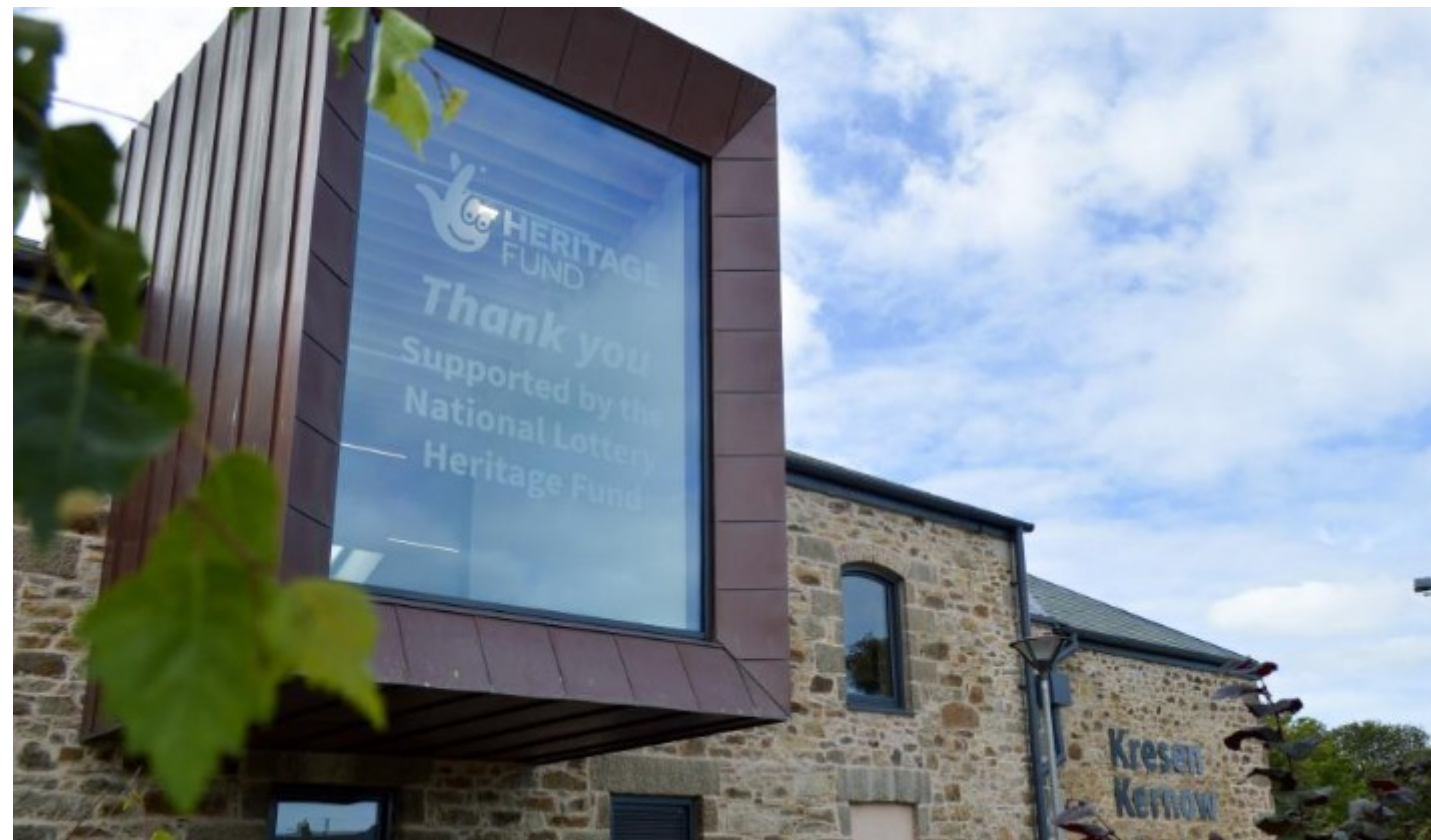
A big thank you from Kresen Kernow in Cornwall