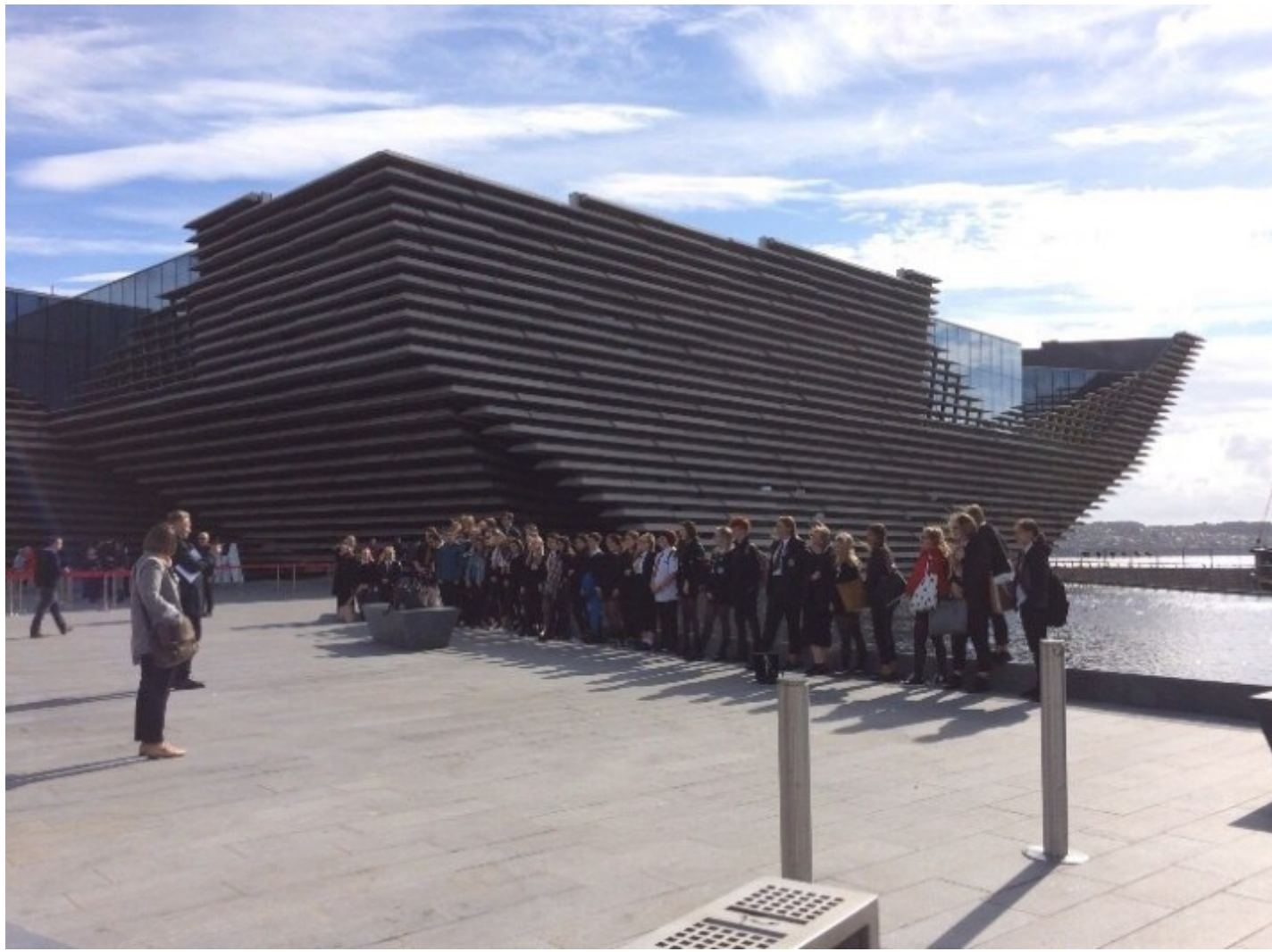
The opening of V&A Dundee

Now I love that my job is sharing heritage stories, and some of my favourite memories of working at The National Lottery Heritage Fund have been made while visiting fabulous projects to create films. Like having a ride on a fire truck in Rochdale, discovering inspiring stories at the International Bomber Command Centre in Lincolnshire, visiting Dundee for the first time for the opening of the V&A Dundee, and learning about the skill of gardening when interviewing a trainee at the opening of the Temperate House, Kew.