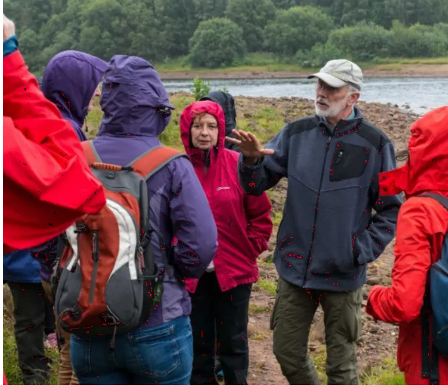
It's 25 years since The National Lottery began. In celebration, staff from The National Lottery Heritage Fund take a look back at some of our favourite memories.