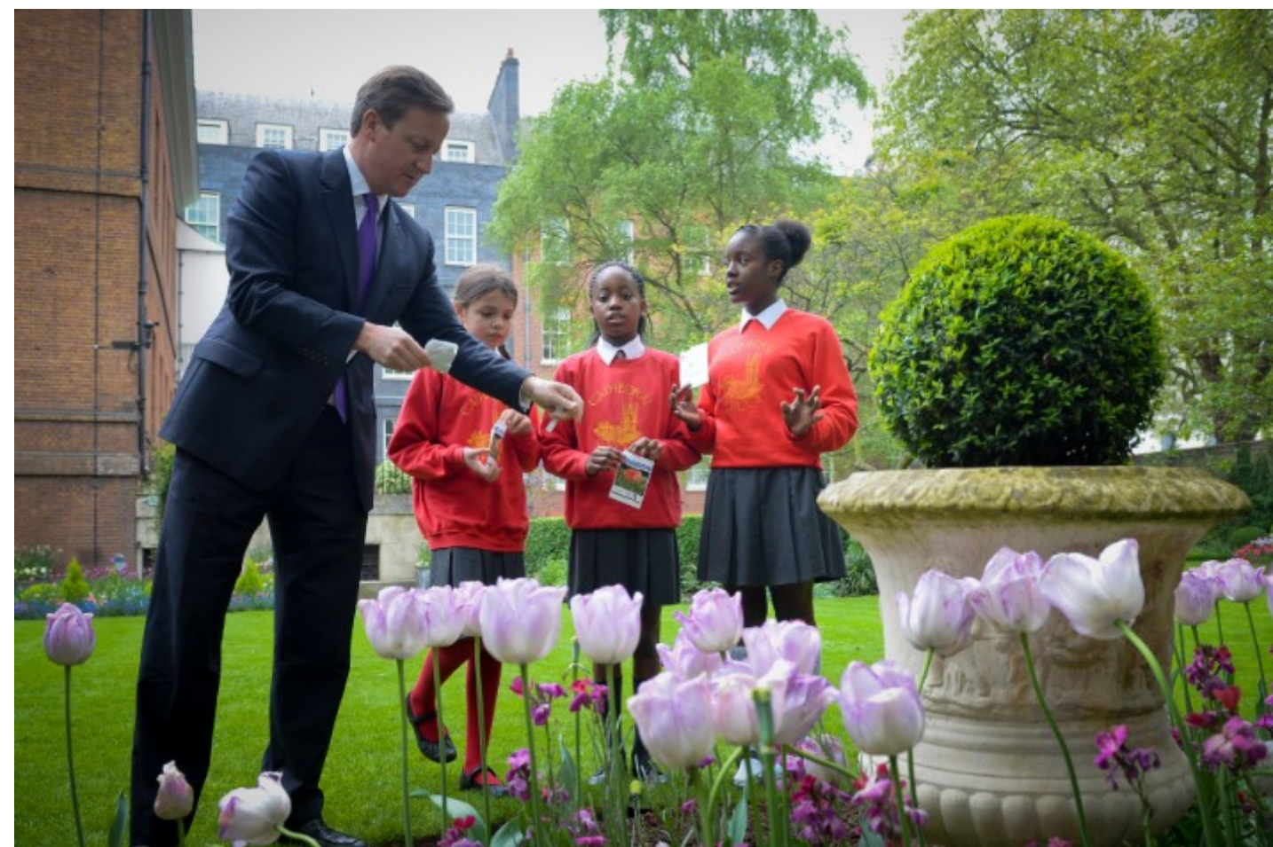
Former prime minister David Cameron helping children sow poppy seeds