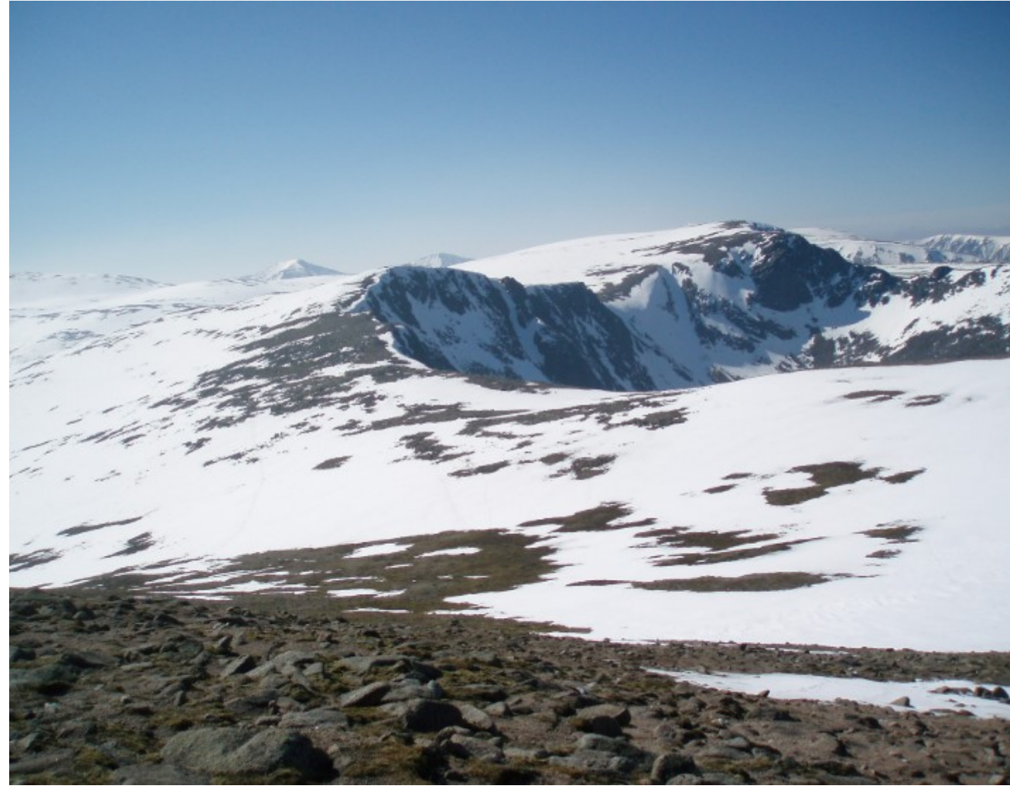
The snowy Cairngorm mountains