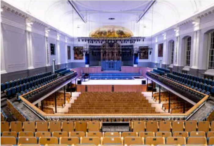
The revamped interior of Aberdeen Music Hall

The gallery opens its doors to the public on Saturday 2 November 2019. Find out more on the Aberdeen Art Gallery website .