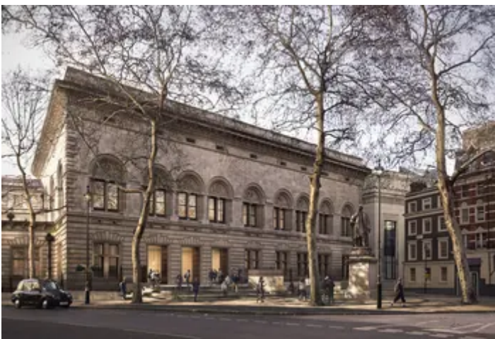
Aberdeen Art Gallery, City of Discovery