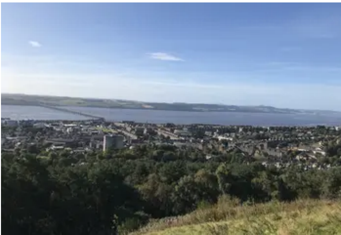
Aberdeen Music Hall