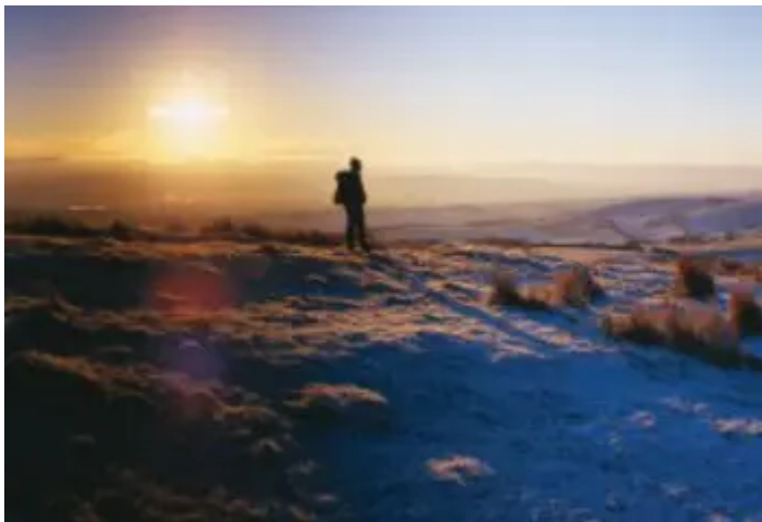
Pendle Hill at sunset

Find out more about the 25th Birthday celebrations .