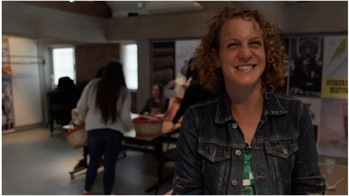
Once a bustling hub of the Industrial Revolution, after years of decline Rochdale is facing a brighter future thanks in part to 25 years of National Lottery investment.