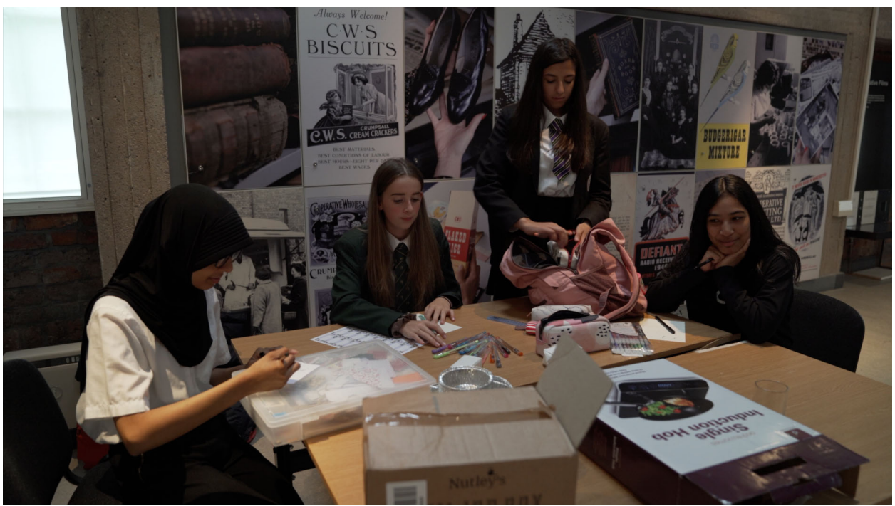
Young people involved with the Pioneers Museum's Exploring Pioneer Places project

It is a town of radical community. Rochdale is where the modern co-operative movement began 175 years ago this December. On 21 December 1844, the Rochdale Society of Equitable Pioneers opened their Toad Lane shop. Set up to sell food at affordable prices during a time of hardship, it sparked a global movement.