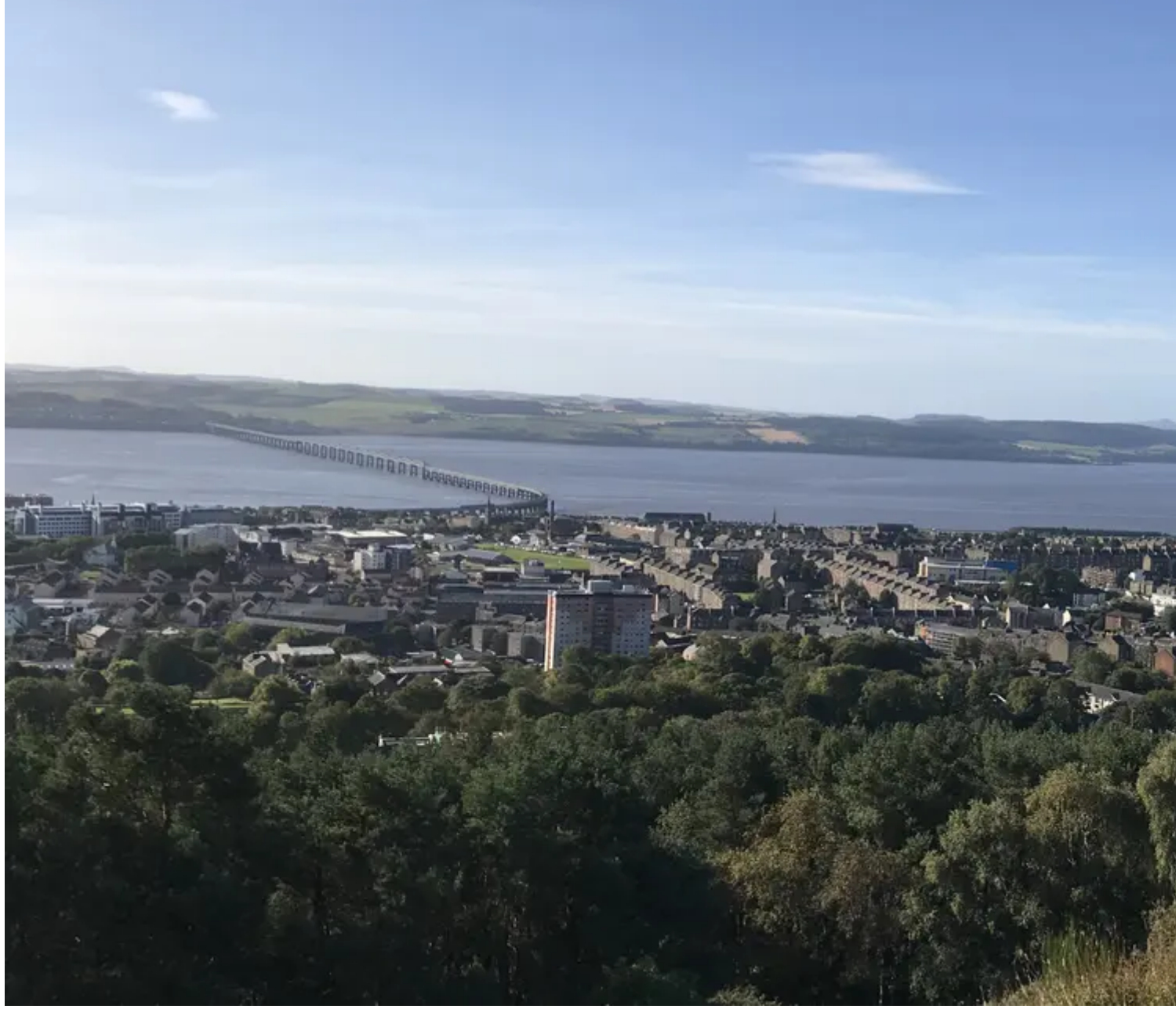
To celebrate The National Lottery's 25th Birthday, we follow the 'Silv'ry Tay' to see how our funding has transformed Dundee.