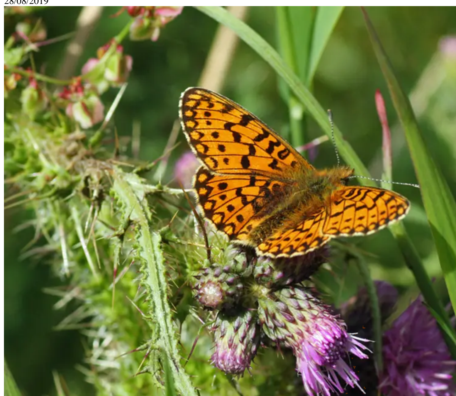
Funding will help restore over 540 hectares of neglected landscape and habitat, once known as the Alps of Glamorgan.

The Lost Peatlands of South Wales project is aiming to restore a historic peatland landscape and to help people enjoy their local outdoor space.