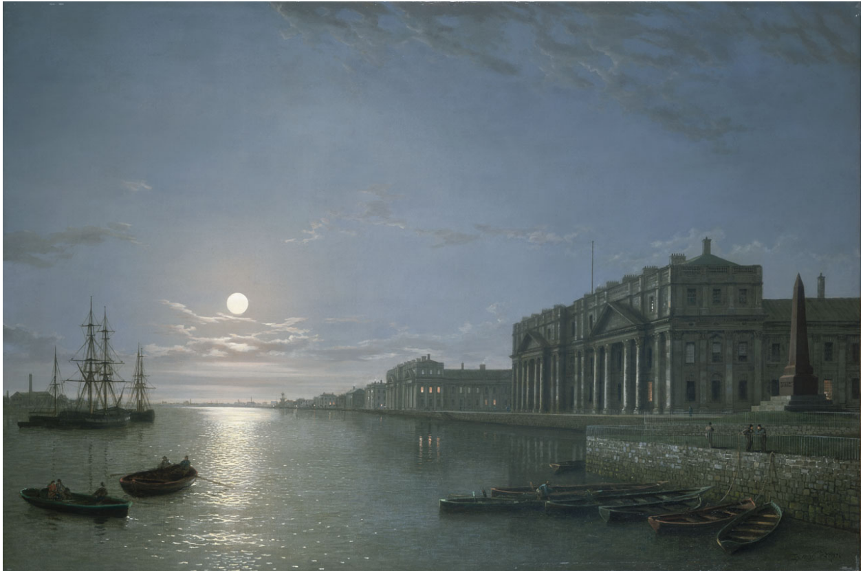
The Thames and Greenwich Hospital by Moonlight by Henry Pether.

The largest exhibition in the UK dedicated to the moon opens on 19 July at the National Maritime Museum.